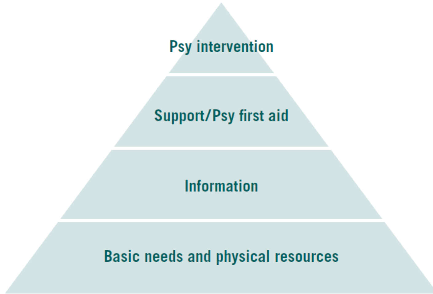
Figure 1: Stepped psychological response