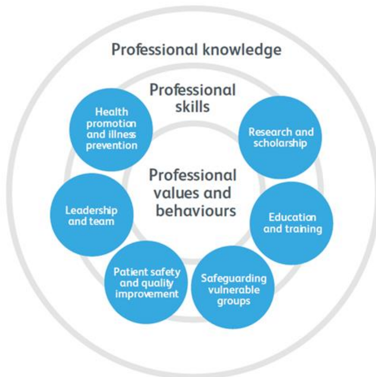
The nine domains of the GMC's Generic Professional Capabilities

Good medical practice (GMP) 2 is embedded at the heart of the GPC framework. In describing the principles, duties and responsibilities of doctors the GPC framework articulates GMP as a series of achievable educational outcomes to enable curriculum design and assessment.