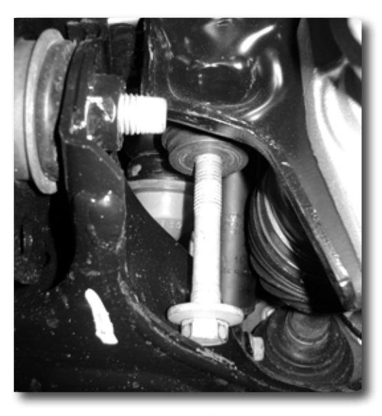
Figure 4 - Drivers Side Shown

13. Doing one side at a time, remove the 2 mounting bolts and lower the jack to allow enough clearance for the provided differential drop spacers. Figure 4