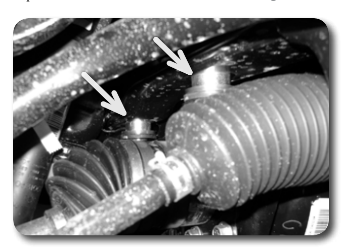
Figure 5 - Passenger Side with spacers installed

16. Once all 4 spacers have been installed, tighten bolts to 112 ft-lbs.