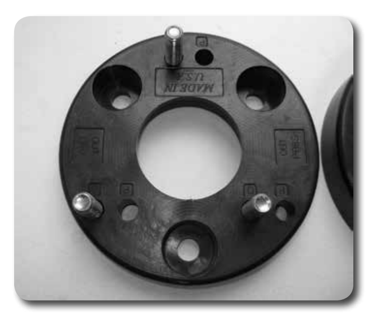
Figure 8C - Driver's Side Shown

14. 2009-2013 Model Years: Install the new spacer on the strut and fasten with the original mount nuts. The spacers are labeled to indicate which side will face 'out' on the vehicle once they are installed. The studs need to be opposite of the factory studs. Figure 9 Torque nuts to 35 ft-lbs.