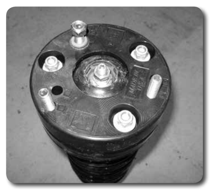
Figure 9 - Passenger's Side Shown

14. 2009-2013 Model Years: Install the new spacer on the strut and fasten with the original mount nuts. The spacers are labeled to indicate which side will face 'out' on the vehicle once they are installed. The studs need to be opposite of the factory studs. Figure 9 Torque nuts to 35 ft-lbs.