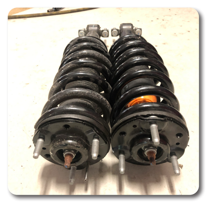
Figure 11B (Strut on the right has the top hat rotated 180 degrees, strut on the left is stock orientation with the bar pin angle the same)