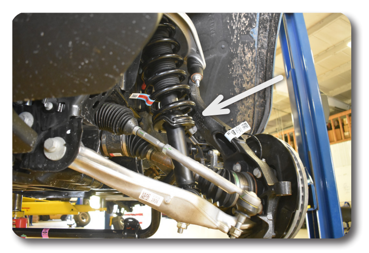
Figure 13C (Driver Side viewed from the front)