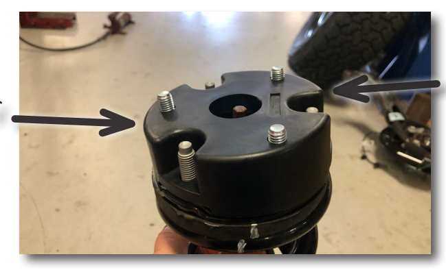
Out towards tire (high side of the taper)