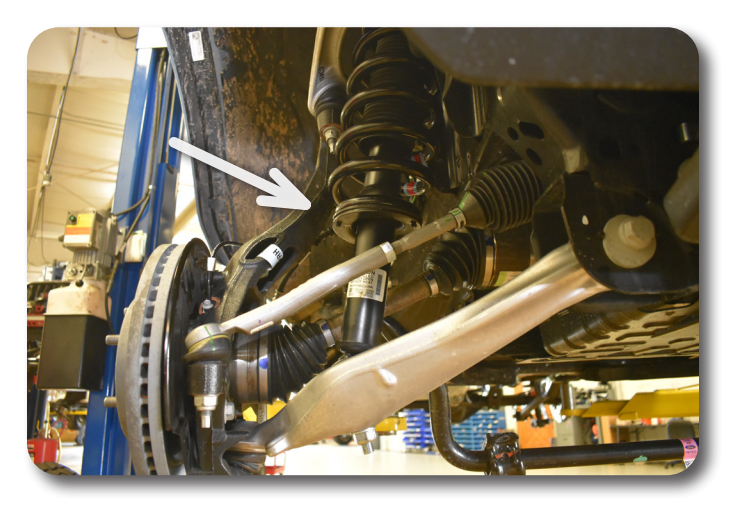
Figure 13D (Passenger Side viewed from the front)