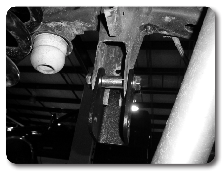
Figure 9 - LHD Shown

14. Reinstall the track bar bracket with the 9/16" hardware along with the provided 0.750" x 1.520" crush sleeve inside the factory mount. Run the bolt through the new bracket, factory mount and sleeve Figure 9. Leave hardware loose.