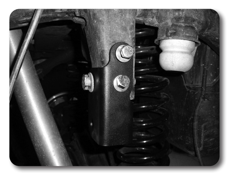
Figure 10 - LHD Shown

15. Fasten the new bracket to the frame through the outer holes using the provided 7/16" hardware. The bottom hole uses the larger diameter USS washer on the inside to go against the slot in the frame. Torque 7/16" hardware to 40 ft-lbs Figure 10.