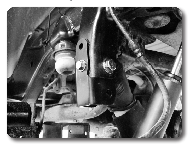
Figure 8b - RHD Shown

14. Reinstall the track bar bracket with the 9/16" hardware along with the provided 0.750" x 1.520" crush sleeve inside the factory mount. Run the bolt through the new bracket, factory mount and sleeve Figure 9. Leave hardware loose.