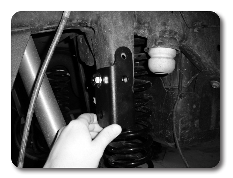
Figure 8a - LHD Shown