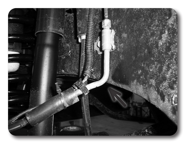
Figure 4c - After