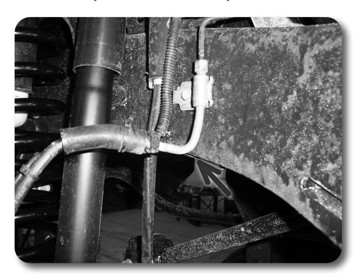
Figure 4b - Before

All model years: Check the slack in the brake lines by turning the wheels from lock-to-lock. It may be necessary to slightly reform the brake line hardline at the frame down about 10-15 degrees to provide more slack in the line Figure 4b/c. Carefully bend the hard line with your hands.