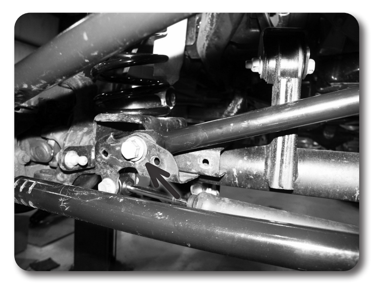
Figure 1 - Left Hand Drive Shown