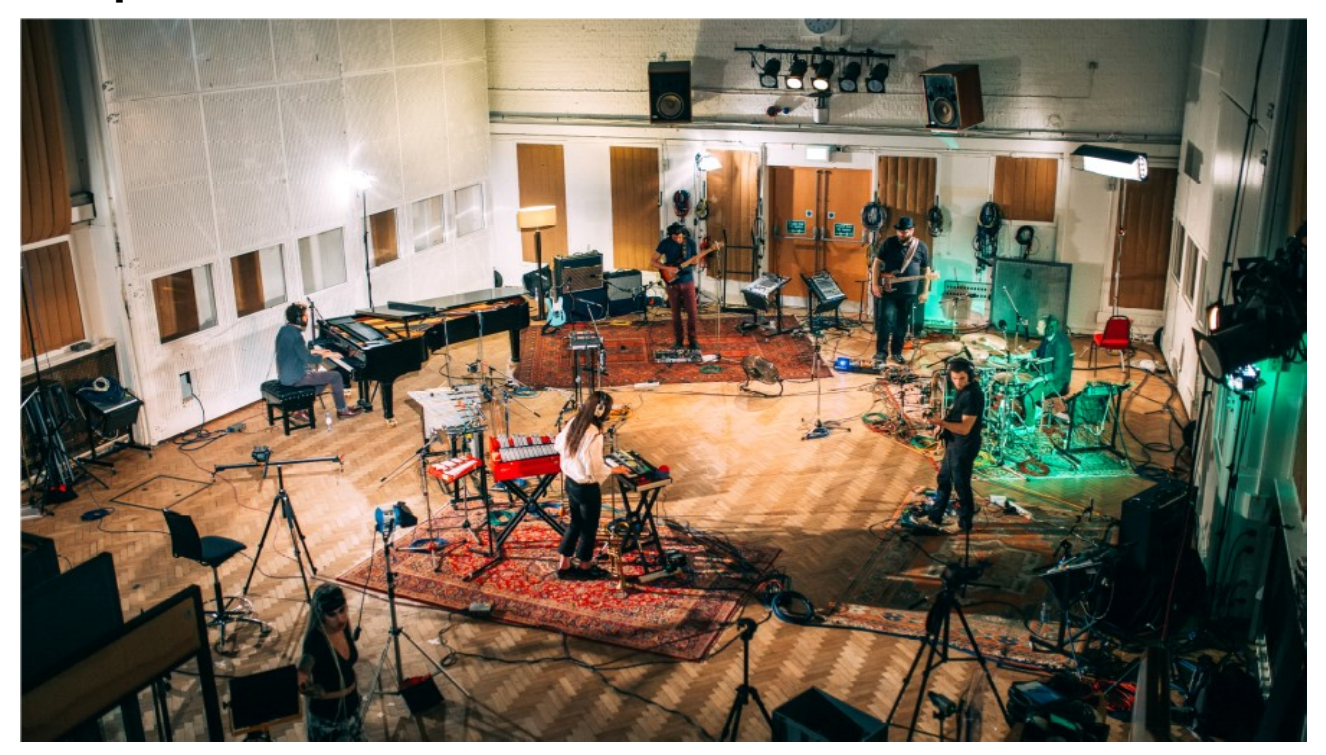
Abbey Road Studios session – June 2015