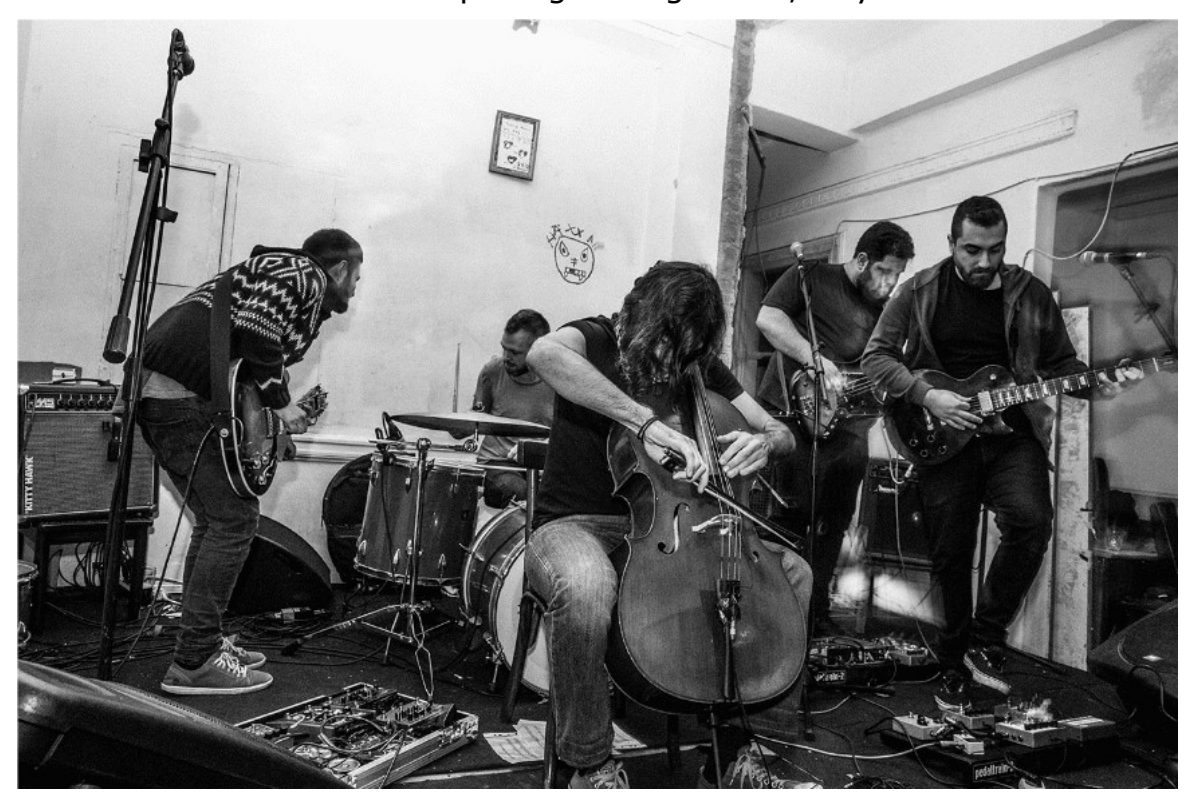
Collective Rememberance live at Boiler, Athens, Greece, february 2018