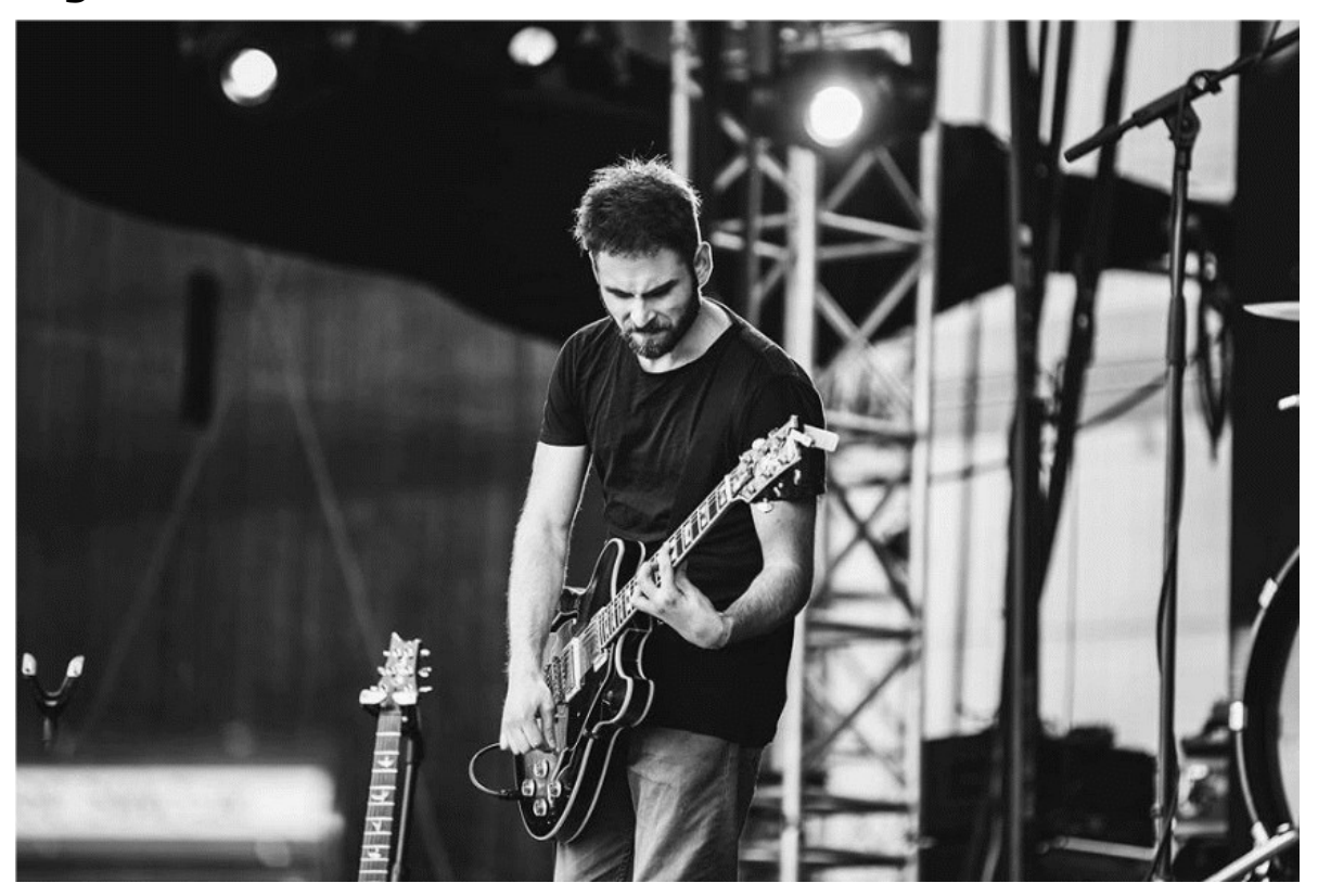
Athens Release Festival – opening for Sigur Ros, July 2016