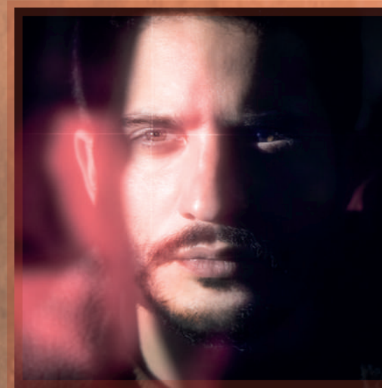
JACOBO GRC Producer / DOP