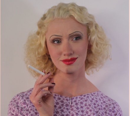
Above: 1930's styled wig made completely from scratch by me