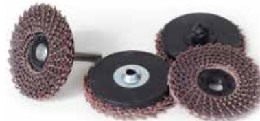
Made with Abranet Max by MIRKA

Abranet Max is a unique net abrasive suited for a variety of sanding applications on aluminum and other soft metals. This abrasive material resists clogging and the work piece stays cool maintaining original structure. ABRANET MAX proprietary components and manufacturing process result in high cutting rate and long life through balanced wear. No other abrasives can match ABRANET MAX when it comes to working on aluminum and other soft metals.