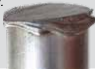
Image of the face of a 1/2" aluminum rod after 30 second of grinding using 40G alugrind Flap Disc.

Melting clearly visible. Work piece reached temperature of over 750 deg F.