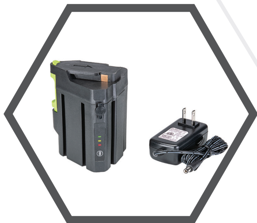
BATTERY and CHARGER