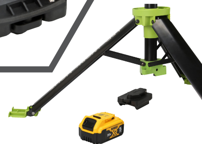
DC Adaptor for 20V DeWalt Battery