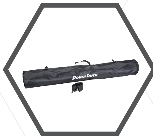
ADJUSTABLE SHOULDER STRAP and BAG FOR TRANSPORT