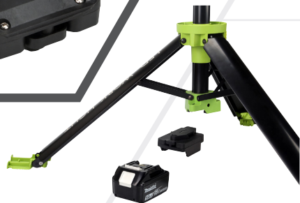
DC Adaptor for 18V Makita Battery