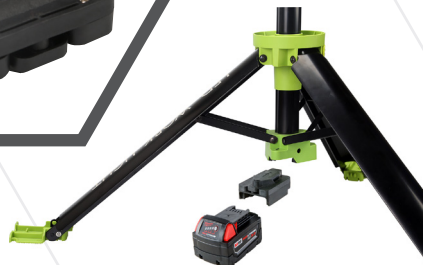
DC Adaptor for 18V Milwaukee Battery