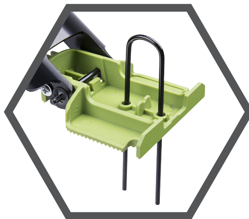
FOOT SPIKES FOR EXTRA HOLD IN TOUGH CONDITIONS