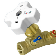
GLOBE & BALANCING