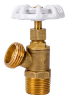
BOILER DRAINS & HOSE BIBS

FASTENERS · TOOLS · MAINTENANCE & SHOP SUPPLIES