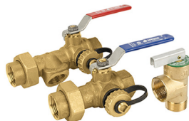
TANKLESS WATER HEATER KITS