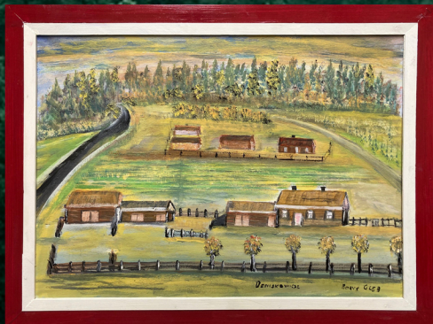
“DENISKOWICZE” -BY BORYS GLEB

YOU CAN CRY AND CLOSE YOUR MIND, BE EMPTY AND TURN YOUR BACK OR YOU CAN DO WHAT HE WOULD WANT: SMILE, OPEN YOUR EYES, LOVE AND GO ON.