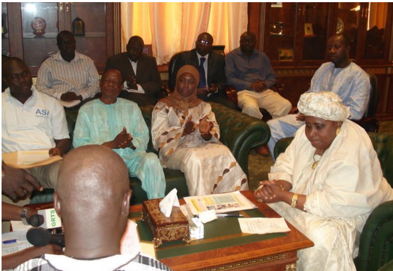
Members of ASI with representatives of other organisations at the presentation ceremony