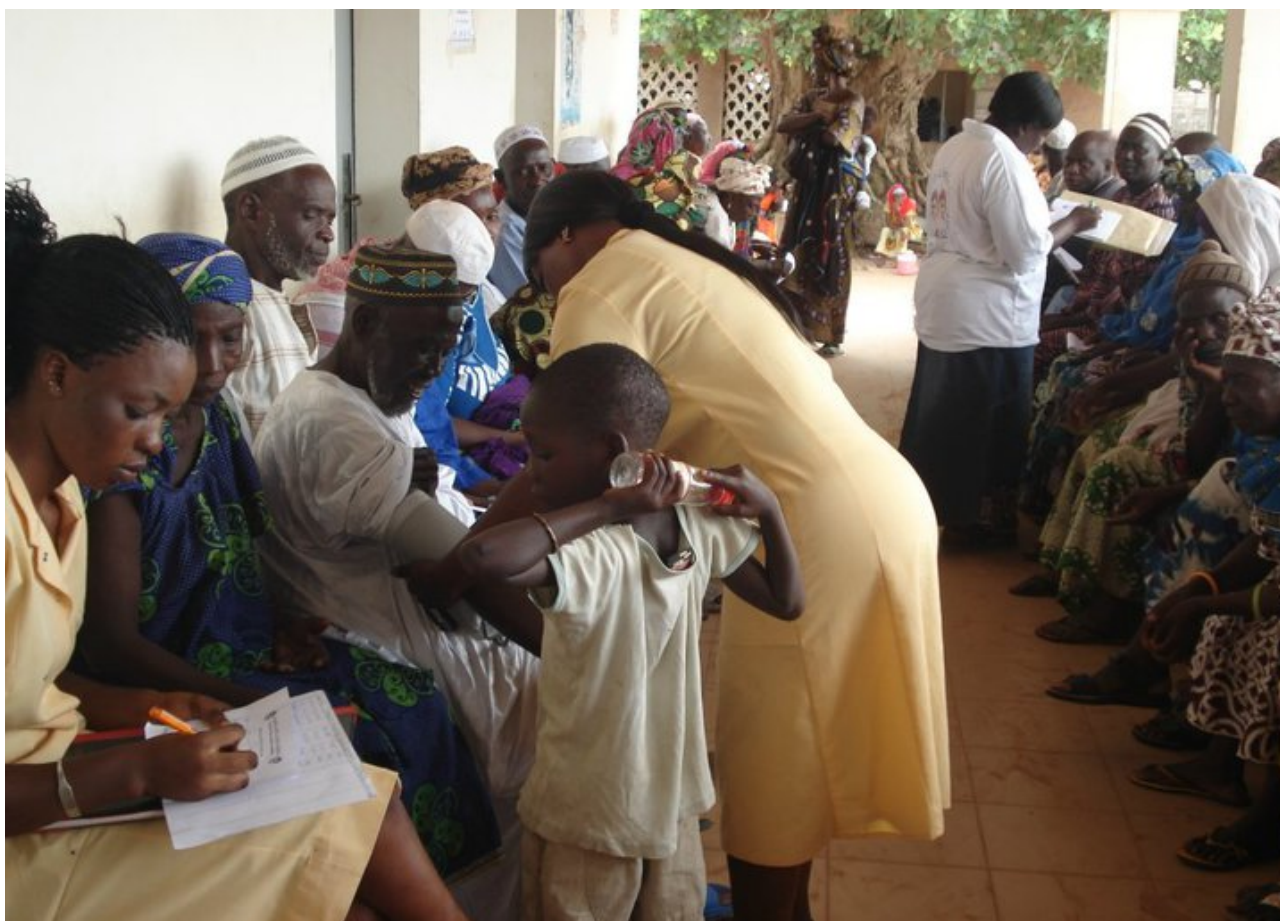
Volunteers taking the vital signs of elders at the screening session

The elders came out in large numbers. The programme started in the morning with prayers, which was followed by a brief introduction of ASI and the objective of the screening and consultation exercise. A short health education was done on lifestyle management, diet and diabetes.