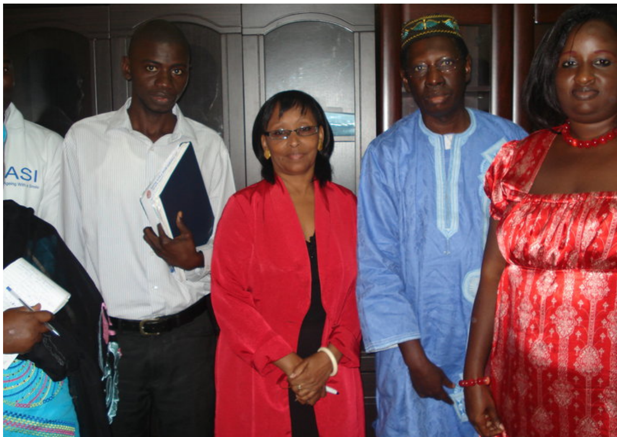
Members of ASI with the PS Health (in the middle) and her team