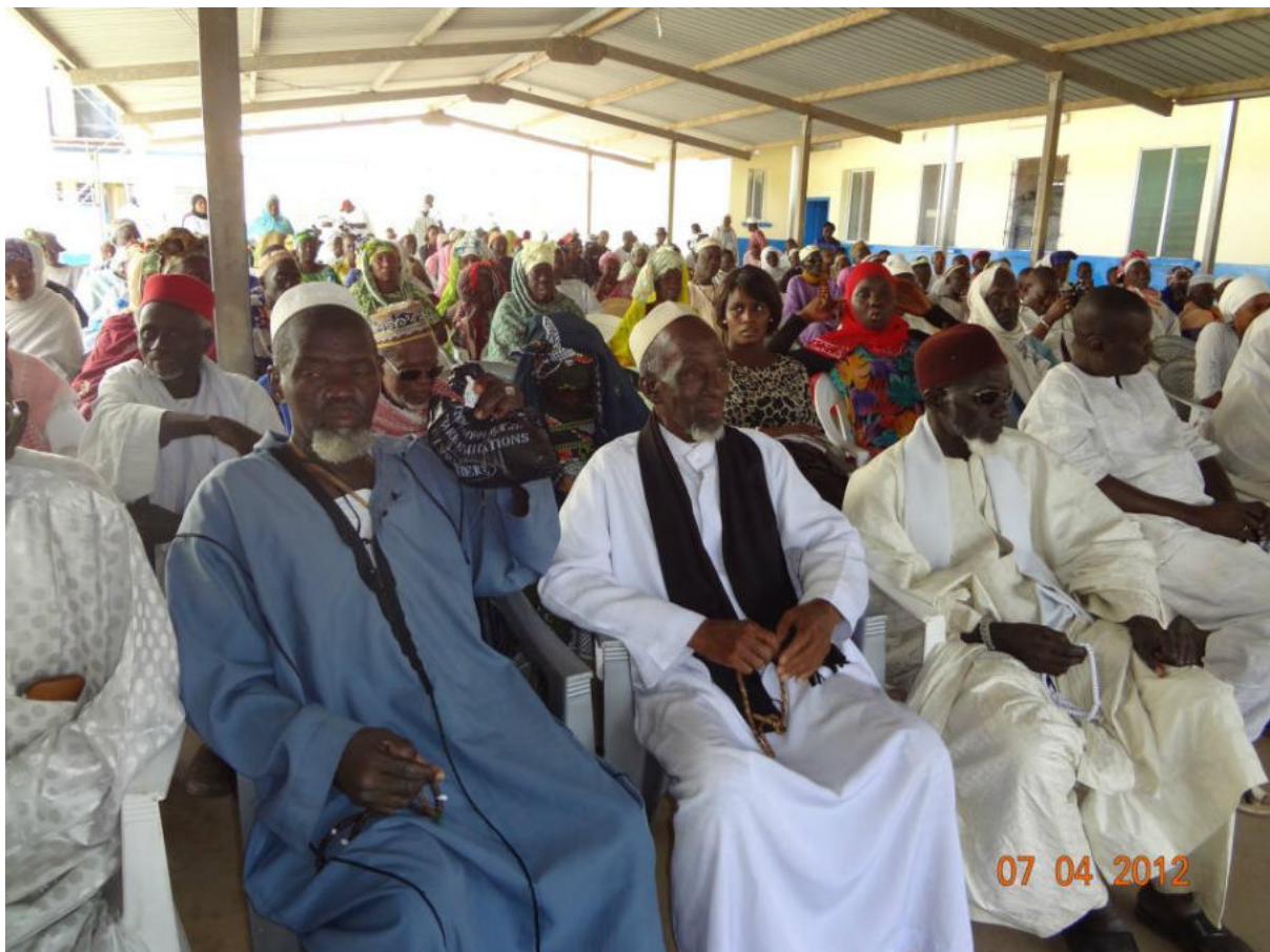
A cross section of the elders at the programme