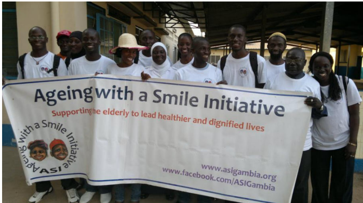
Members of ASI with some of the staff of Fajikunda Health Centre at the end of the programme