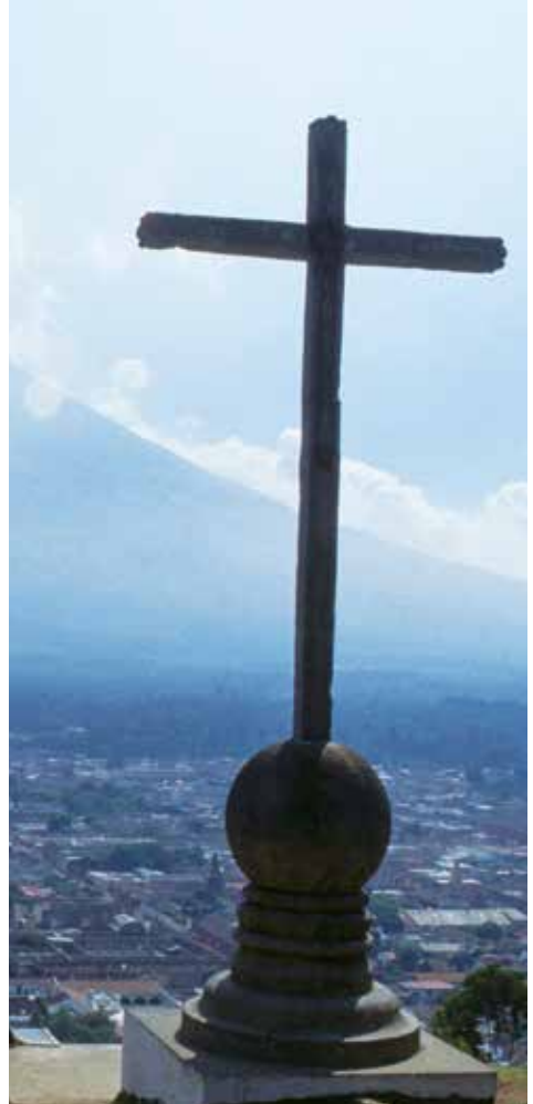
Photo: Guatemala.

Every society is maintained by its laws, cultures and values. Any time those laws, cultures and values are abused, the outlook of that society becomes skewed. The same applies to the community of biblical Israel where the concept of jubilee was revealed, if not practised. God intended that society should be one of shared prosperity, characterised by justice and righteousness. The concept of jubilee was instituted to effect God's intentions for a prosperous community. In Deuteronomy 15, where jubilee is celebrated in the release of slaves and debts, God promised the children of Israel that if they obeyed the laws of the jubilee, there would be no 'poor' among them because he would bless them abundantly.