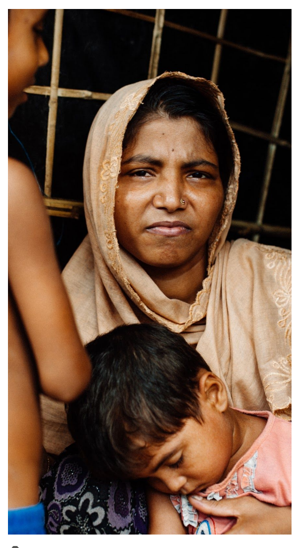
Rohingya family, Bangladesh.

Today, some church traditions and Christians find lament more natural, while others avoid it. However, the practice of lament is a deeply biblical practice. Many Psalms, in part or in full, offer a cry of lament to God.