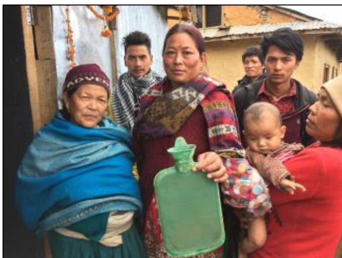
PHOTO left: Agra Ward 6 beneficiary shows the hot water bottle received as part of the Winterisation NFI distribution.