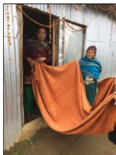
PHOTO right: Agra Ward 6 beneficiary shows the blanket she received.