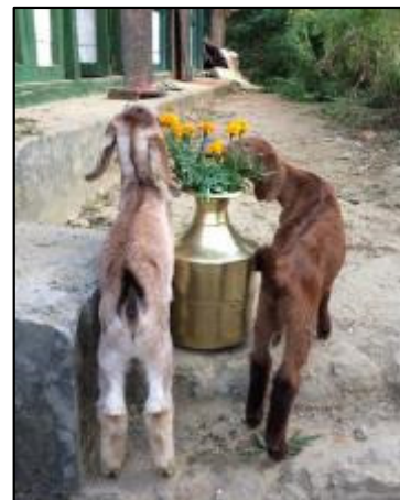
PHOTO right: 2 kid goats that were produced from the Buck distributed by MRC-N in Tistung Taruka village.