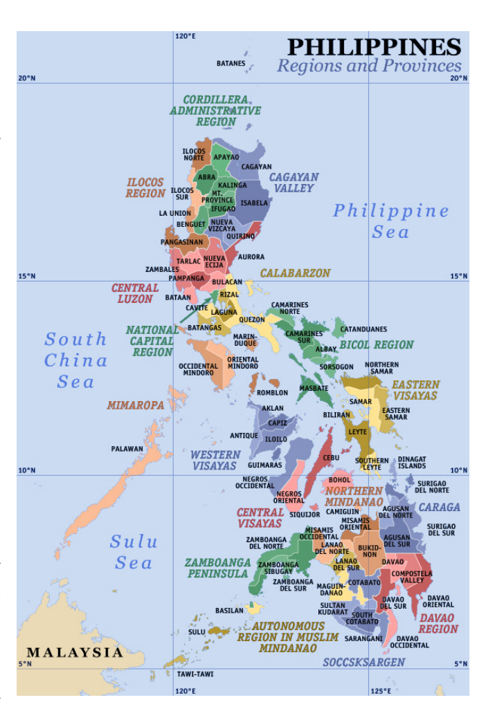
Figure 1. Political map of The Philippines

In addition to the range of disasters the country experiences, a major concern is that the frequency of these events has doubled over the past 40 years to an average today of 15 events each year (Figure 2).