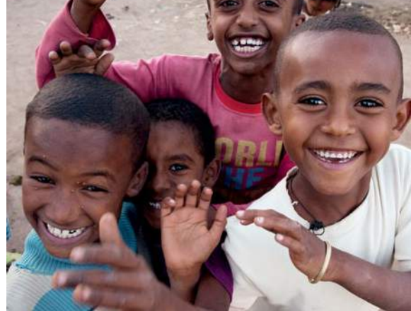
It is important to involve men and boys in preventing SGBV.

respect. Ensure people recognise that it is important to involve men and boys.