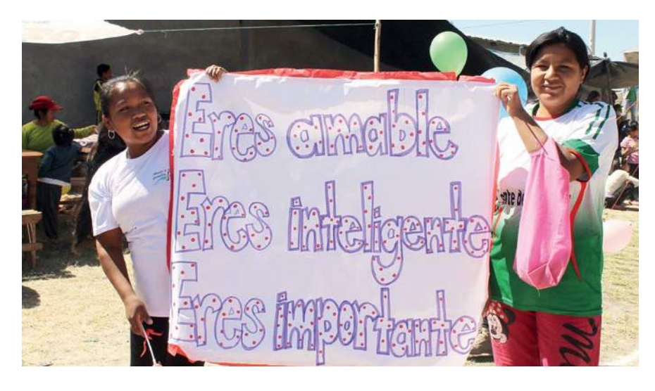
Girls taking part in an awareness-raising campaign aimed at reducing SGBV. The sign says, 'You are kind, you are intelligent, you are important.'

Several years ago, in one community, Paz y Esperanza began to work with the