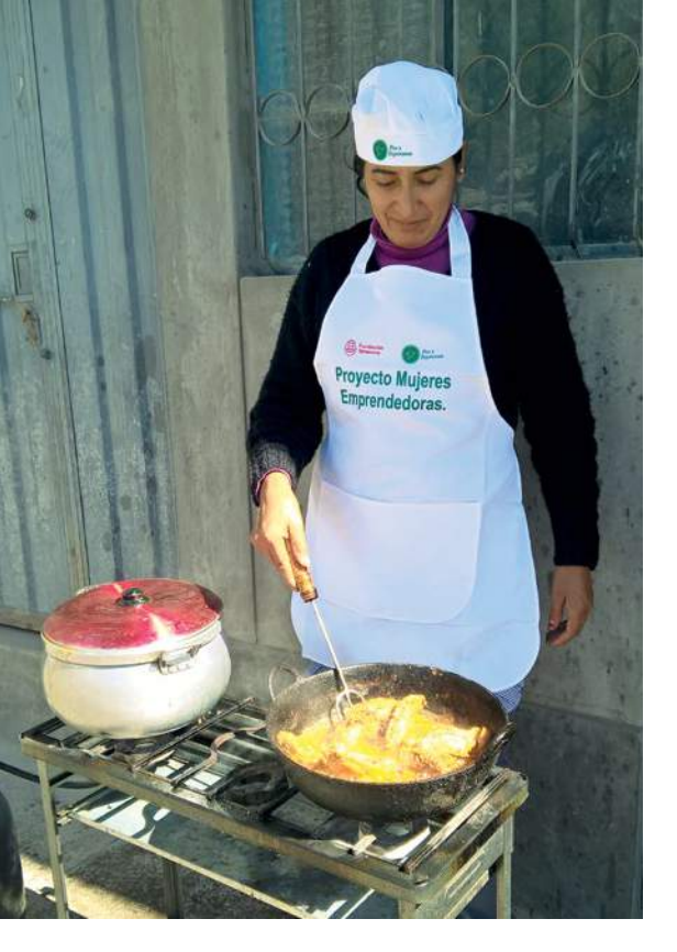
Paz y Esperanza helps female entrepreneurs develop and market their products.

women to help them express their needs. The local women agreed that their top priorities were personal safety, work opportunities for women and ending violence against women.