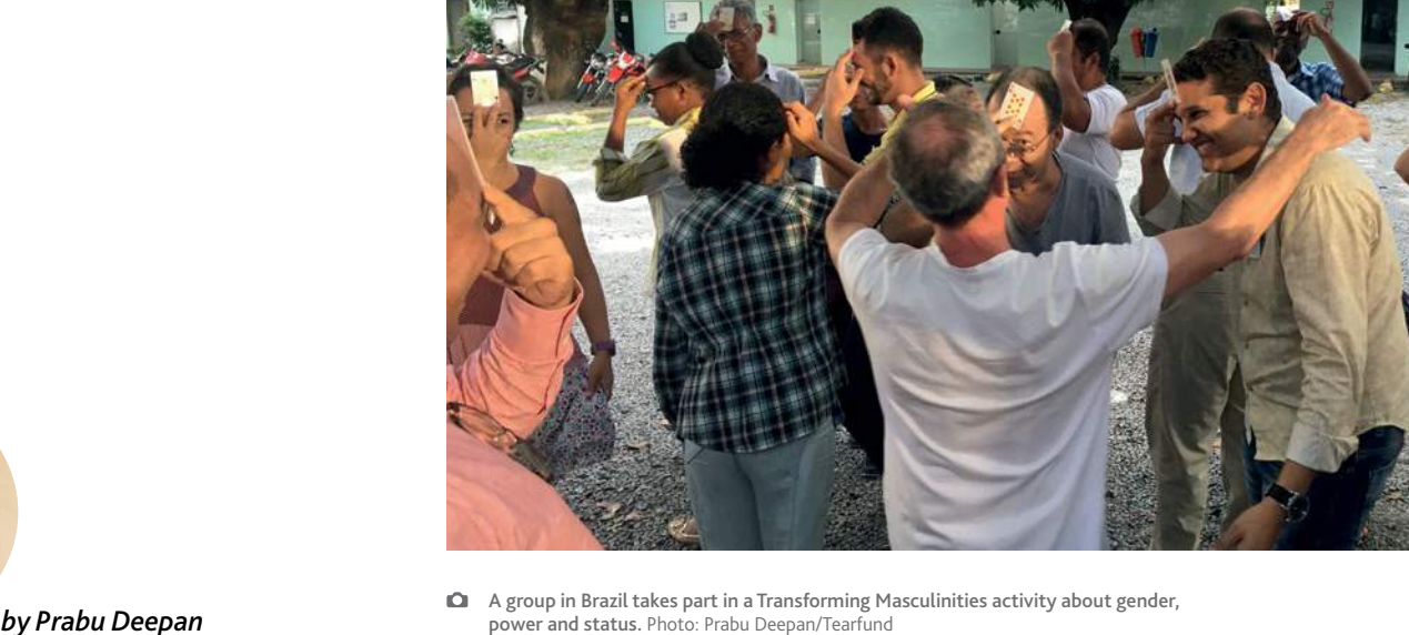
A group in Brazil takes part in a Transforming Masculinities activity about gender, power and status.