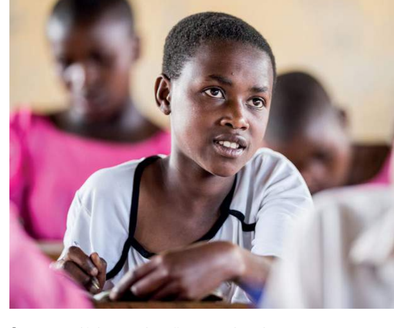
Promoting girls' education can be an effective approach to ending FGM/C.

A wide range of strategies have been used by different organisations to encourage people to abandon female genital mutilation/cutting (FGM/C). Often, a combination of strategies is used. But how effective are they? We explore a number of approaches below.