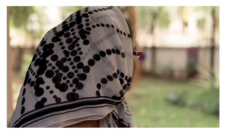
Survivors of SGBV often keep silent about their pain.

Survivors of sexual and gender-based violence (SGBV) often keep silent about their ordeal, which adds to their sense of isolation. Reasons for not speaking out may include threats from the perpetrators, fear of stigma and discrimination, and a lack of hope that anyone could help them.