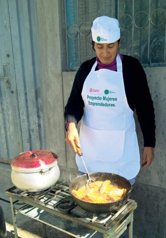
📷 Paz y Esperanza helps female entrepreneurs develop and market their products.

women to help them express their needs. The local women agreed that their top priorities were personal safety, work opportunities for women and ending violence against women.