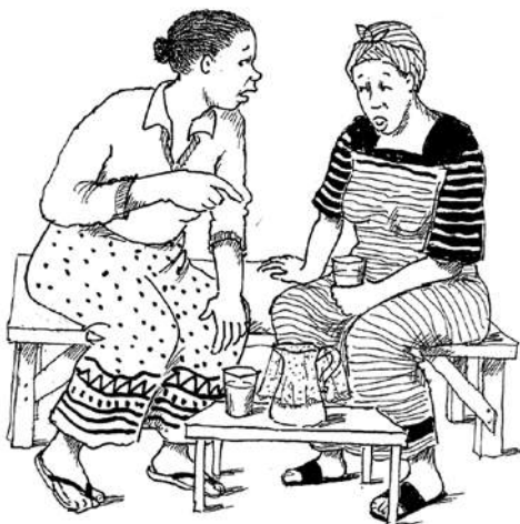
Wrong words can be like knives in the heart for survivors of SGBV.