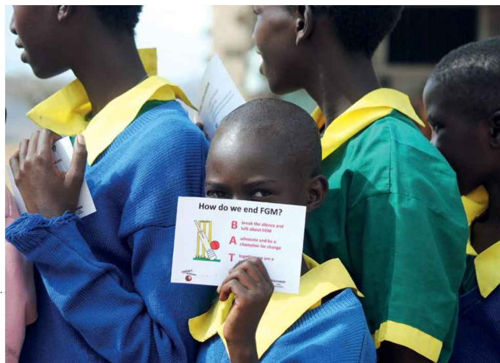
📷 A cricket team in Kenya is using sport to raise awareness about FGM/C.

Web: www.28toomany.org Email: admin@28toomany.org