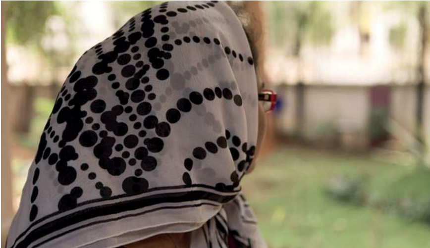
Survivors of SGBV often keep silent about their pain.

Survivors of sexual and gender-based violence (SGBV) often keep silent about their ordeal, which adds to their sense of isolation. Reasons for not speaking out may include threats from the perpetrators, fear of stigma and discrimination, and a lack of hope that anyone could help them.