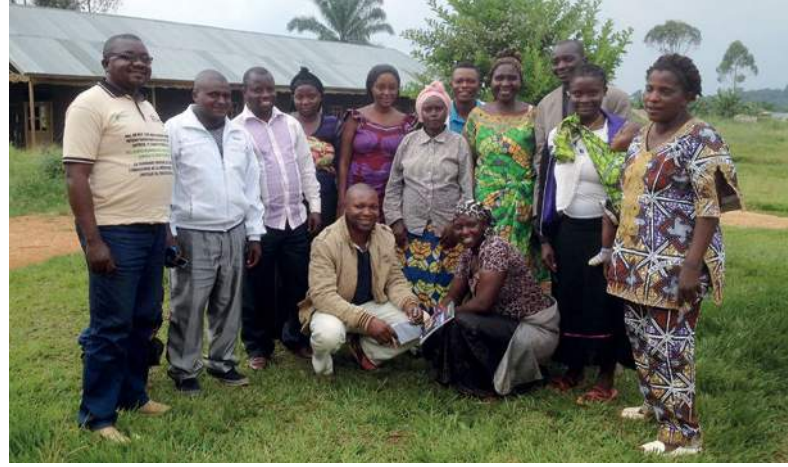
Members of Community Action Groups come together to support survivors of SGBV.

In remote regions such as eastern Democratic Republic of Congo (DRC), survivors of sexual and gender-based violence (SGBV) often struggle to access support. They may be unaware of the services available, and facilities such as health centres may be far away. Tearfund and its partners have started Community Action Groups to help solve this problem.