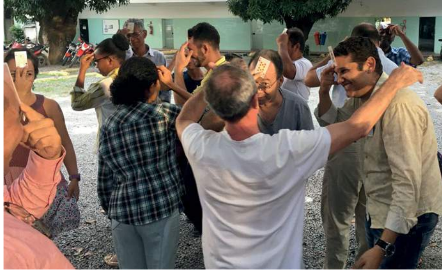
A group in Brazil takes part in a Transforming Masculinities activity about gender, power and status.