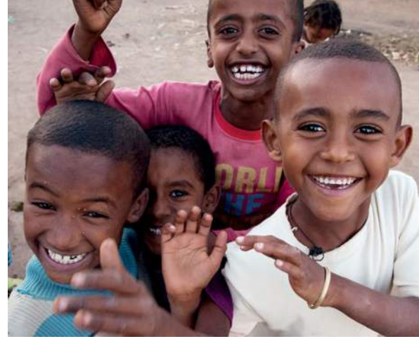
It is important to involve men and boys in preventing SGBV.

respect. Ensure people recognise that it is important to involve men and boys.