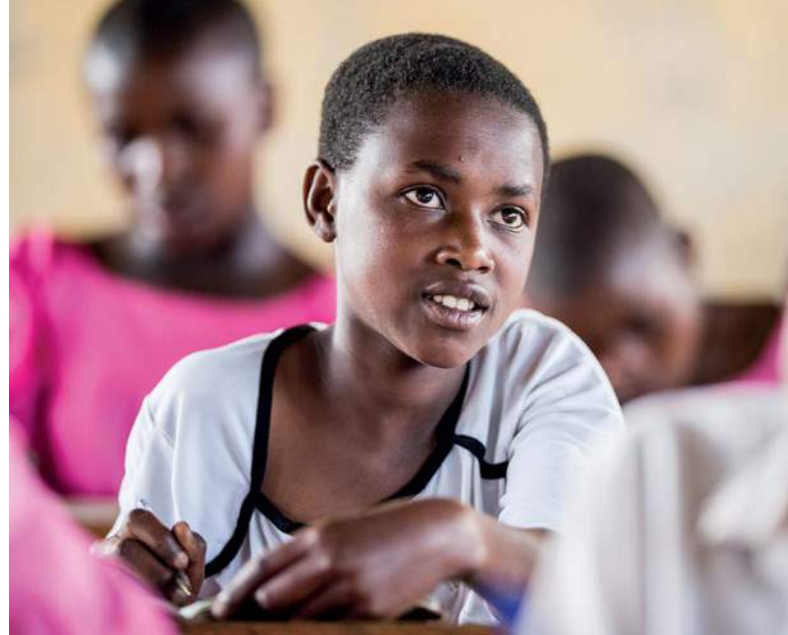
📷 Promoting girls' education can be an effective approach to ending FGM/C.

A wide range of strategies have been used by different organisations to encourage people to abandon female genital mutilation/cutting (FGM/C). Often, a combination of strategies is used. But how effective are they? We explore a number of approaches below.