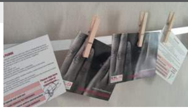
📷 We Will Speak Out pledge cards.

We Will Speak Out is a global coalition of Christian-based organisations working to end sexual and gender-based violence (SGBV). It has produced this pledge for those who want to commit to ending SGBV. You can use this as an individual or with your church or organisation.