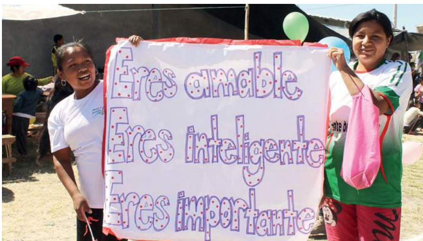
📷 Girls taking part in an awareness-raising campaign aimed at reducing SGBV. The sign says, 'You are kind, you are intelligent, you are important.'

Several years ago, in one community, Paz y Esperanza began to work with the