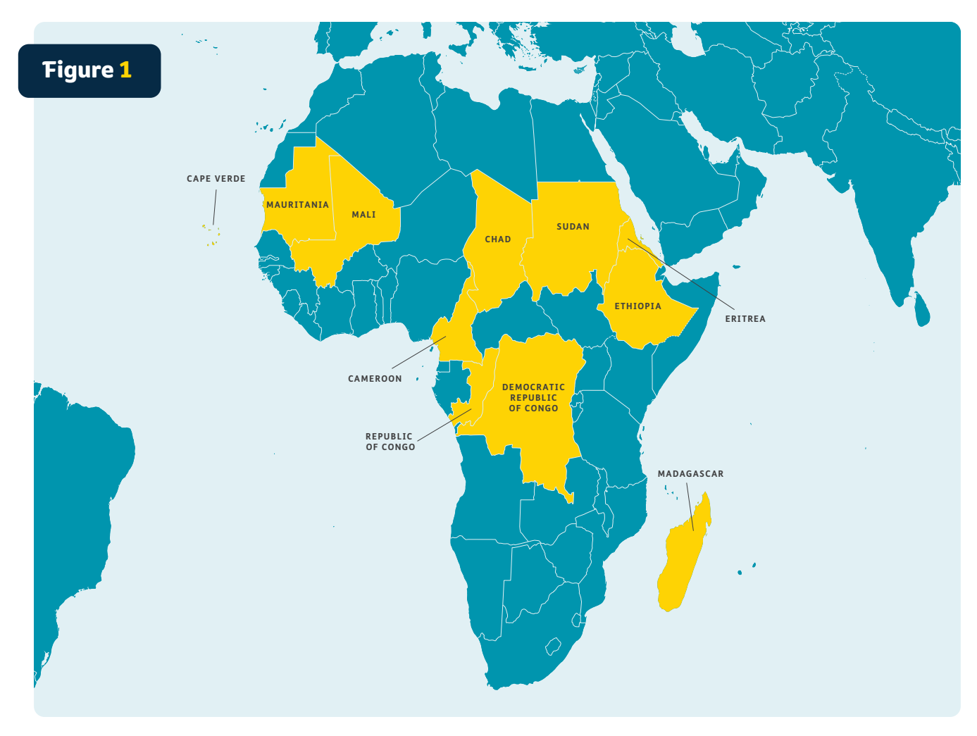
Figure 1 (map): Eleven countries in sub-Saharan Africa, with a collective population of more than 350 million people, face climate adaptation costs that are larger than their national spend on healthcare.