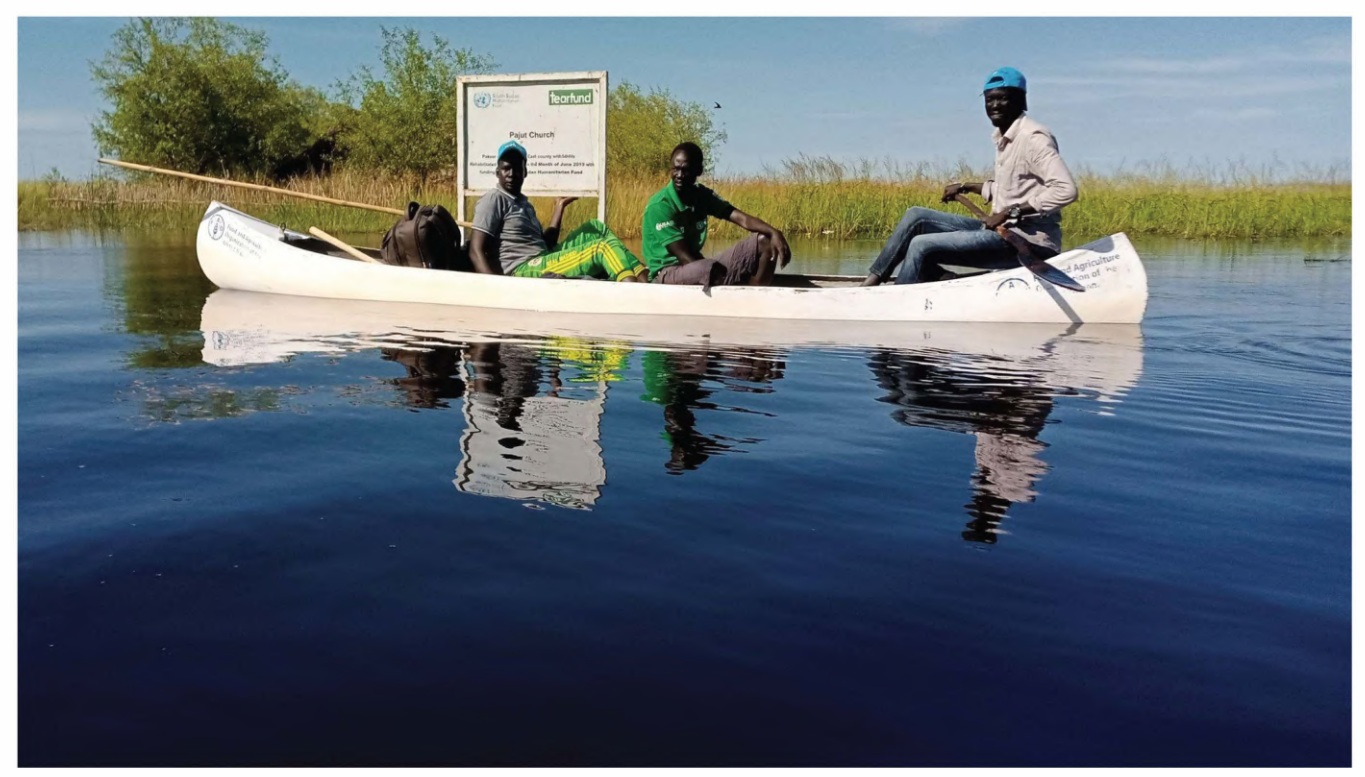
Canoes remain essential for getting around. Tearfund is using them to support remote communities that have been cut off by the flood waters.

Climate change has had a catastrophic impact on the communities in South Sudan and they face multiple climate shocks which amplify other challenges and crises.