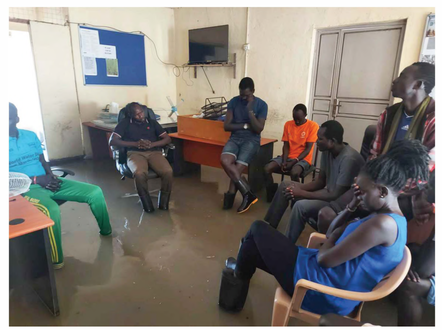
Floods in Tearfund office, Twic East, in 2020. Twic East is in Jonglei state, one of the states worst affected by floods. Since 2019, South Sudan has experienced flooding to an unprecedented level. The waters in several parts of the country are yet to recede.