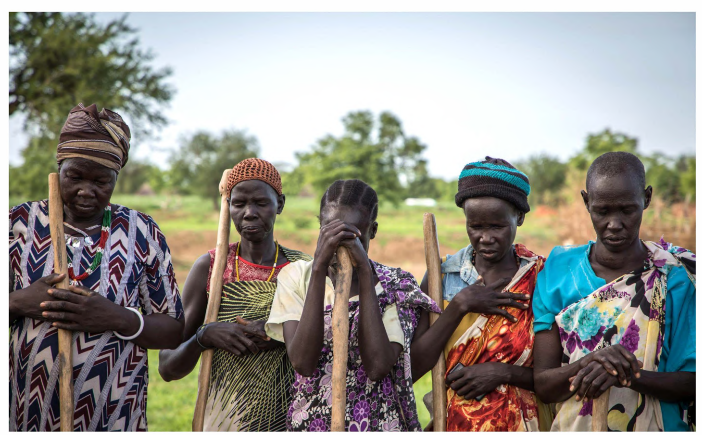
G Farmers pause to pray in Aweil, South Sudan.

Local churches and ecumenical parachurch networks in South Sudan play a significant role in peacebuilding and humanitarian work in the country. It is estimated that Christians make up 60.5 per cent of the population, followers of indigenous (animist) religions 32.9 per cent, and Muslims 6.2 per cent.<sup>44</sup> In Tearfund's experience of working in South Sudan, we have seen that people's trust in formal structures such as law enforcement groups and the judicial system is low and they place a higher trust in churches and faith leaders.