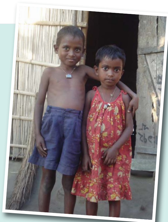
Case study: Save the Children (UK), "How the Global Food Crisis is Hurting Children: The impact of the food price hike on a rural community in northern Bangladesh", April 2009

“Children from the poorest households received fewer meals per day, had less diverse diets and were less likely to be given highly nutritious food.”