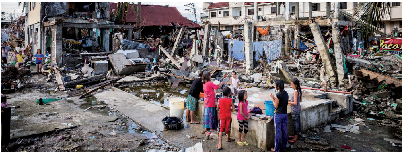
The town of Basey in Samar, the Philippines, was destroyed by Typhoon Haiyan in 2013.

“Another, narrower path leads to a place where poverty is eliminated, where catastrophic climate change is averted, and where all human beings have the chance to flourish”