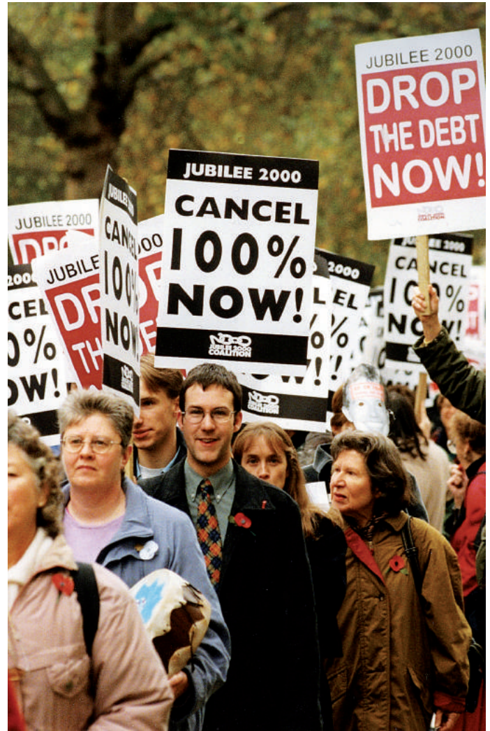
Debt campaigners take to the streets of London with Jubilee 2000 .

When humans act with wisdom, on the basis of steadfast love and justice, they act in ways that accord with the unity and wholeness of creation (shalom). But the bonds of this crucial web of relationships can unravel as a result of what the Bible calls 'iniquity' – for example, through idolatry (worshipping things rather than God), injustice or ignorance. When that happens, the result is catastrophic damage: as Isaiah puts it, 'The earth dries up and withers' (Isaiah 24:4).