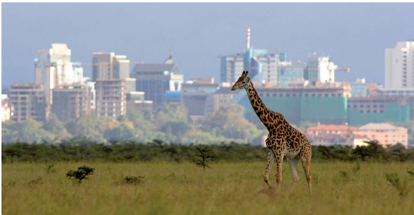
Nairobi's ever-changing skyline reflects economic growth, creating jobs and helping people to escape poverty.

'It was the best of times, it was the worst of times, it was the age of wisdom, it was the age of foolishness, it was the epoch of belief, it was the epoch of incredulity, it was the season of Light, it was the season of Darkness, it was the spring of hope, it was the winter of despair, we had everything before us, we had nothing before us, we were all going direct to Heaven, we were all going direct the other way...' Charles Dickens, A tale of two cities