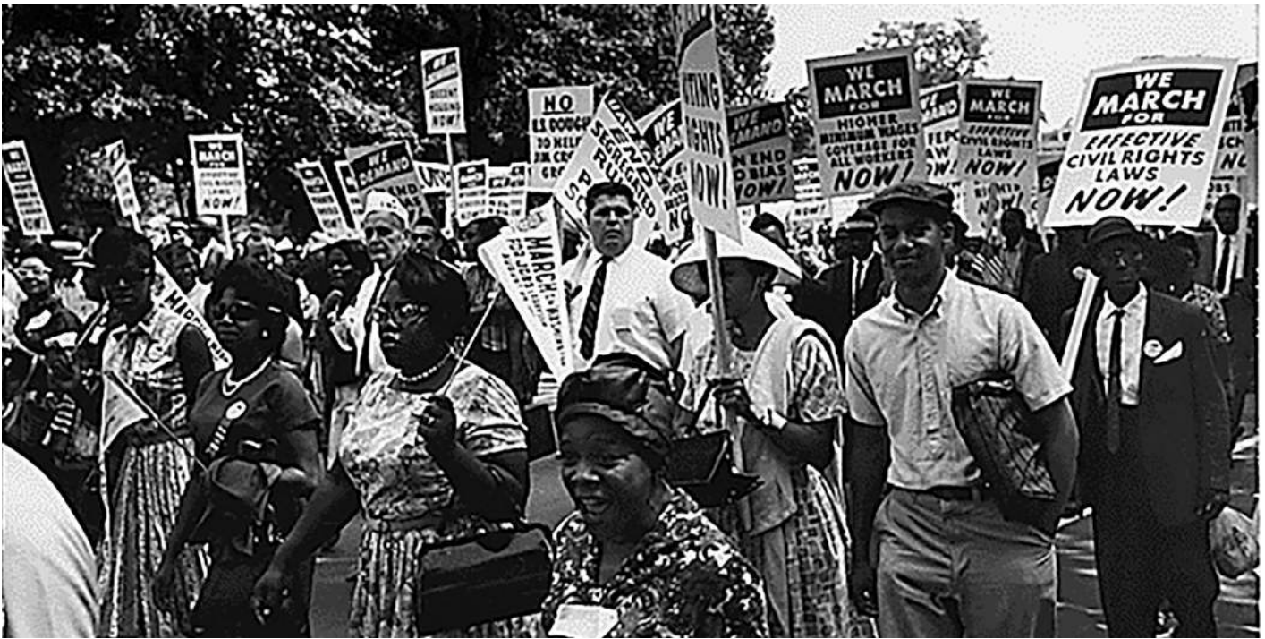
The civil rights movement in the US helped transform public attitudes on racial discrimination.

As Tolstoy says in War and peace , 'It's hard to thank any single individual for altering history; more often, the ship of state alters course only because tides are vastly shifting underneath.' As we look to the future, we believe one of the most important roles that we and other Christian development NGOs can play is to help shift those tides. The changes that need to happen now are at the level not just of policy change but of the wholesale transformation of lifestyles, institutions and systems. We think churches are central to this endeavour, given their scale and reach. 50 And as we set out in this chapter, we think this involves a far-reaching change in values, building a grassroots social movement on a much bigger scale than anything we've seen in recent years, and being ready for the moments of opportunity that come after shocks.