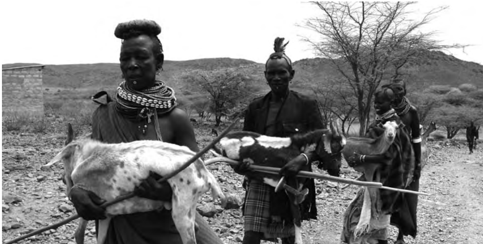
People bringing their weakened animals to an Oxfam destocking programme.