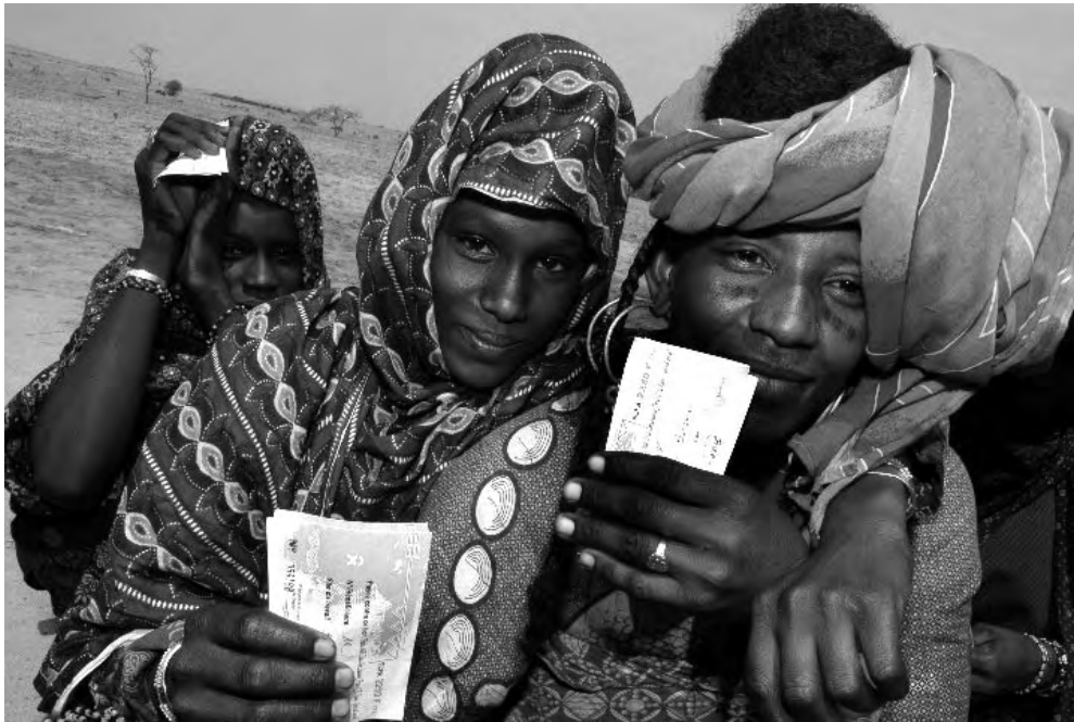
Vouchers for food in Niger, a new approach to relief.