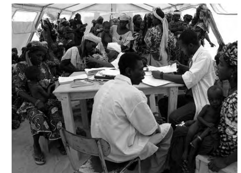
Emergency feeding, Niger, 2005.

Another factor is the developed world's failure to deliver aid predictably and in accordance with its commitments. Sahelian countries receive far less aid than other African countries affected by food crises. Annual aid to Niger, one of the world's poorest countries, actually fell from $60 per person in 1984, to $44.2 per person in 1992, $28.7 in 1998 and finally to a mere $12 per person in 2004. The UN has recommended that countries get $45 per head in order to have a chance of reaching the UN Millennium Goals by 2015. 15