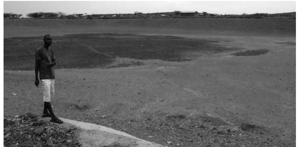
Dry waterhole, Turkana.