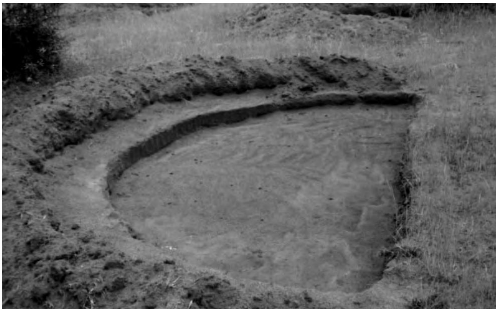
Half-moons, Niger.

Aid agencies, like Oxfam, working in Niger, have pioneered new responses to drought – such as calls for less foreign food aid and more direct transfers of cash vouchers into people's hands to enable them to buy the local food that is available on the markets. To help in the long term agencies are working with local non-governmental organisations like JEMED, a partner of Tearfund, to trap rainfall and boost agriculture. Simple structures that capture rainwater – stone lines or earthen half-moon crescents, mini-dams and dykes – can give communities an extra three months worth of water per year.