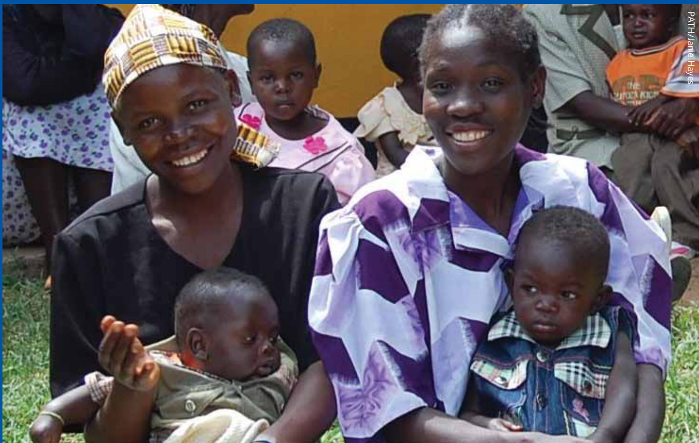
Mothers wait to have their children seen at Webuye Health Clinic in Kenya's Western Province.

Keeping the promise: united to achieve the Millennium Development Goals, UNGA resolution, 17 September 2010 1