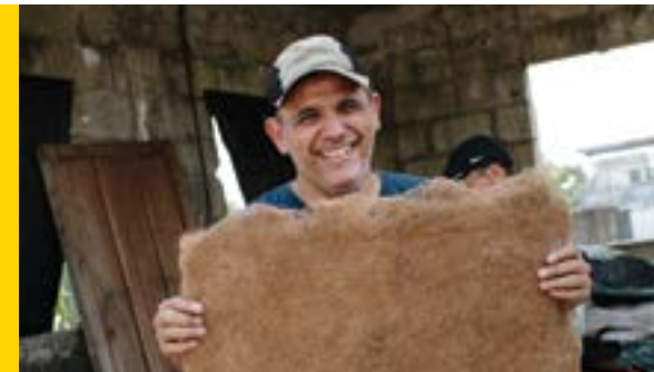
(Guatemala)