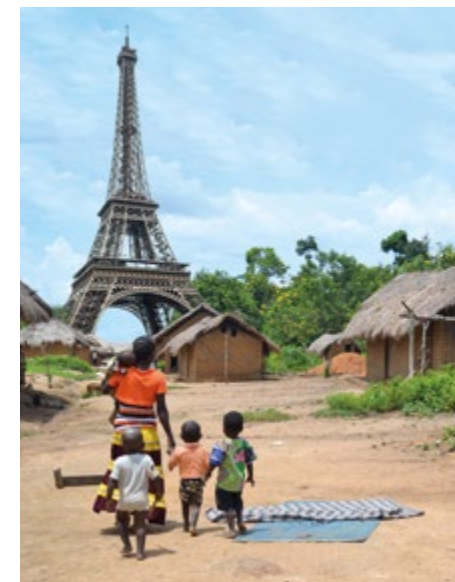
📷 Tearfund made the voice of the poorest heard at the UN climate talks in Paris, to reduce the damaging effects of climate change on the most vulnerable.

The Pilgrimage to Paris was successful in raising the profile of climate change in the church: churches along the route hosted the pilgrims; participants gave talks after their return home and wrote blogs and social media posts about the pilgrimage; national media covered the event; and senior leaders were involved, including 16 bishops. They also had meetings with Christiana Figueres, Executive Secretary of the UNFCCC climate body, and with President Hollande of France.