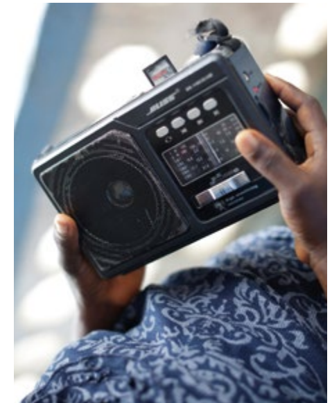
☑ Tearfund partner NEHADO in Sierra Leone used radio messaging on how to prevent the spread of Ebola.

'When you lose the person that you depend on, you lose hope. This wasn't only true for the households but for the church too. The church was overwhelmed as it became a solace for many who sought assistance.'