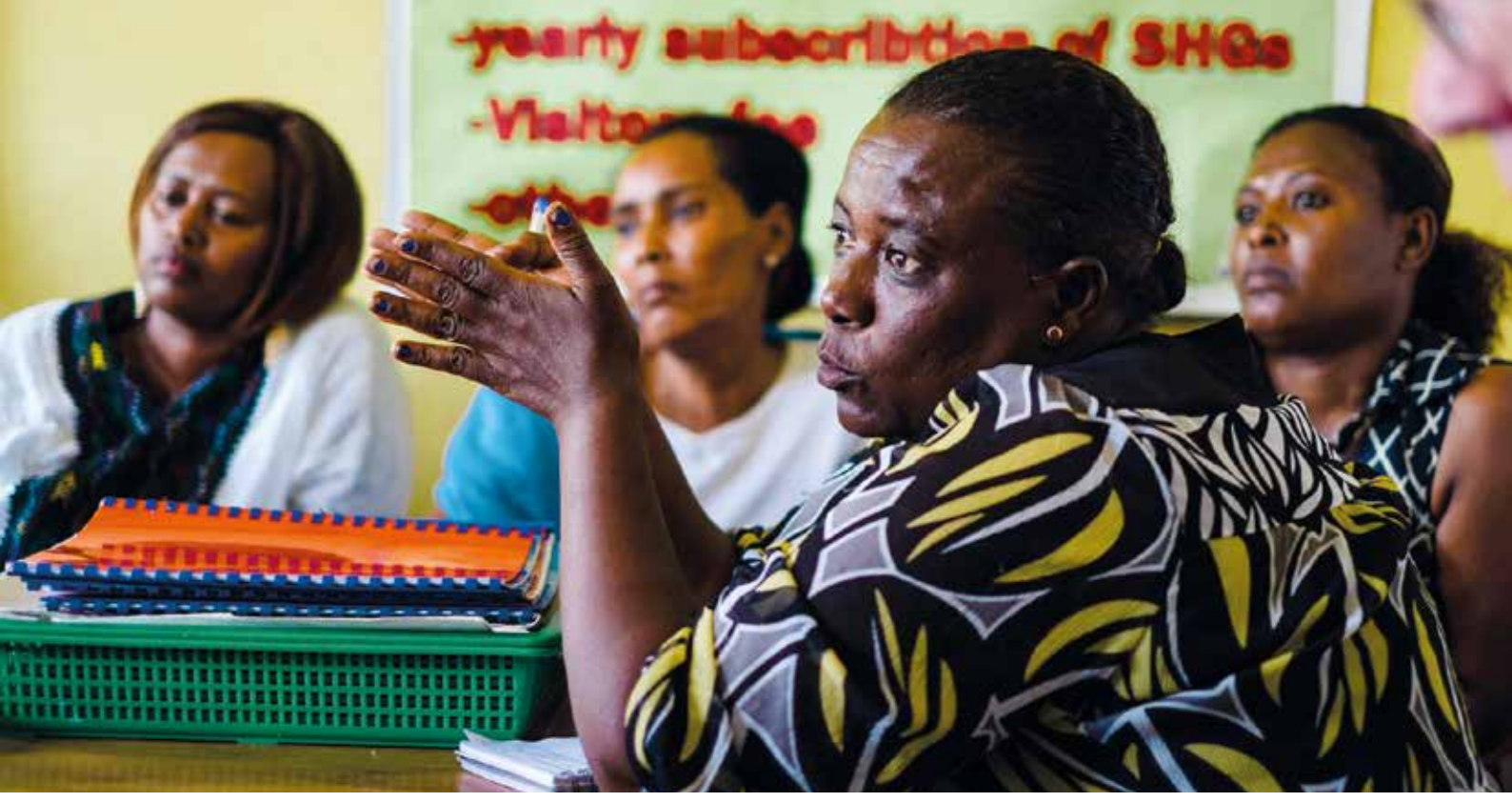
Federation-level association meeting, Ethiopia.