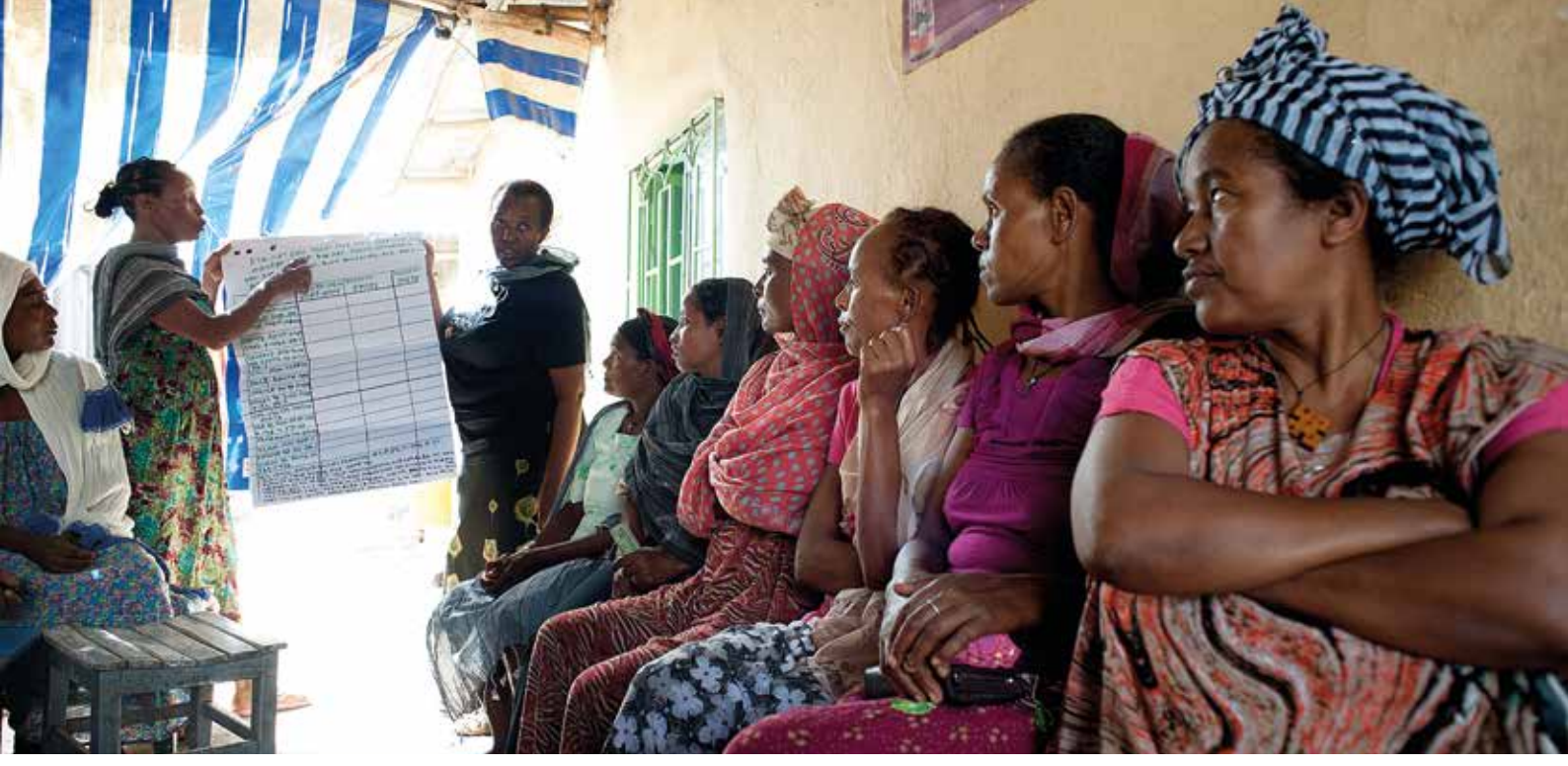
Members of the Sira Betegbar Cluster Level Association in Nazareth, Ethiopia, listen to a presentation during a meeting

SHG members' capacity to cope with protracted covariate shocks was more limited. Members described 'struggling together' during the drought. However, members were in a stronger position than non-members.