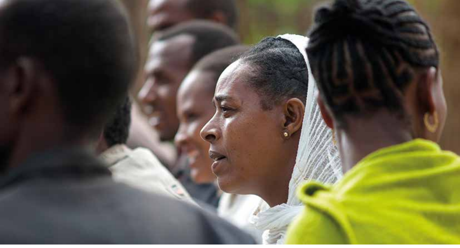
A meeting of members of Lemlem self-help group in Kerikicho area, Angacha, Ethiopia

Training had enabled members to take control of their finances and enhance them, as well as improve their health and hygiene.