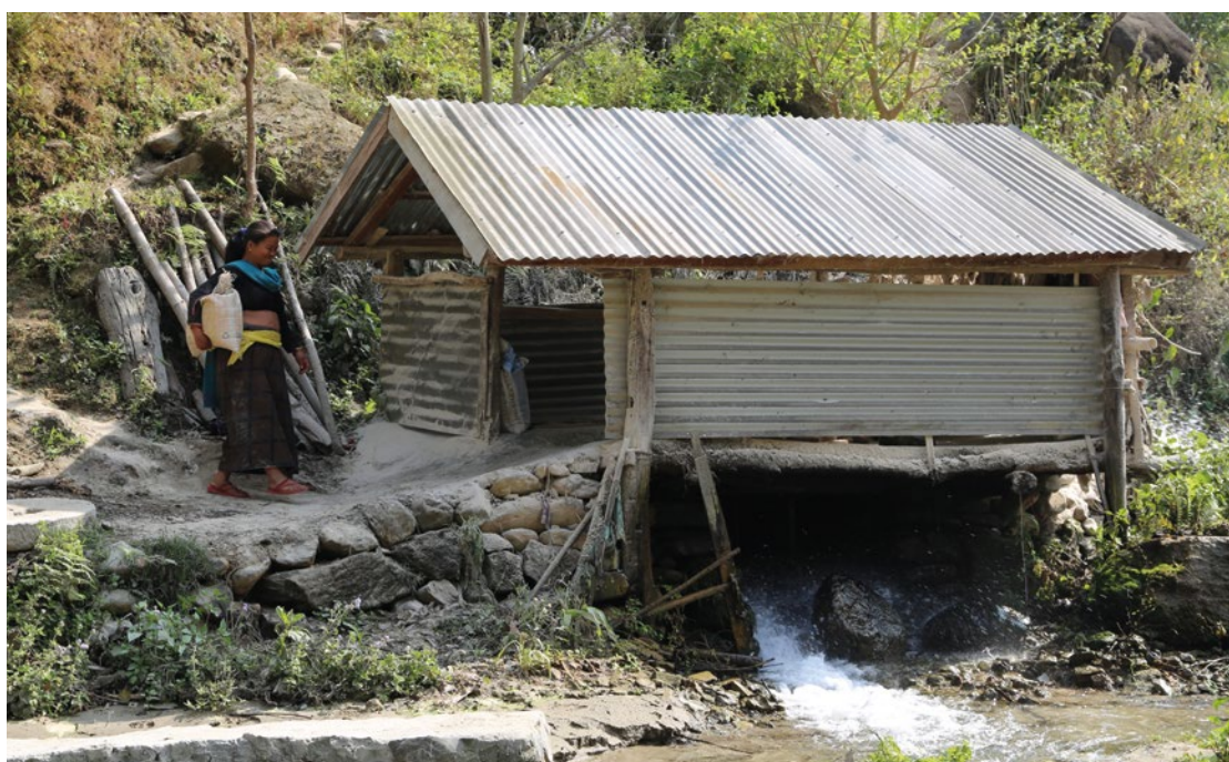
Phul Kumari brings her family's grain to grind it quickly in a watermill, powered by hydroelectricity, in Mahadevsthan, Dhading District in Nepal. See case study on page 21.

Over one billion people who are without electricity face challenges as they seek to find their own way out of poverty. 11 Living in remote rural areas of Africa and Asia, 12 they do not have access to the central grid. When the grid is extended, average connection costs increase as people closer to the grid are connected, and timelines are prolonged. These infrastructural and financial barriers mean that millions of people lack electricity in their homes, businesses, schools and health clinics. Under a business-as-usual scenario, nearly 700 million people will still be without access to electricity in 2030, the majority in sub-Saharan Africa. 13 Relying solely on grid-connected solutions means SDG 7 will not be met under current rates of progress. Countries are, however, increasingly recognising the important role of decentralised electricity services, such as solar and micro-hydro off-grid and mini-grid systems, for low-tier energy access solutions. By 2040, the African Development Bank estimates almost three-quarters (70 per cent) of new rural electricity supply in sub-Saharan Africa will be from stand-alone and mini-grid systems. 14