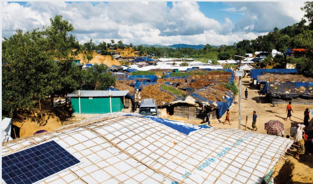
Solar panels on a roof in Kutapalong camp in Bangladesh.

Some of the 600,000 Rohingya refugees that migrated from Myanmar to Bangladesh in the face of conflict travelled with solar panels among the few things they took with them. A number of Rohingya refugees purchased solar panels upon arriving in Bangladesh, demonstrating the importance they place on access to electricity. 76