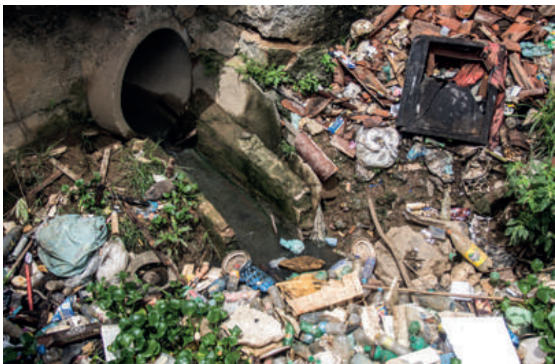
📷 A drainage channel blocked with plastic waste, Brazil.