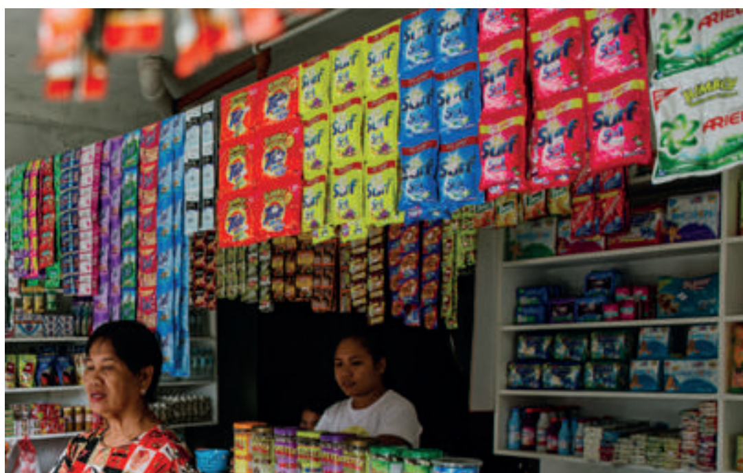
📷 Non-recyclable plastic sachets are sold in huge quantities across many low- and middle-income countries.

But while sachets may bring convenience, and – in some places – a level of affordability, they are a significant contributor to the waste crisis in many poor contexts. In Tearfund and WasteAid's survey on the impacts of plastic pollution on poverty, 137 plastic sachets were the most commonly identified item among mismanaged solid waste. The scale of the problem is also apparent from waste audits. For example, in a waste and brand audit carried out in the Philippines, a total of 54,260 pieces of plastic waste were collected, with most products being sachets. 138 The prolific use of sachets in many parts of Asia and Africa has been justified around arguments of accessibility: many families are unable to afford standard sizes of new (often internationally owned) branded products, so single-serve sachets are more accessible ways for them to access these products. In some cases the cost per sachet is cheaper than larger packets, so it also drives richer people to buy them in bulk, for example in India. However, in other countries, such as Indonesia, the long-term cost of multiple sachets is considerably more than buying the full-sized item. 139