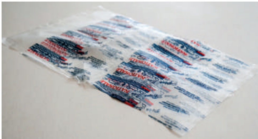
Water sachets such as these are ubiquitous in many low-and middle-income countries.

An immediate solution to this problem is for the LDPE sachets to be collected and recycled. However, the obvious longer term – more economically and environmentally sustainable – solution is for governments and donors to also increase investment in water, sanitation and hygiene (WASH), which will mean people can access safe water without having to buy it in plastic sachets.