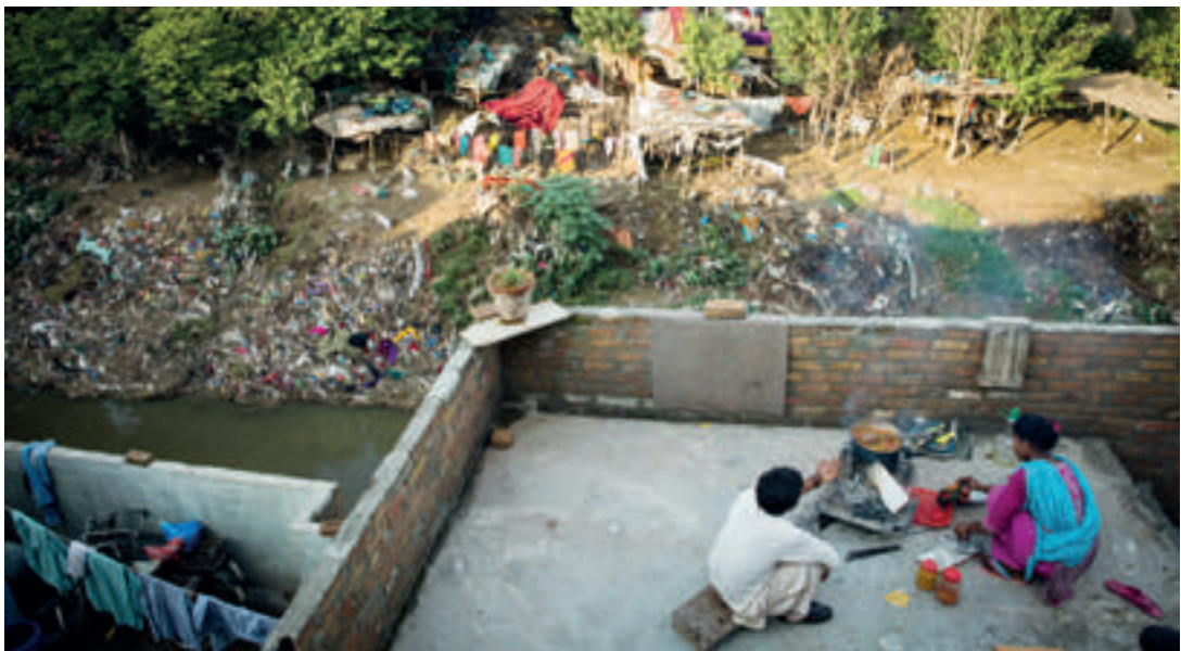
Many communities in low- and middle-income countries have no safe way to manage their waste.

In this chapter, we explore the health impacts of the plastic and waste crisis in more detail. We highlight five core ways the health and lives of billions of poor and vulnerable people – particularly children – are put at risk by mismanaged household waste. We also highlight a sixth potential health hazard, which is potentially huge, but as yet little understood: the introduction of microplastics into the food chain.