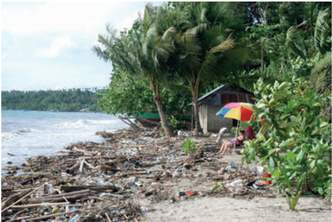
📷 A beach covered in plastic waste, Bunaken Island in North Sulawesi, Indonesia.

This field of research is still in its infancy, but it is already clear that plastic pollution in the ocean and on land has a direct impact on the livelihoods of people who are poor. In this chapter we explore the impacts of plastic pollution on livelihoods in three key sectors for many low- and middle-income countries: agriculture, fisheries and tourism.