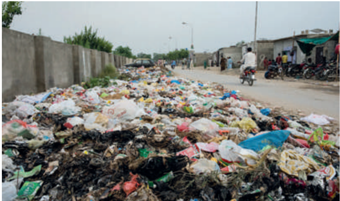
❏ Islamabad, Pakistan. The take-make-dispose model of economic development has been exported across the globe by high-income countries.

Current economic models, with large subsidies given to the oil and gas sectors (virgin plastic is made from crude oil and natural gas), depress the price of plastic – driving supply. The G7 alone shell out 100 billion USD per year in subsidies to the production and use of coal, oil and gas. 170