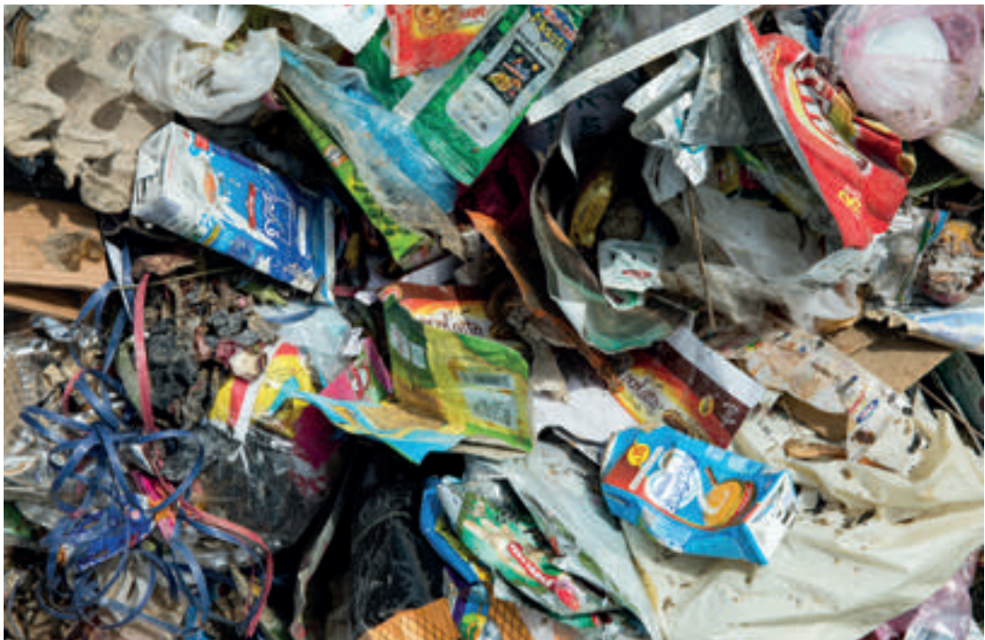
📷 Lays chips top right, owned by PepsiCo and Everyday milk at the bottom, owned by Nestlé, in packaging collected by the Community Recycling Centre in Islamabad, Pakistan.

There are many problematic single-use plastics being distributed by MNCs in low- and middle-income countries where there are inadequate or non-existent waste management systems. Here we highlight two examples: sachets and PET bottles.