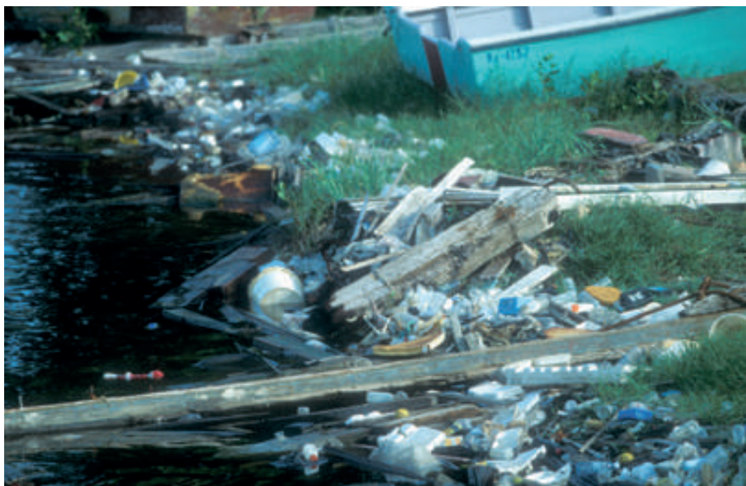
📷 Plastic pollution in Guatemala.

Plastic pollution is also wreaking havoc on land as plastic litters fields, waterways, hedgerows and trees across the globe. Some plastics are extremely persistent in the environment with studies suggesting that certain plastics can take thousands of years to decompose in the environment. 39 This contaminates soil and water and poses significant ingestion, choking and entanglement hazards to wildlife on land, and in freshwater systems as well as in the ocean. There is evidence suggesting that the impacts of microplastics on freshwater animals can be as diverse and harmful as those for marine species. 40 According to recent studies, microplastics in terrestrial environments could affect animals that play a major role in key ecosystem processes, such as soil organisms or plant pollinators. 41 The transfer of plastic debris along food chains has also been demonstrated for terrestrial systems, 42 which could have implications for human health (see chapter 2).