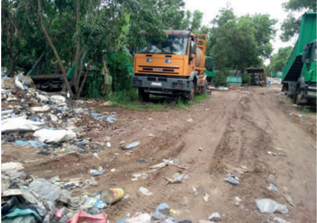
📷 Maintenance has ceased at this sanitary landfill site. There are no other sanitary landfill sites in DRC.

Kinshasa, a city of some 12 million people, is the capital of DRC, one of the poorest countries in the world with a per capita GDP in 2014 of just 479 USD.