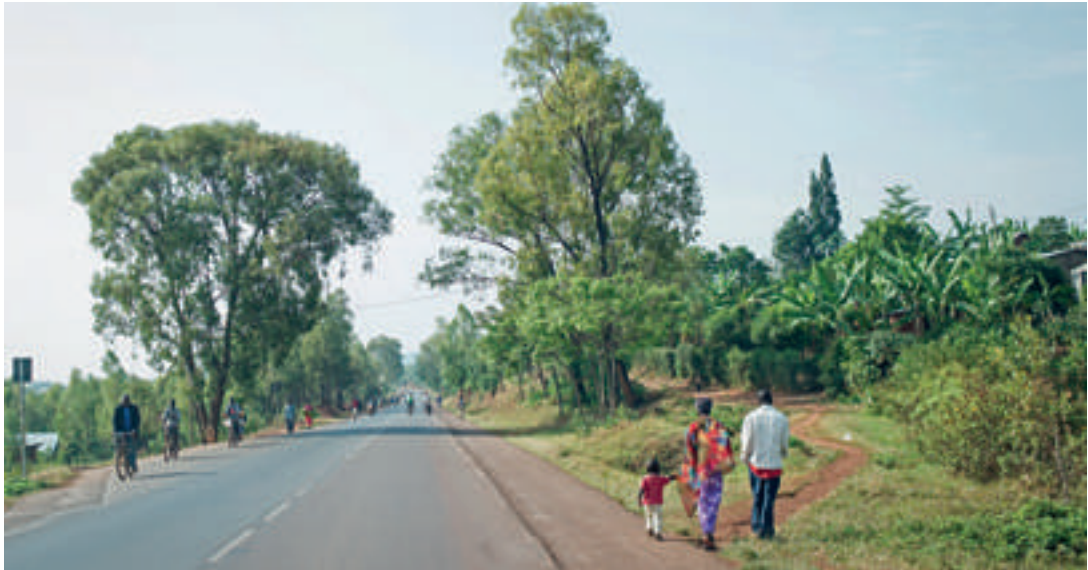
📷 The route from Kigali to Eastern Province, Rwanda. Kigali is now considered by many to be the cleanest city in Africa.

Rwanda outlawed the use of non-biodegradable plastic bags in 2008. At the time, many people asked: 'Is this really necessary? Surely Rwanda has bigger and more important things to worry about?' A few years before that, though, farmers were losing their livestock to plastic bags at an alarming rate. Rivers, streams and drains were blocked by plastic bags. Even farmers' fields were choked by these bags.