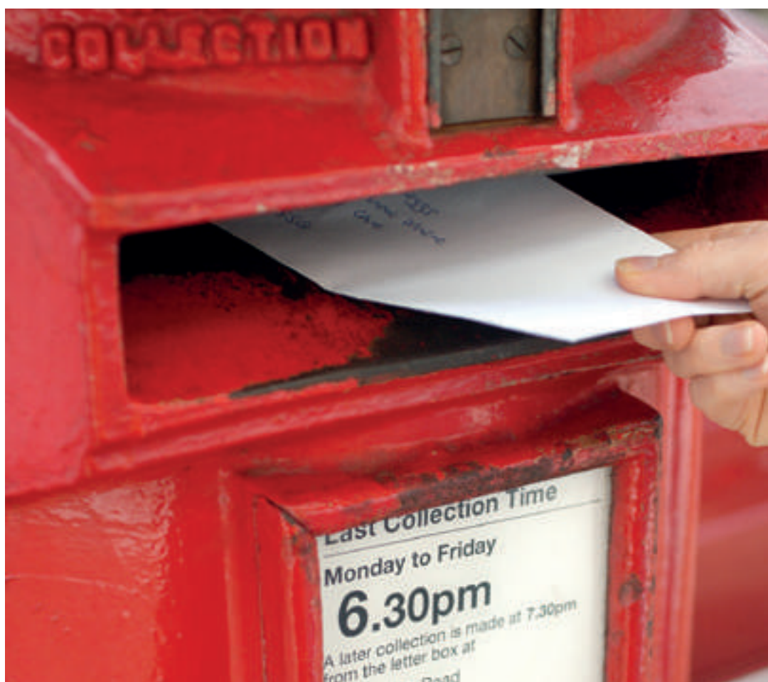
By taking campaign actions, such as writing to companies and MPs, calling for change, citizens can make a difference.

While the lion's share of responsibility lies firmly at the feet of the MNCs and high-income governments, each person and community has a role to play in tackling the plastic pollution crisis. Indeed, as Tearfund has observed: 'When extraordinary things are achieved against apparently impossible odds, it's often because of a shift in values and a civil society movement that pushes for change.' 214