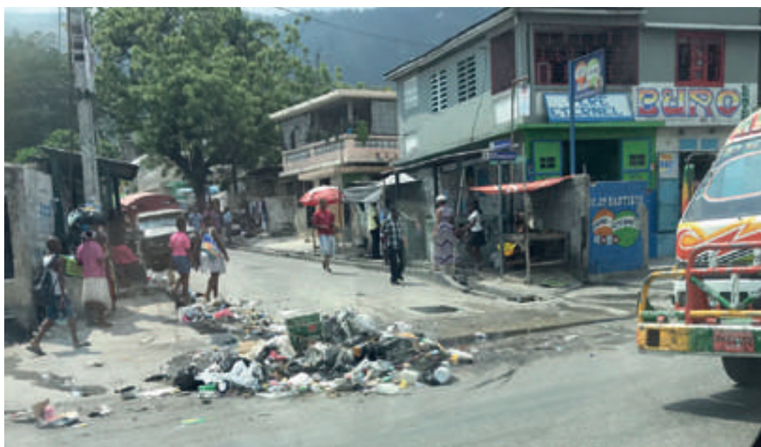
📷 In the absence of integrated sustainable waste management, waste collects in streets and public spaces in low- and middle-income countries. Port-au-Prince, Haiti.

In Maputo, Mozambique, a rapid increase in collection rates was achieved by inviting small community-based companies to provide waste collection in hard-to-reach areas, with collection fees staggered by income level. The city now has a collection rate of 80 per cent, one of the highest in its income group and a 'phenomenal achievement' according to the Global Waste Management Outlook . 197