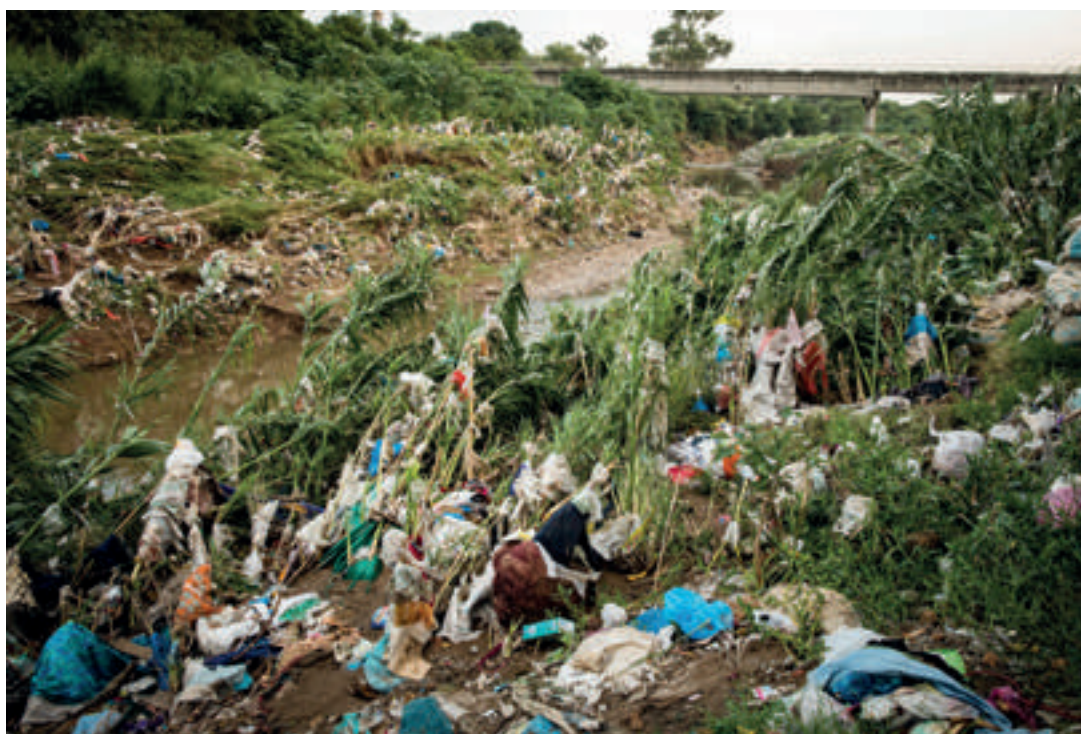
📷 Plastic waste litters river banks and open spaces around the globe.