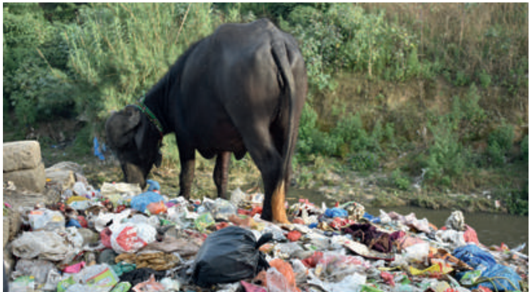
📷 A buffalo roams freely on a waste-covered river bank in Pakistan.

When plastic litters hedgerows, fields and waterways, animals can mistake it for food and eat it. Studies have found that up to a third of cattle and half of the goat population in the Global South have consumed significant amounts of plastic. 91 Research on abattoirs in Kenya shows that cows with plastics in their digestive system are a daily occurrence. In one case, a slaughtered cow had 2.5kg of plastic waste in its digestive system – about the same weight as a laptop. 92 When plastic is swallowed by animals, it does not decompose in their digestive tracts and cannot move through their guts. It leads to bloating, a host of adverse health effects and eventually death by starvation. 93 Alongside the evident suffering this causes the animals, this has dire economic consequences for farmers. 94