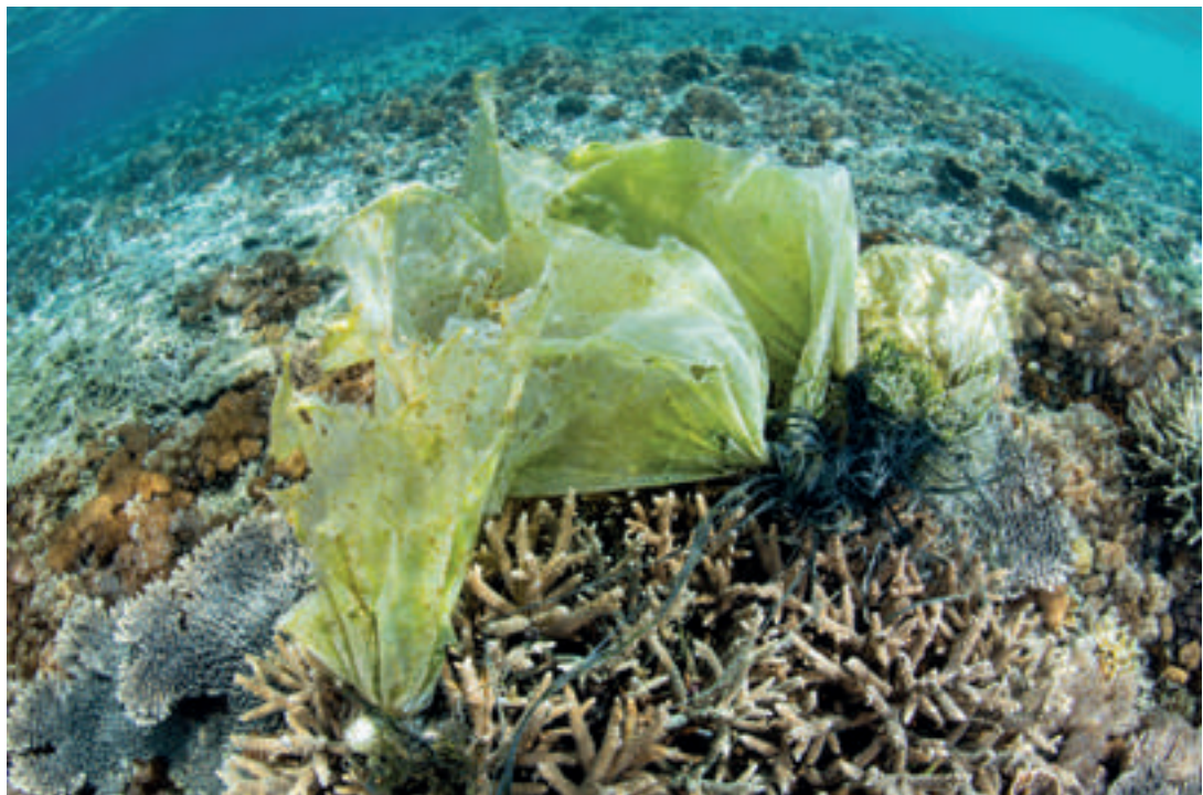
📷 A plastic bag on a coral reef.

These impacts threaten the long-term viability of reef ecosystems including reef-based fisheries, which are important for coastal communities. We discuss this impact on livelihoods in chapter 3. The scale of the problem is alarming. An estimated 11.1 billion plastic items could be entangled on coral reefs across the Asia-Pacific, with a projected increase of 40 per cent by 2025. 38