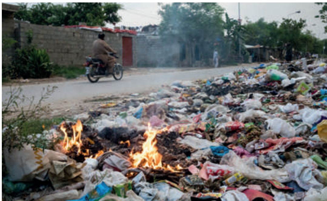
📷 Toxic fumes are released from burning plastic, but many communities have no other options to get rid of their waste.

In Ethiopia, a study showed that children from slums with uncollected waste were six times more likely to suffer from acute respiratory infections than those living where there were regular waste collections. 79