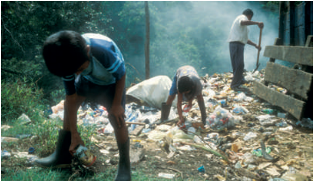
📷 Children working at a rubbish dump in Livingstone, Guatemala.

These groups can exhibit high levels of entrepreneurship, resilience and ingenuity. However, their work is unregulated and waste pickers are often a vulnerable demographic – typically women, children, the elderly, the unemployed, or migrants. 122 They also face considerable challenges: unhealthy conditions, lack of social security and health insurance, fluctuations in the price of recyclable materials, lack of educational and training opportunities and strong social stigma. 123