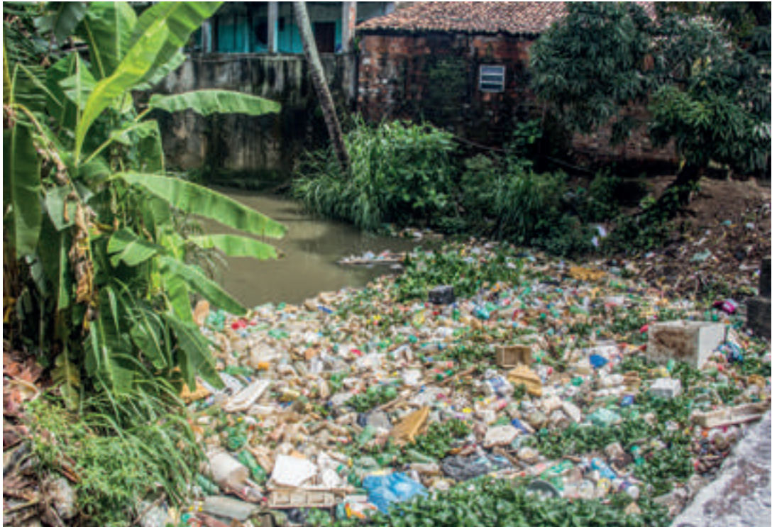
📷 The river Tejipto, in Recife, Brazil, is clogged with plastic waste. Tearfund partner, Instituto Solidare, have a project called 'clean river, healthy city', which is working to clean up the river.

Plastic pollution is creating a growing public health emergency in many towns and cities around the world. New research by Tearfund suggests that between 400,000 and 1 million people die each year in developing countries because of diseases related to mismanaged waste. 2 At the upper end that is one person every 30 seconds. Mismanaged waste, including plastics, harms people's health in developing countries in the following ways: