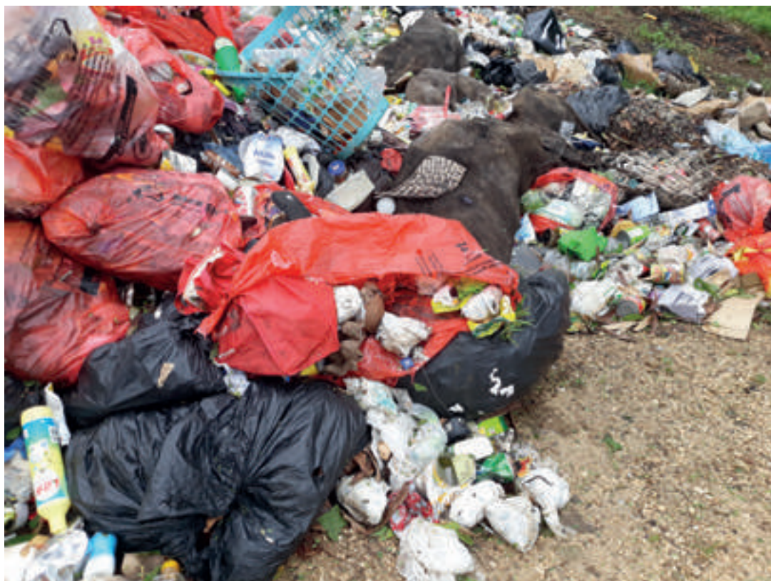
📷 Nappies in discarded waste in Vanuatu, South Pacific.

According to the UN, living among uncollected waste doubles the incidence of diarrhoeal disease . 67 In many countries, it is common practice to dispose of child faeces as part of the household rubbish – either in plastic bags or in disposable nappies. 68 Faeces may also be in the environment through flooding caused by blocked drains and waterways (as mentioned previously).