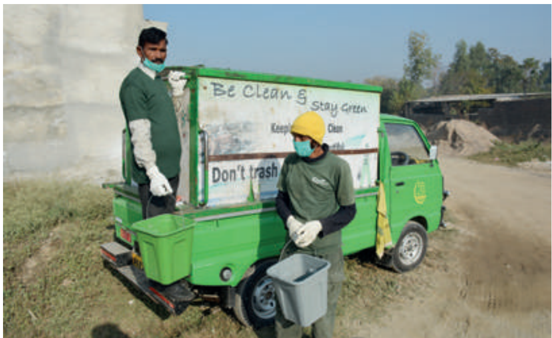
📷 'Environment guards' collect household waste and transport it to the IRRC in Islamabad.

When starting a project such as the IRRC, it is important to make sure no harm is done to those already working informally as waste pickers. Instead, the centre makes sure it employs existing local waste pickers among its staff, providing them with safer and better-paid employment. The centre calls their waste workers 'E-guards' (Environment guards) and supplies them with a protective uniform, giving them dignity and respect in the community.