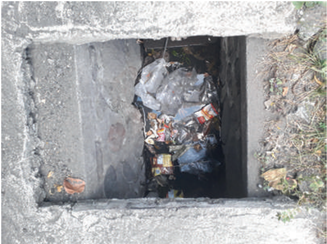
📷 Mixed plastic pollution – including plastic bags – in a storm drain, Bali. A growing number of countries have bans or taxes in place for single-use plastic bags.

Governments can also provide incentives for innovative product design that aims to reduce the plastic content of products or improve recyclability, along with shifts to viable alternative, non-plastic materials (while being aware of the negative impacts that some proposed alternatives may have); 205 and they can incentivise the use of reusable and refillable items (such as food containers and drinking bottles), through awareness, subsidies for refillables and levies for non-reusable items through the supply chain.