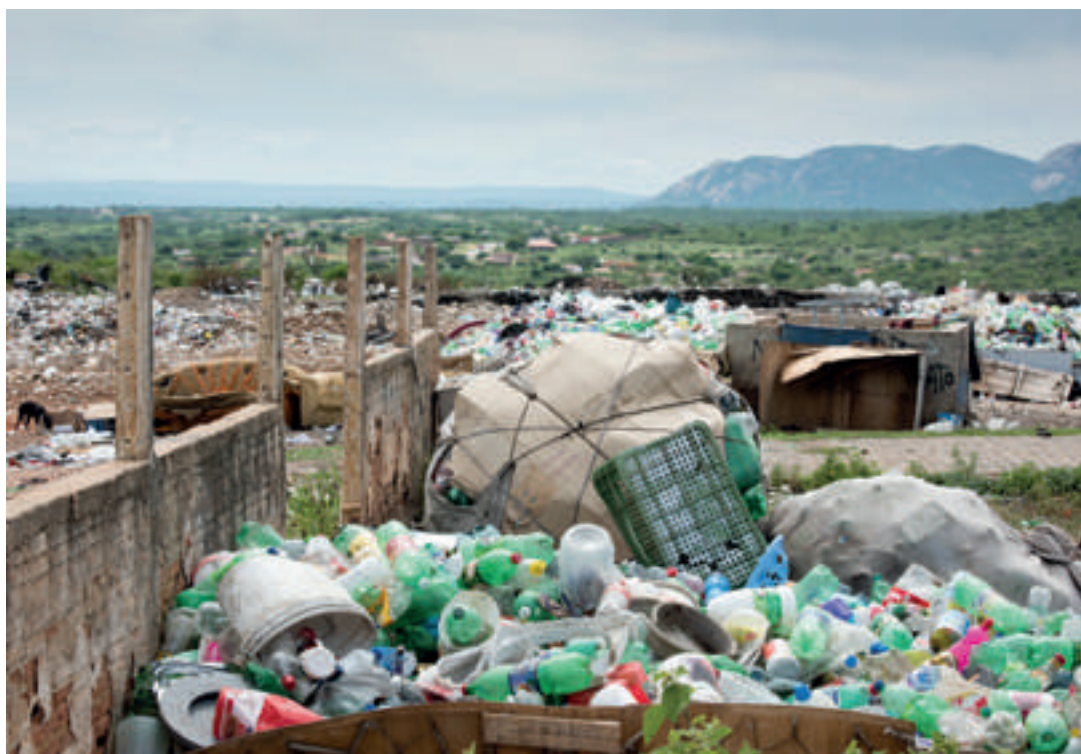
📷 A municipal waste dump in Brazil.