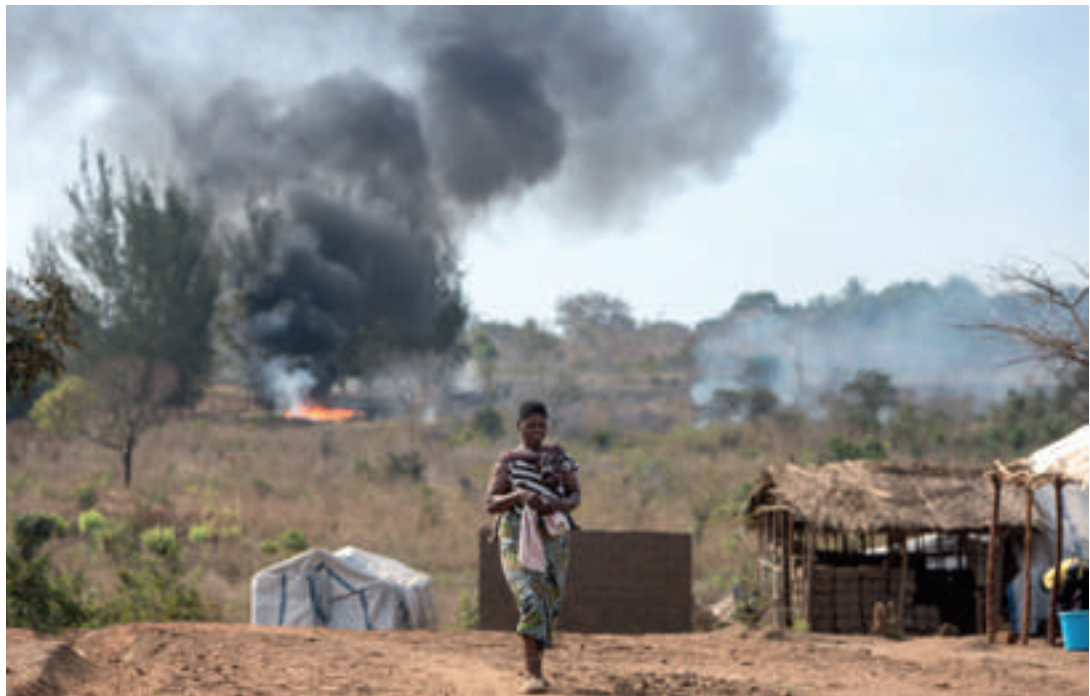
📷 A woman and her baby with burning rubbish behind her in the Mocuba District of Mozambique.

Plastic pollution is also contributing to climate change . While global plastic production emits 400 million tonnes of greenhouse gases each year (more than the UK's total carbon footprint), according to the World Bank solid waste was responsible for a further five per cent of global emissions in 2016. The true figure may be much higher: emissions from backyard burning of waste are not included in most current emissions inventories, despite research revealing that in several developing countries they dwarf all other sources of carbon emissions combined.