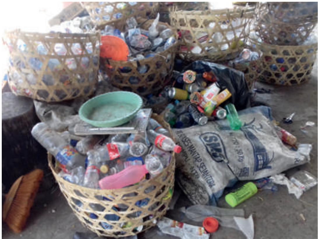
📷 Beach litter collected in Bali.

As many as 820 million people directly and indirectly rely on fisheries as a source of income to support food security, 97 so the human impact of these changes could be vast. Despite this, very little research has been conducted to assess the impact of plastic pollution on fishing communities. As long ago as 1992, the negative impacts of plastic pollution and marine debris on small-scale subsistence fishing communities and livelihoods were documented in Indonesia. 98 The study found that plastic waste impacted fishing activities through propeller entanglements, damage to fishing gear and injuries to people. The most direct impact was a decreased yield of fish caused by plastic pollution. But there were also indirect costs – increased expenditure (for example for repairs or for medicine for an injury) or an increased amount of time spent on fishing or fishing-related activities. The report also highlighted that for fisherfolk living at the subsistence level, even a minor decrease in fishing yield can mean that they cannot provide for their own basic needs such as food.