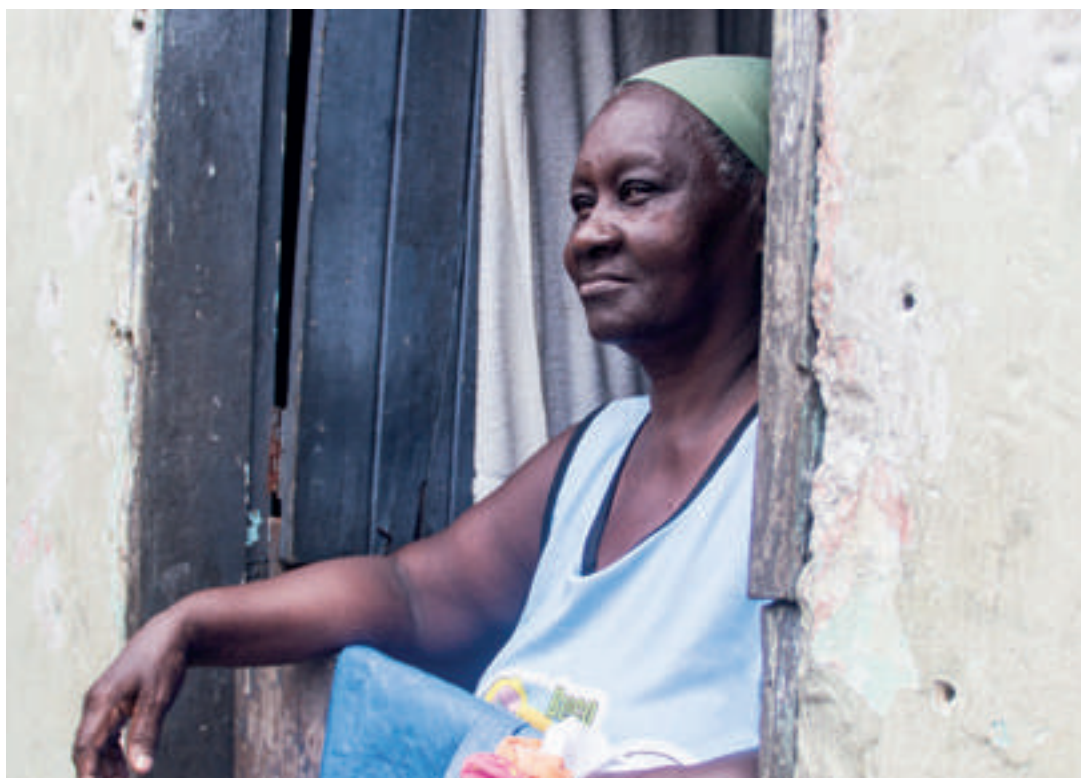
Community member in the Coqueiral neighbourhood of Recife, Brazil, whose house regularly floods due to waste blocking the river and more frequent rains.

Things look extremely bleak if the world continues with business as usual.