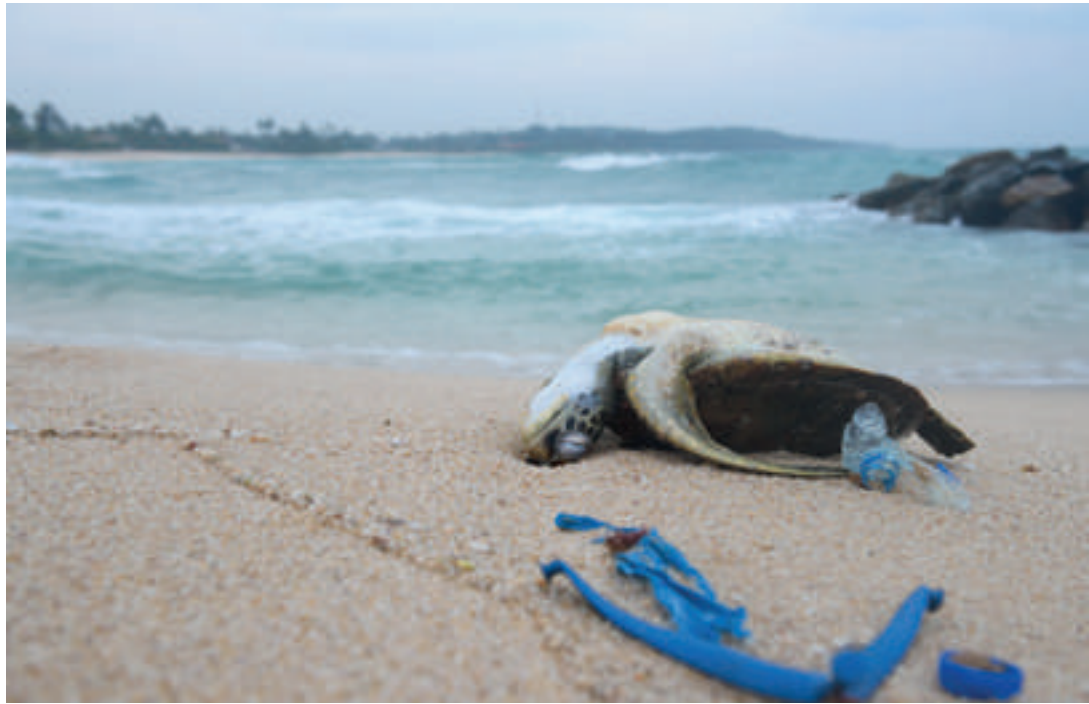
📷 Dead sea turtle among ocean plastic waste.

The conditions of the marine environment cause plastic to break up into smaller and smaller pieces that are easily ingested by marine animals, who can mistake them for food. 27