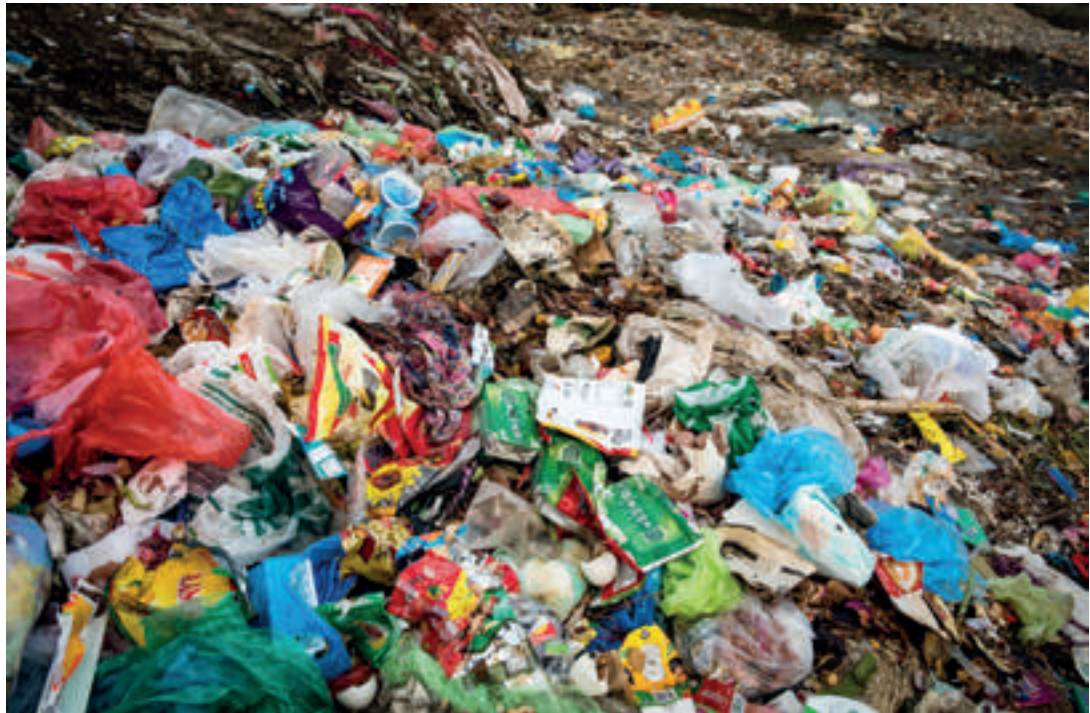
📷 Urgent action is needed to tackle the waste crisis.