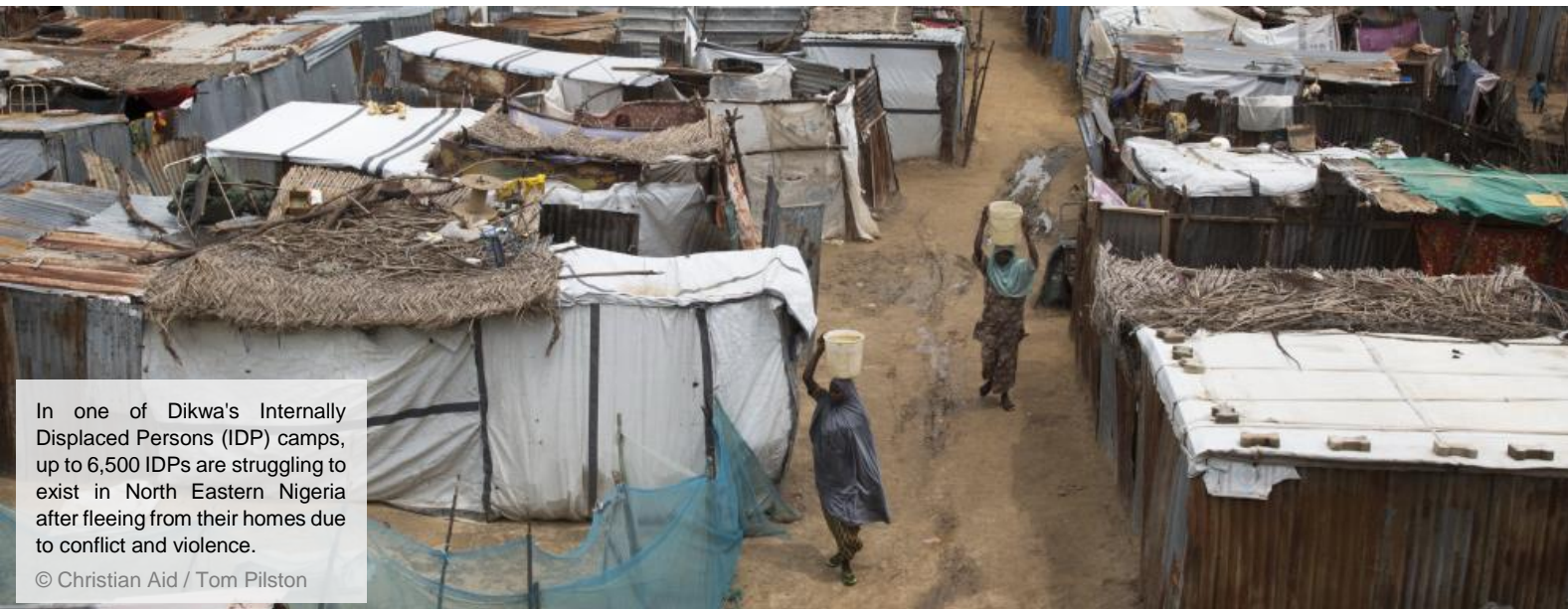
In one of Dikwa's Internally Displaced Persons (IDP) camps, up to 6,500 IDPs are struggling to exist in North Eastern Nigeria after fleeing from their homes due to conflict and violence.