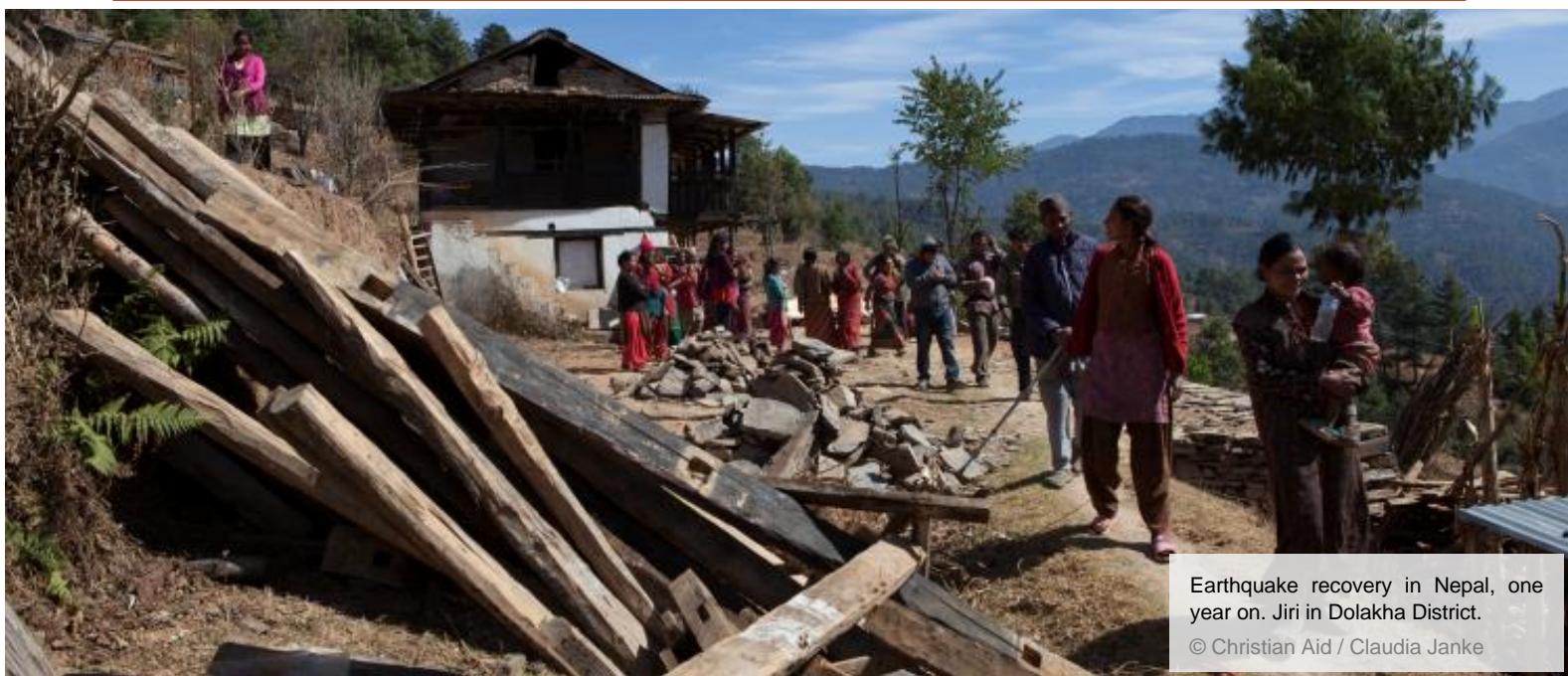
Earthquake recovery in Nepal, one year on. Jiri in Dolakha District.