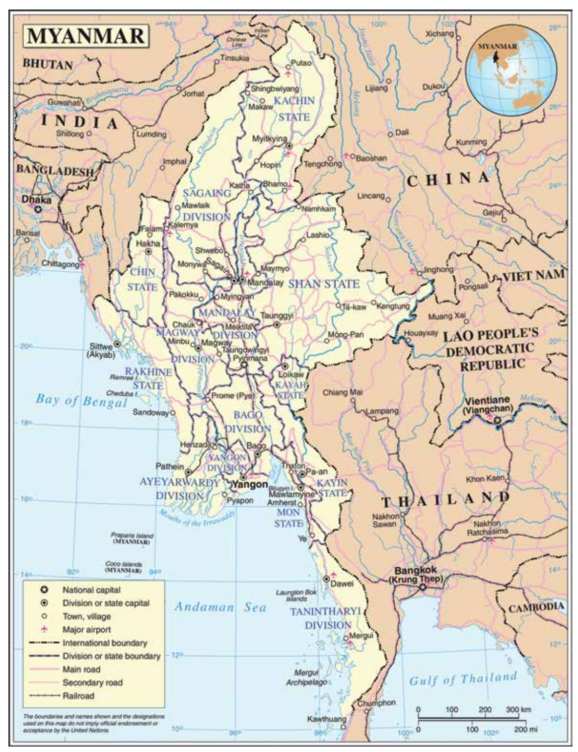
Map of Myanmar (United Nations)

Myanmar has a pluralist and complex society with over 100 different ethnic groups. The majority of the population adhere to Theravada Buddhism, followed by Christianity (Roman Catholics, Anglicans, and other small Protestant denominations), Islam (mainly Sunni), Hinduism and animism.<sup>10-12</sup>