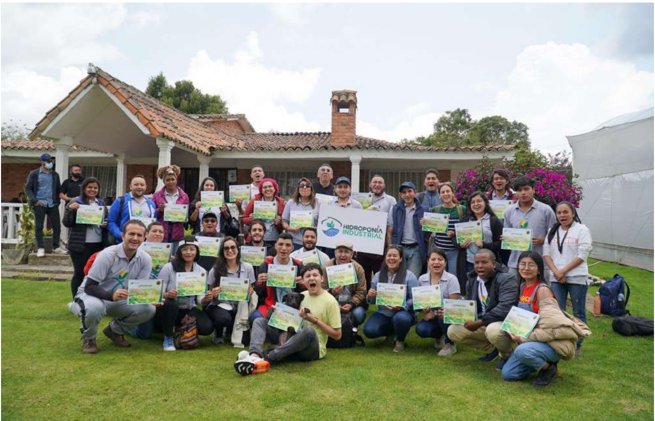
📷 More than 40 young people from across Latin America gathered in Colombia to pray, learn about good governance and care for creation, and be equipped to enhance justice in their communities.

Self-help groups (SHGs) play a significant role in bringing together Tearfund's integrated approaches. Not only do they help increase participants' income and entrepreneurship, but they also bring communities together.