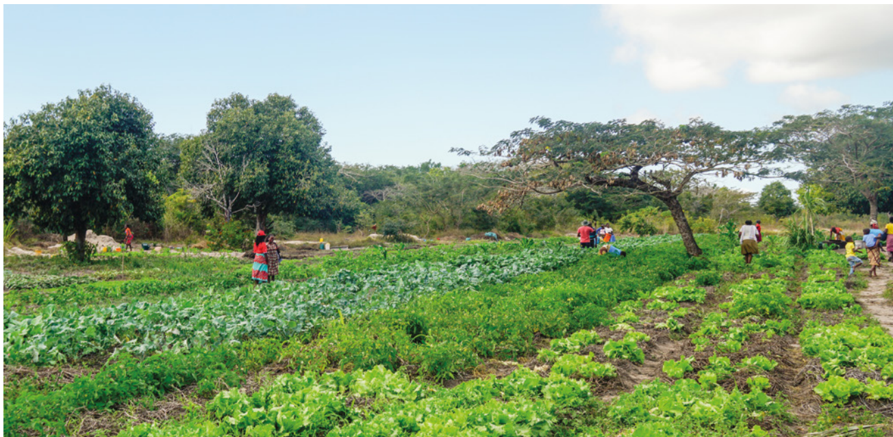
Members of the Nhanzeco community, Mozambique, work in their fields. They have been trained in church and community transformation, self-help groups, conservation agriculture, nutrition, sanitation and advocacy around land rights and environmental conservation.