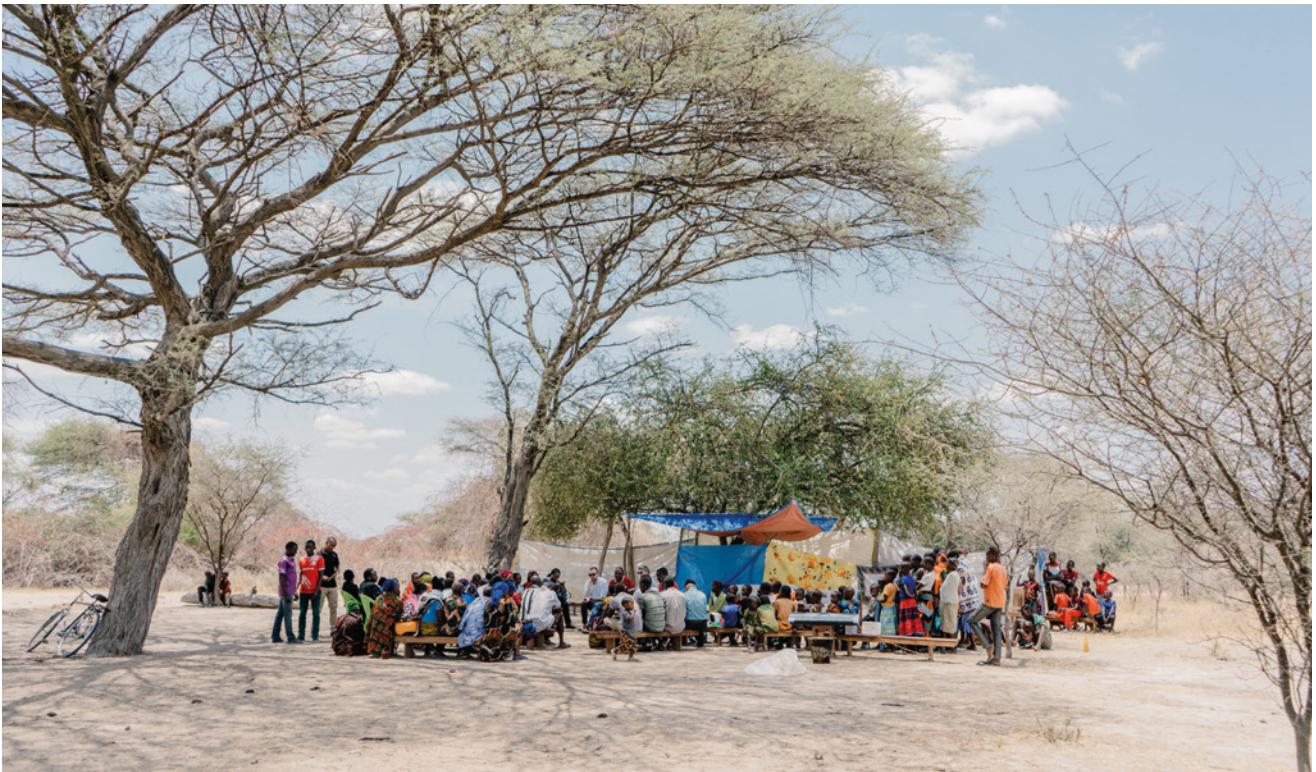
📍 A community meeting in Rift Valley in Tanzania.

refers to the theological framework that enables this, in particular a relational anthropology in which our identity is formed in community. In contrast to this paradigm, a theology of scarcity teaches us: