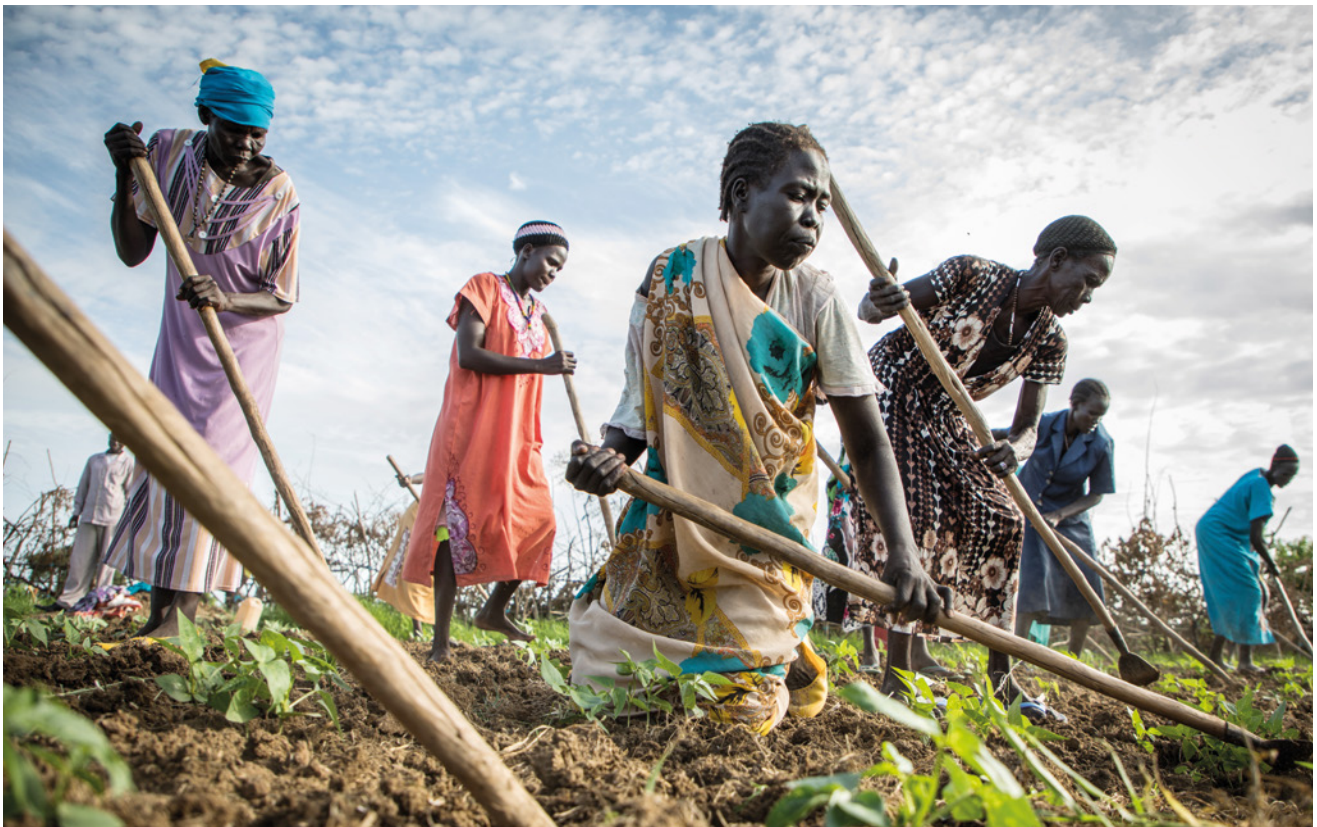
☐ Participants clear weeds in a demonstration plot at a farmer field school project near the town of Warawar in Aweil, South Sudan. Through a Tearfund project in the area, farmers in Warawar have received improved seeds for crops such as sorghum, soya, sesame and pumpkin. They are also taught good agricultural practices to improve the quality and quantity of their crops during harvest time.

Kathryn Tanner makes the case for an economic theology of grace and giftfulness which is grounded in the whole sweep of God's character and dealings with the world. The central feature of her idea is that just as God has freely given to us, so we should freely give to one another. She calls this a 'non-competitive economy' in which whatever we have received can be freely distributed without in any way diminishing our own status or wellbeing. This stands in stark contrast to a culture which not only selfishly hoards, but also uses possessions as a