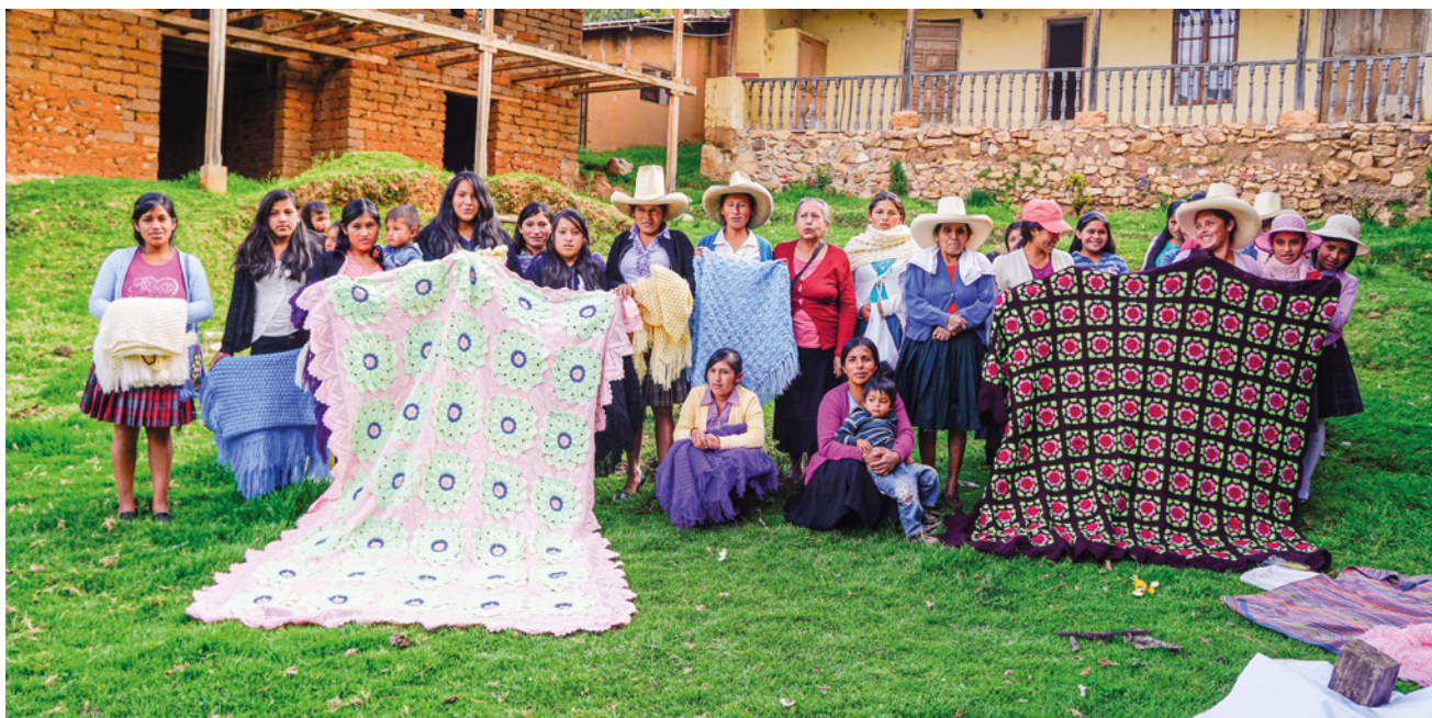
▣ Members of a women’s entrepreneurship project in Cajamarca, Peru, display their traditional weavings to be sold at market. The project aims to improve the livelihoods of women in this indigenous community.

Given the reality of climate change, it may be going too far to say that worship of creation does more damage than anthropocentric domination. Nevertheless, what these authors do make clear is that worship of nature is not always the panacea we might have hoped. The idea we are left with is that while there are some indigenous spiritualities that reflect our biblical mandate to preserve and care for creation, and as such provide shining examples of how to live with creation, they are not necessarily the final answer as to what it means to live as God’s representatives on earth. Our primary concern must always be that our relationship to God and the biblical mandate governs our relationship to the earth, for appropriate care of creation does not result from worship of creation, but only from worship of the creator.