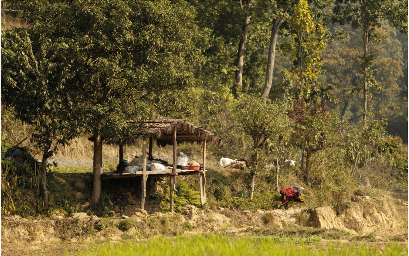
📷 One of the women from the local community tidying up the banks of an irrigation channel in a village near Nawalparasi, Nepal.

way to falsely prop up social status. She notes how in an economy of gift, 'The recipients do not hold these goods simply for themselves as a form of exclusive possession, but distribute them to others in much the way God has distributed those goods to them in the first place.' 27 In light of Tanner's framework, the question that confronts us is what are the broad policy objectives that such an economic theology of grace might generate? 28