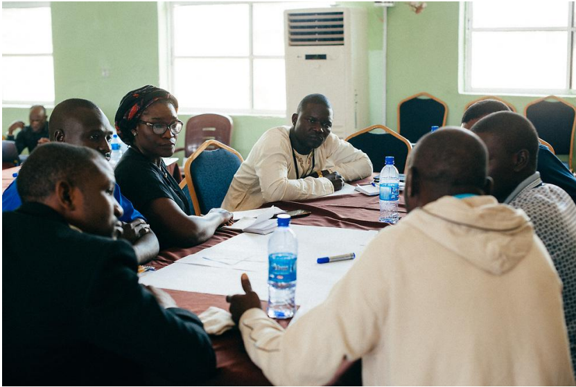
A group of Church leaders meeting in Nigeria