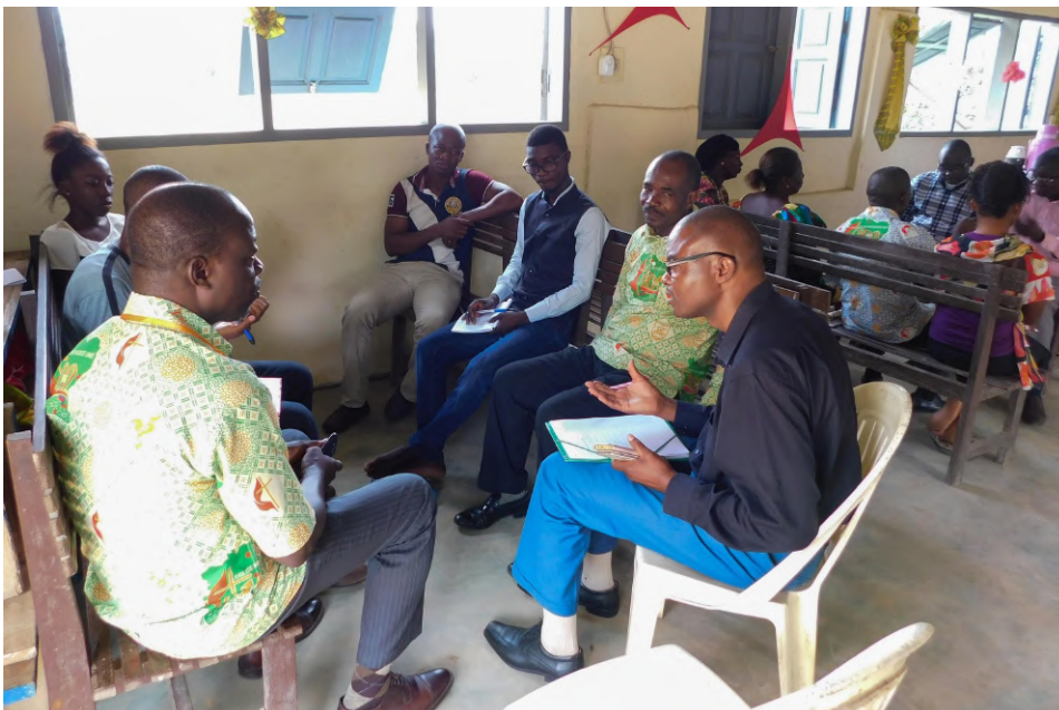
📷 Church leaders in the United Methodist Church of Abbe broukoi, Cote D'Ivoire.

The church can offer to support the implementation of good government policy by raising community awareness and providing feedback on policy implementation through agreed monitoring and accountability mechanisms.