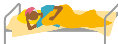
People with serious health conditions