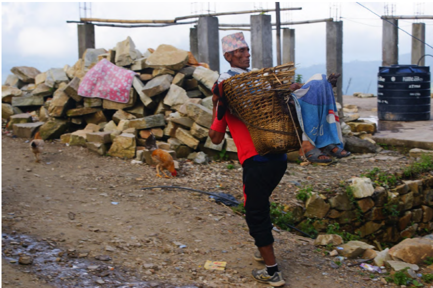
📷 Helping an elderly man get to a medical centre in Nepal.

If the vaccine requires two doses to be effective, similar support might be needed again when the person returns to receive their second dose.