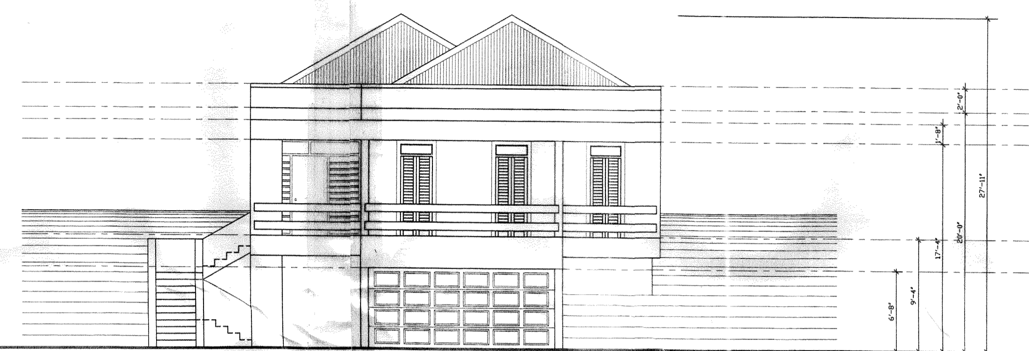
SOUTH ELEVATION SCALE: 1/8" = 1'-0"

TOWN & COUNTRY DEVELOPMENT PLANNING OFFICE APPROVED PLAN NUMBER 3780 / 110 / 15000A DATE 2007 / 04 / 08 A CHIEF TOWN PLANNER