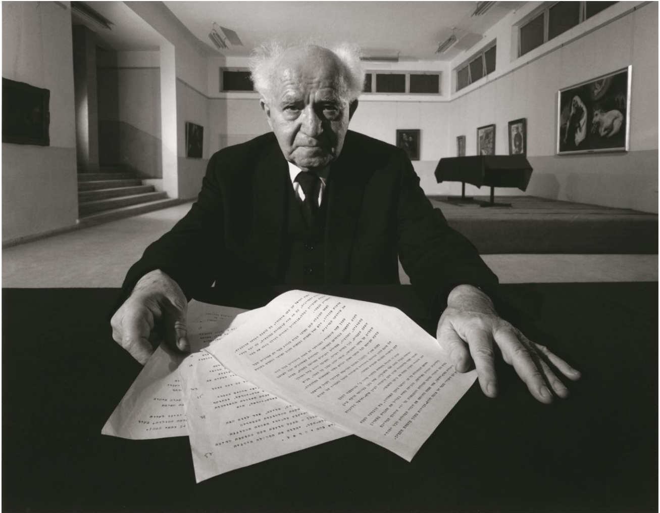
Arnold Newman, David Ben-Gurion, politician and Prime Minister of Israel, Jerusalem, Israel, 1967 . Gelatin silver print © 1967, 17 1/16 x 21 1/16 in. Arnold Newman/Getty Images Courtesy: The Widder Collection, San Diego.