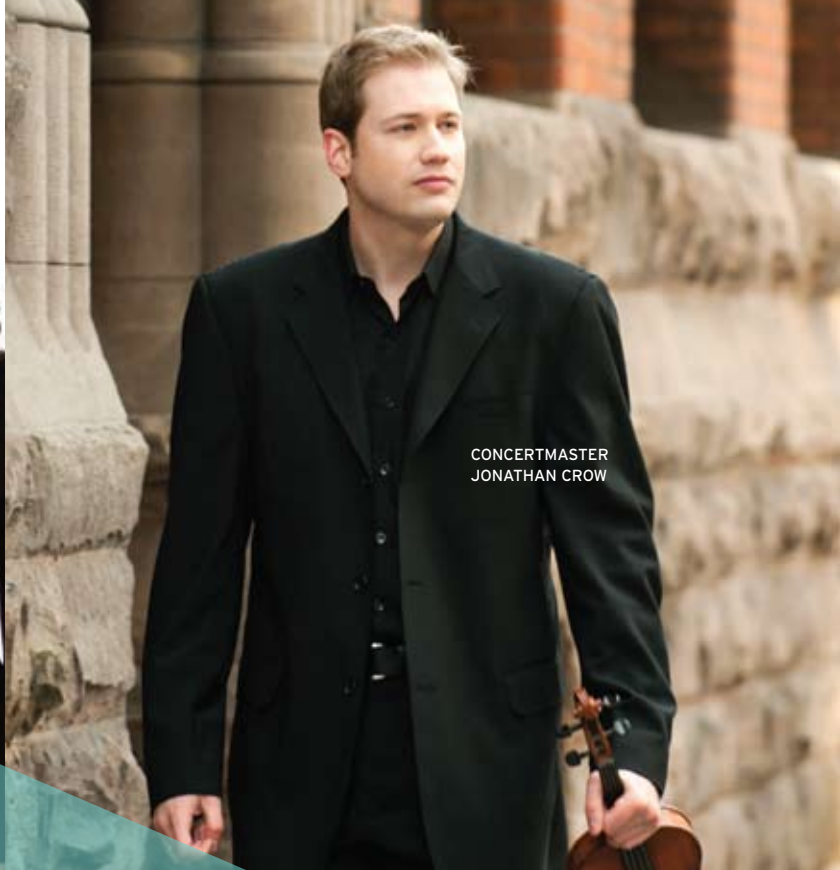
CONCERTMASTER JONATHAN CROW

NINE MUSICIANS OF THE ORCHESTRA WERE FEATURED AS SOLOISTS THROUGHOUT THE 2012/2013 SEASON.