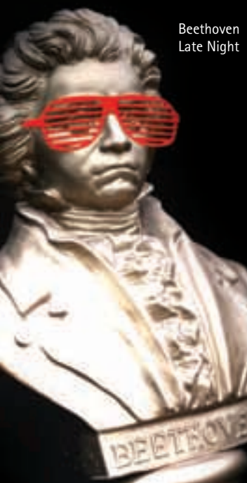
Beethoven Late Night