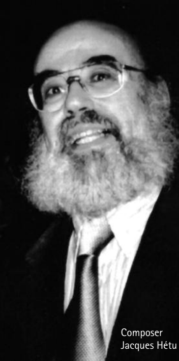
Composer Jacques Hétu