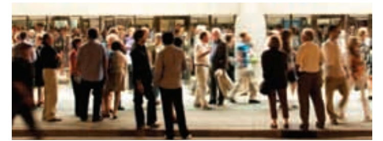
TSO Late Night crowd, June 2010