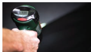
+ EXTREME HEAT