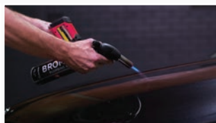
+ BLOW TORCH