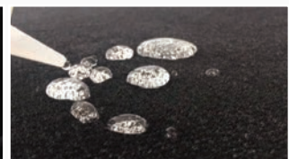
+ LIQUID SPILLS

These images show actions performed by trained professionals in a controlled environment. Please do not attempt to re-create or re-enact any demonstration or activity performed in these images.