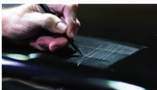
+ 9H HARDNESS