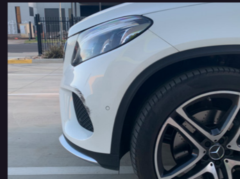
Now let's see the complete panel that has the damage, about 1 meter away and directly in front of it.