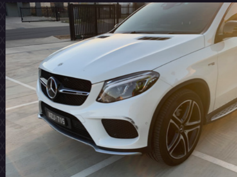
Just so we are sure there is no additional damage, we need an angled photo of the damage about 1 meter away.