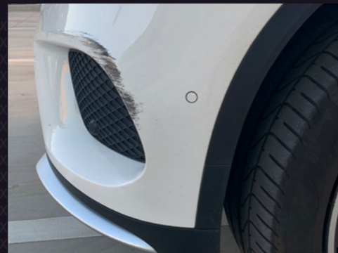
Take an up front and close photo, about 30cm away from the damage, making sure You capture all the damage.

Please follow the photo guidelines to reduce delays in assessing Your Repair Request. We are reliant on the quality of the photos You provide to be able to make an informed decision on whether we are able to repair the damage or not.