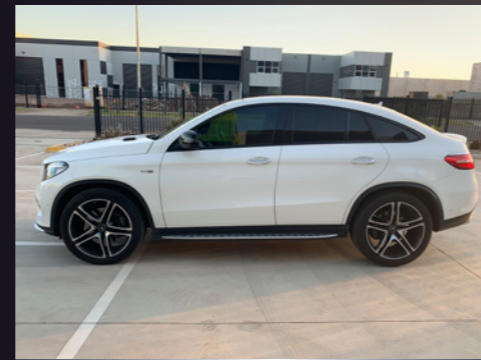
Now take a photo that includes the surrounding panels - we need to see the full side.

Photo tips to reduce the risk of photos being rejected: