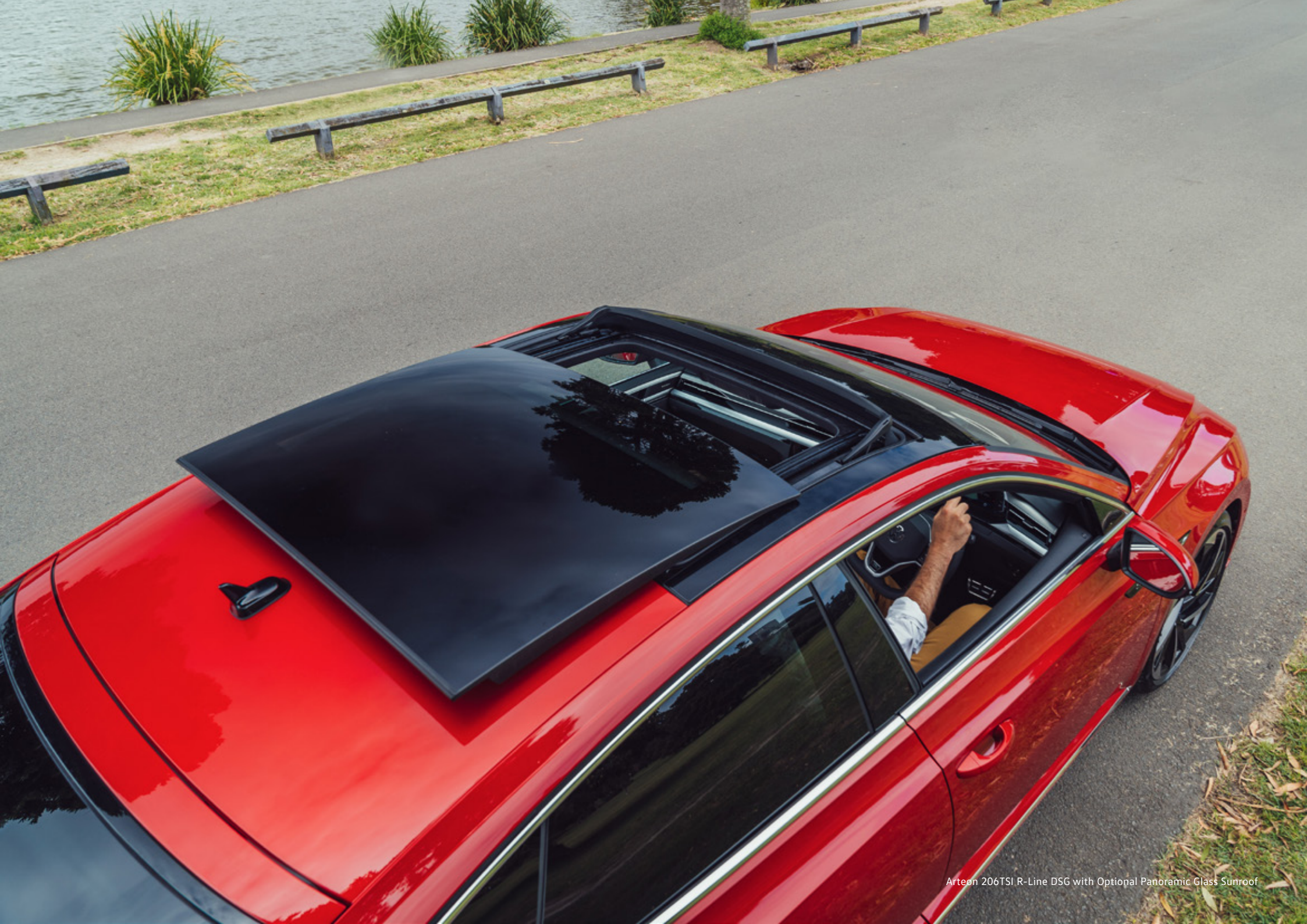
Arteon 206TSI R-Line DSG with Optional Panoramic Glass Sunroof