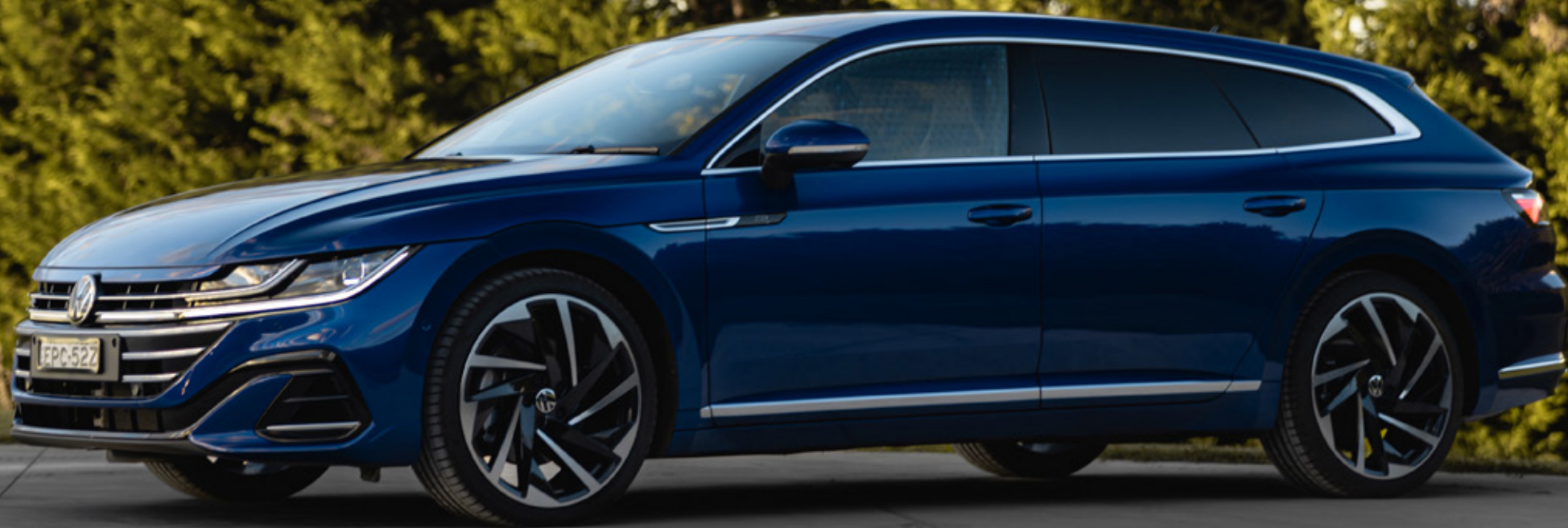
Arteon Shooting Brake 206TSI R-Line DSG