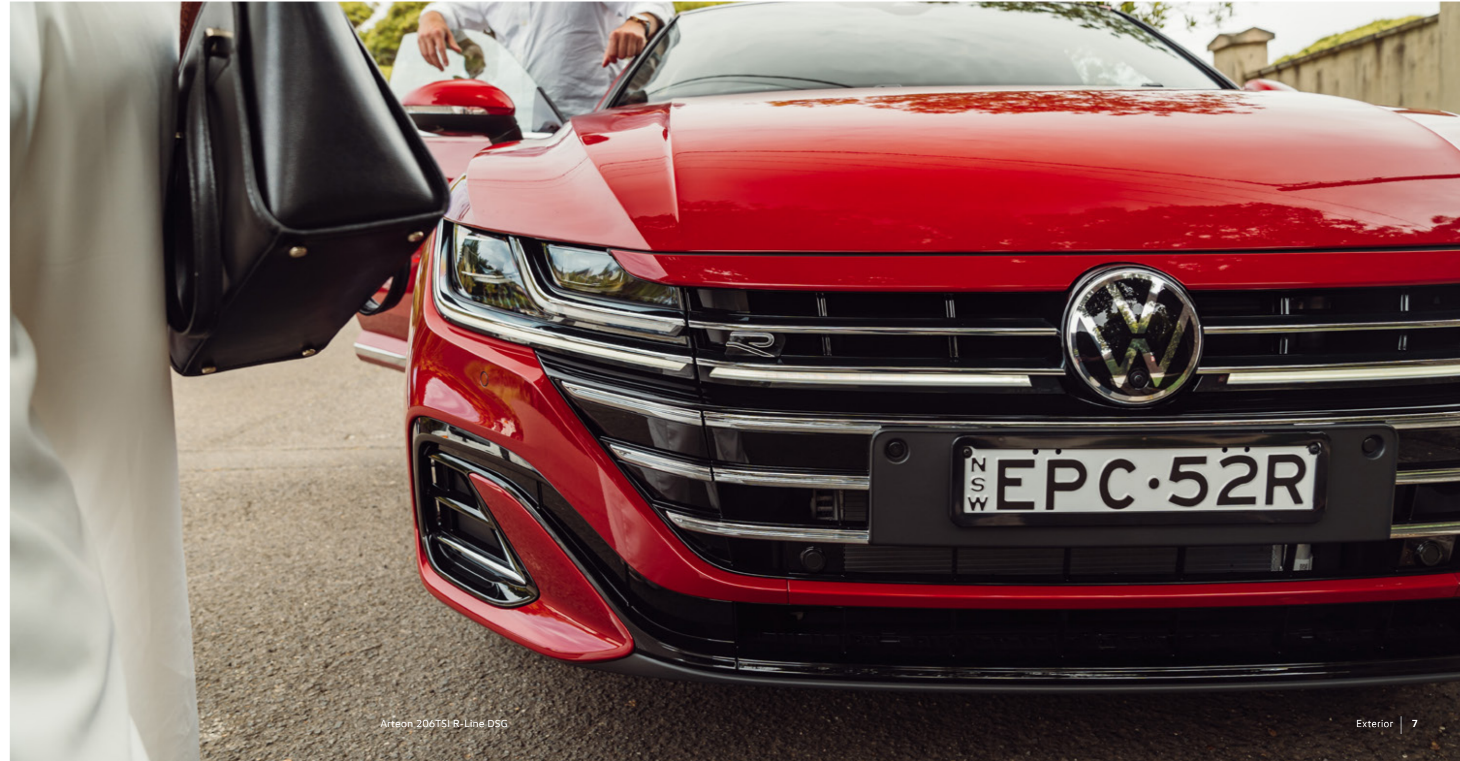
Arteon 206TSI R-Line DSG