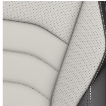
Mistral Nappa leather appointed seat upholstery*