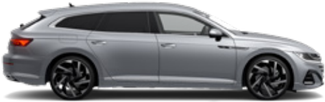
Pyrite Silver M