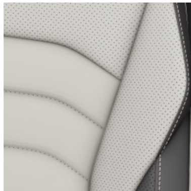
Mistral Nappa Leather appointed Seats* Optional on Arteon & Arteon Shooting Brake 140TSI Elegance