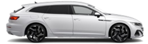
Oryx White PL