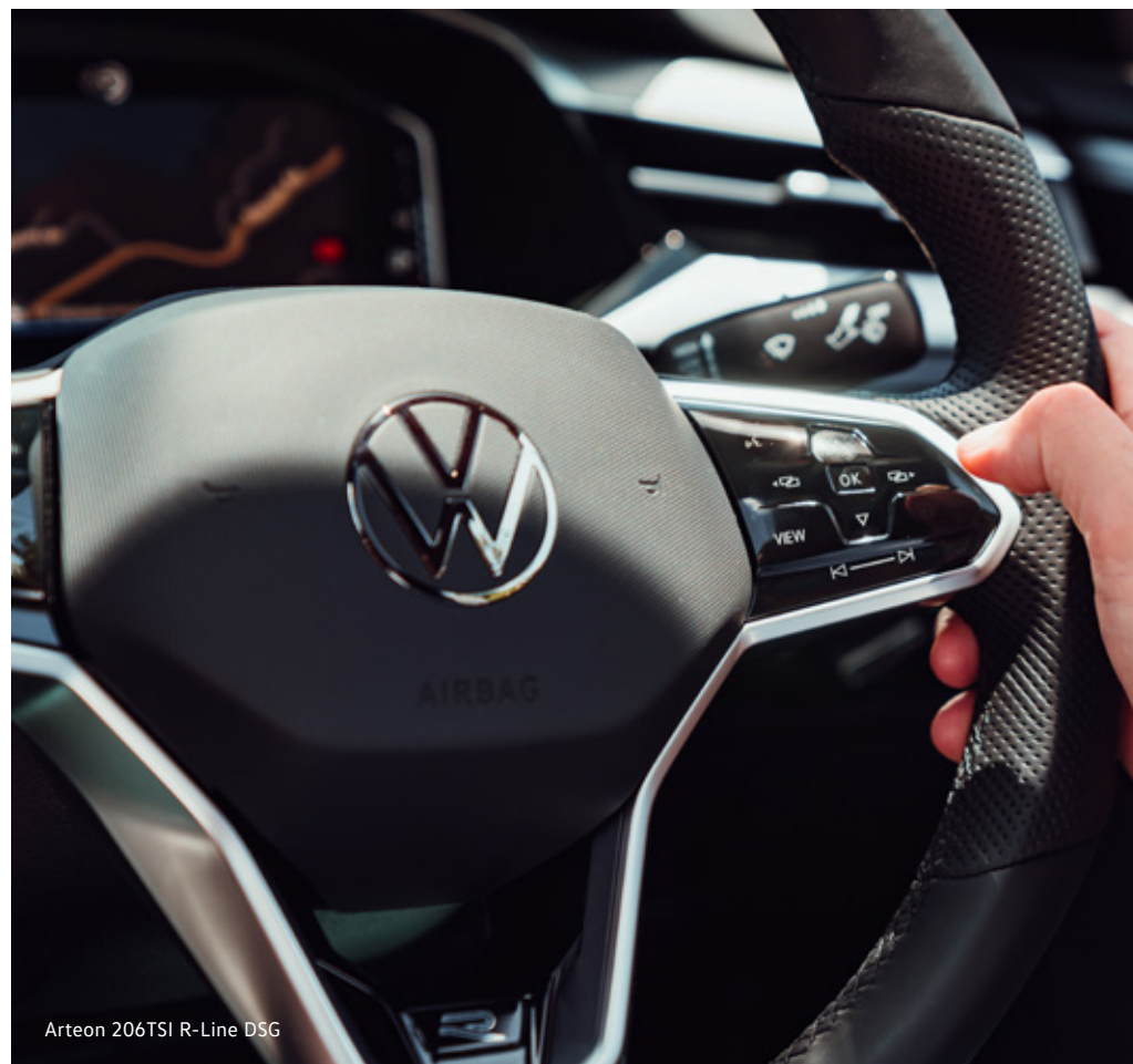
Arteon 206TSI R-Line DSG