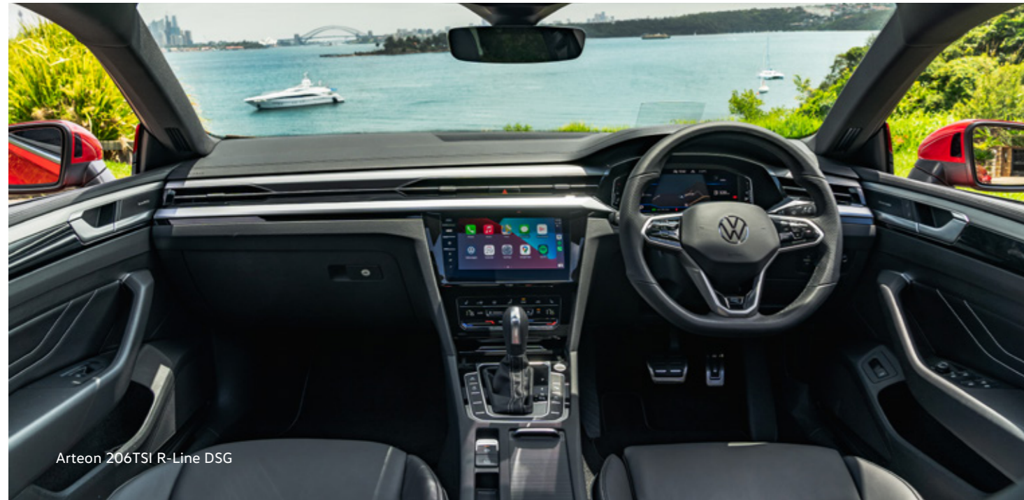
Arteon 206TSI R-Line DSG

For a gloriously light-filled cabin, an optional sunroof is available across the entire Arteon range.