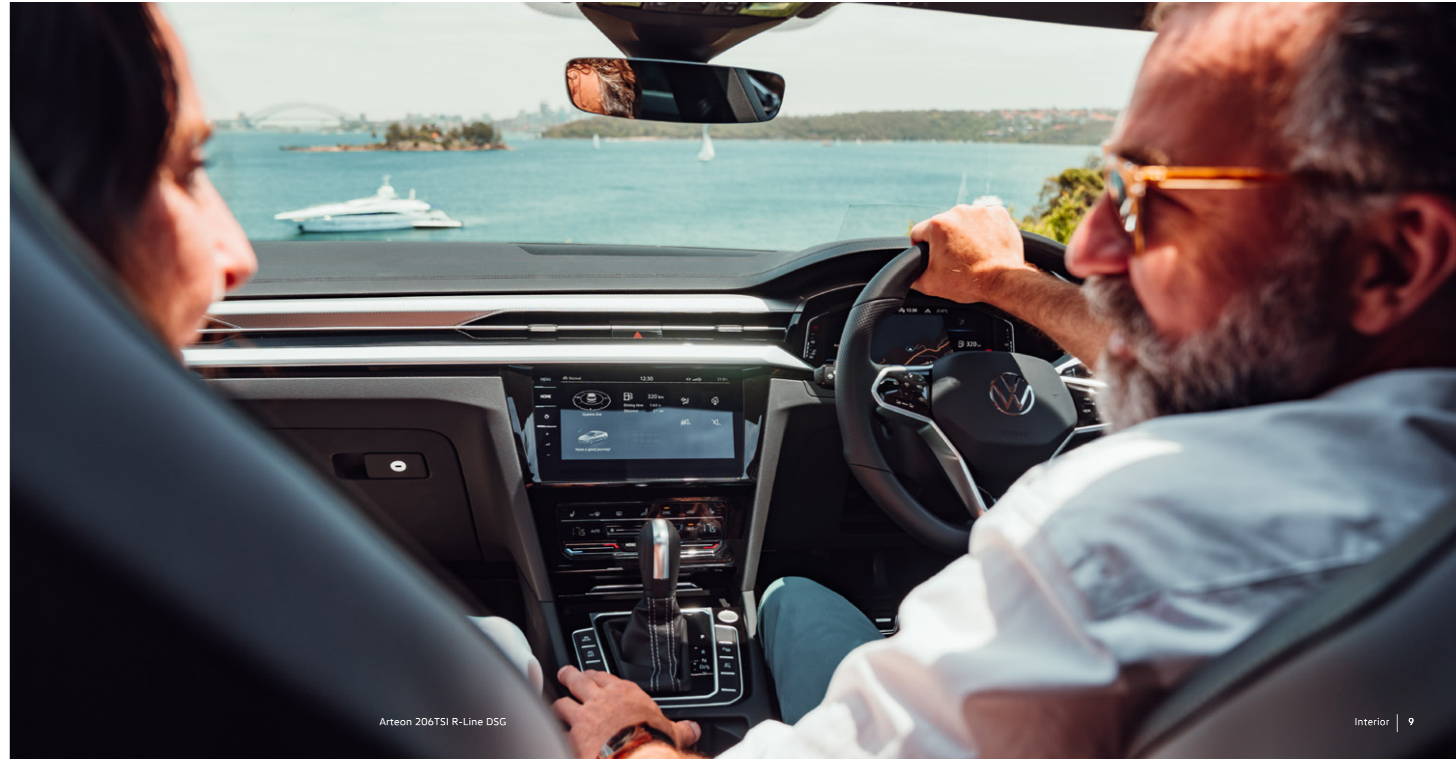
Arteon 206TSI R-Line DSG