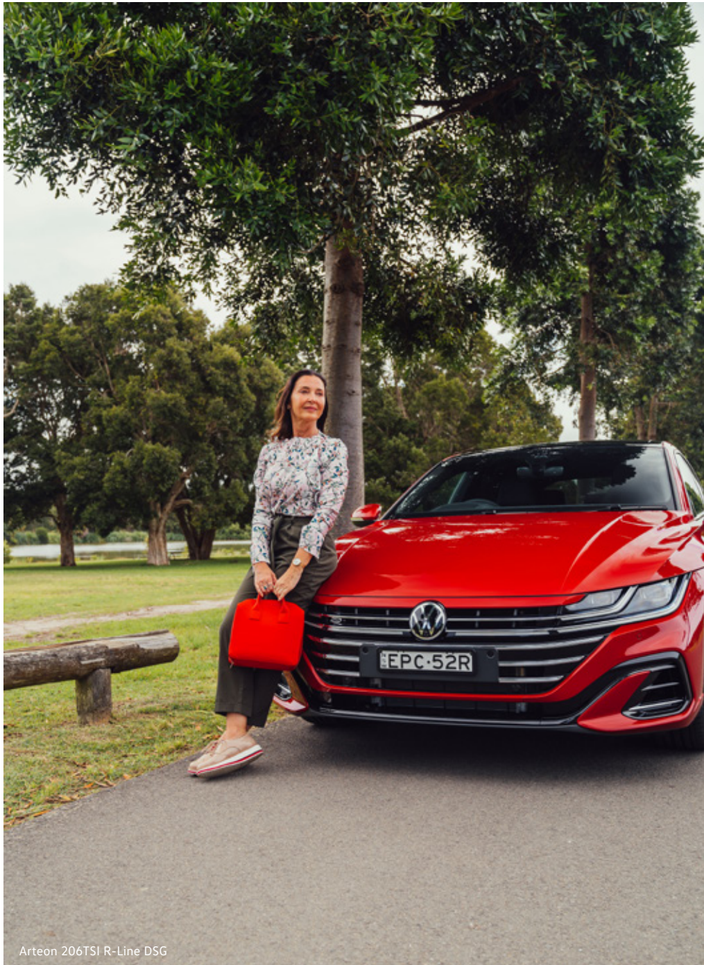
Arteon 206 TSI R-Line DSG