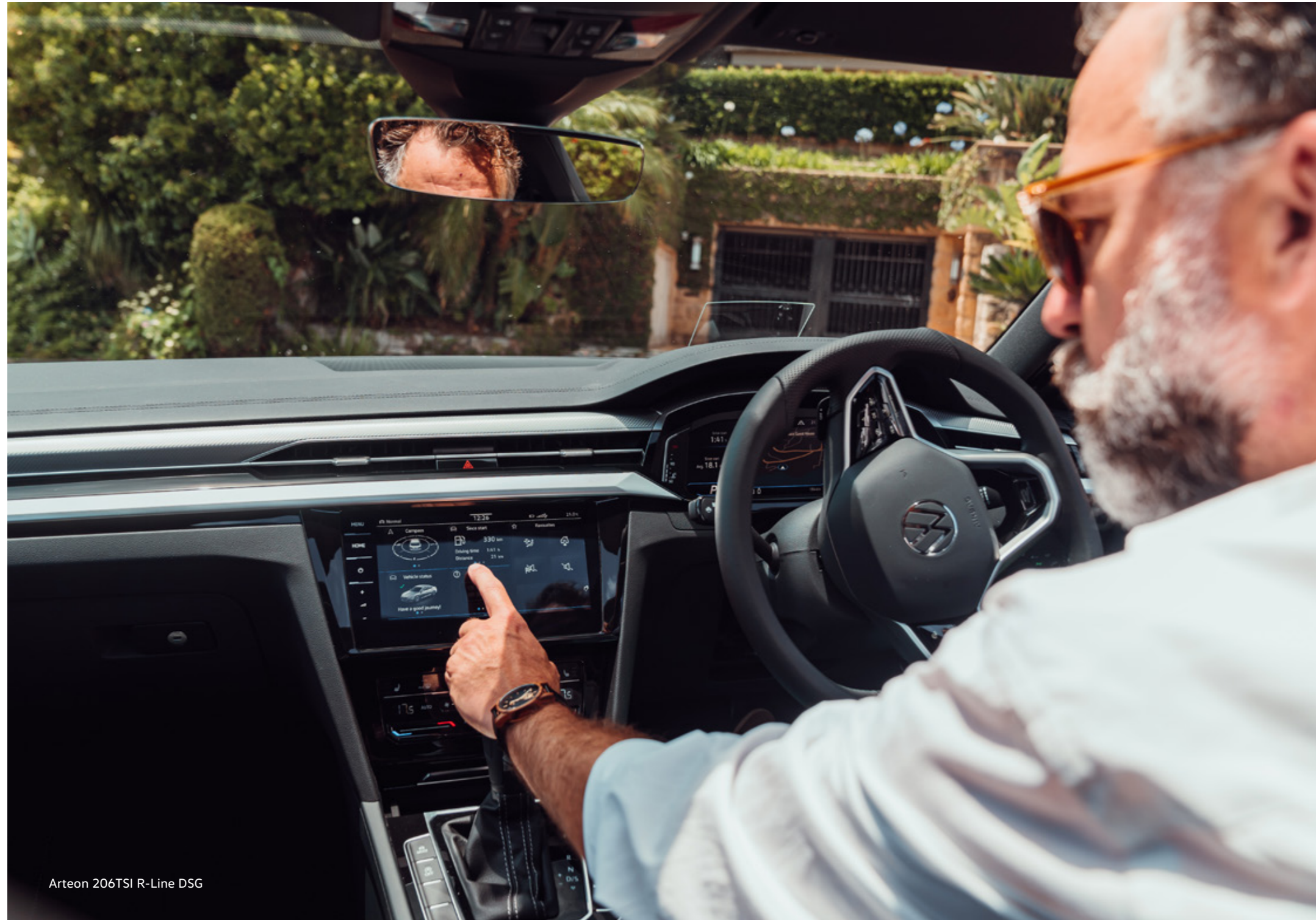
Arteon 206TSI R-Line DSG