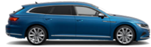
Kingfisher Blue M¹