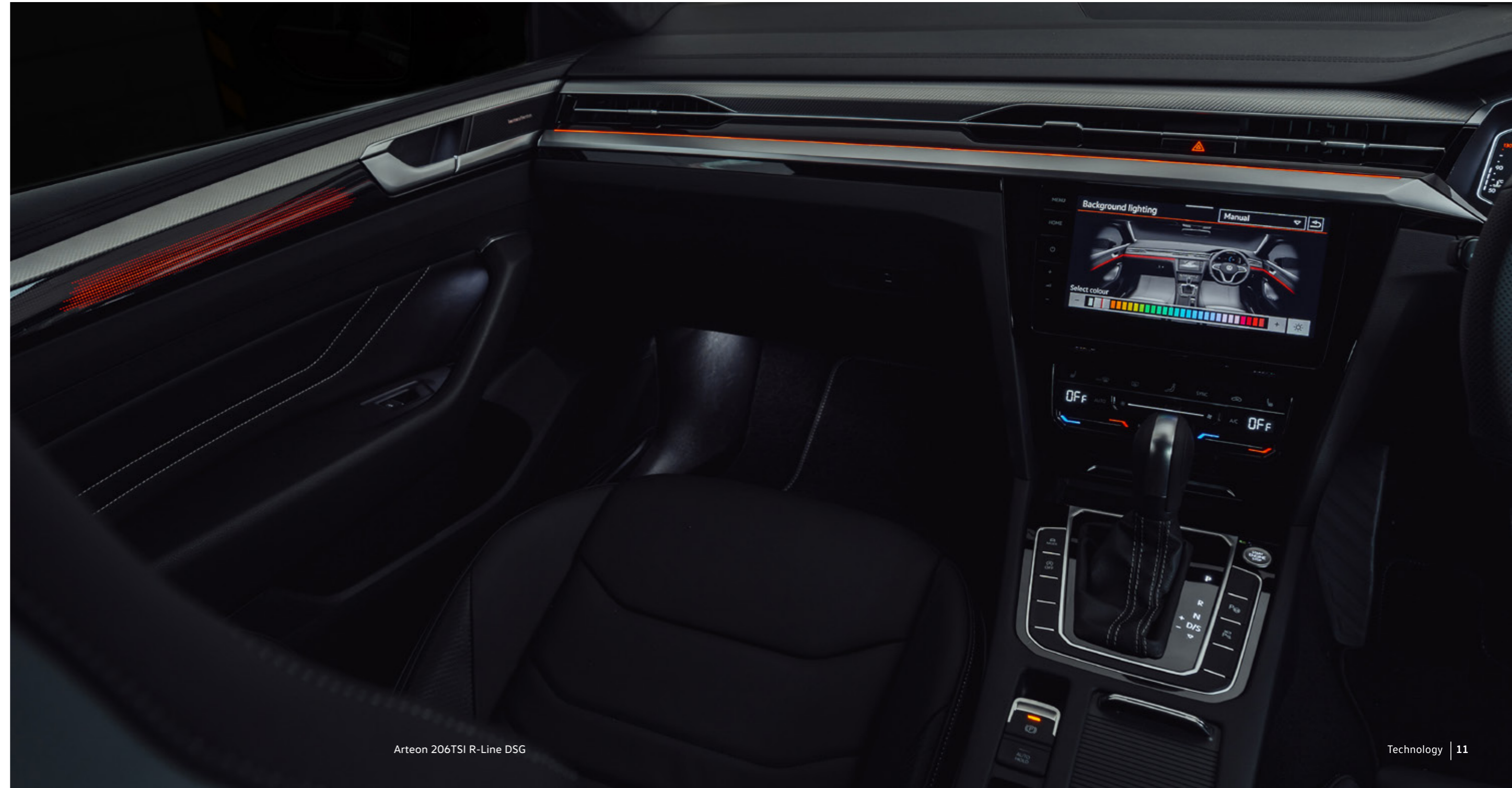
Arteon 206TSI R-Line DSG

-App-Connect featuring wireless Apple CarPlay® and wireless Android Auto™ is compatible with the latest versions of iOS and Android, active data service required, optional connection cable (sold separately).