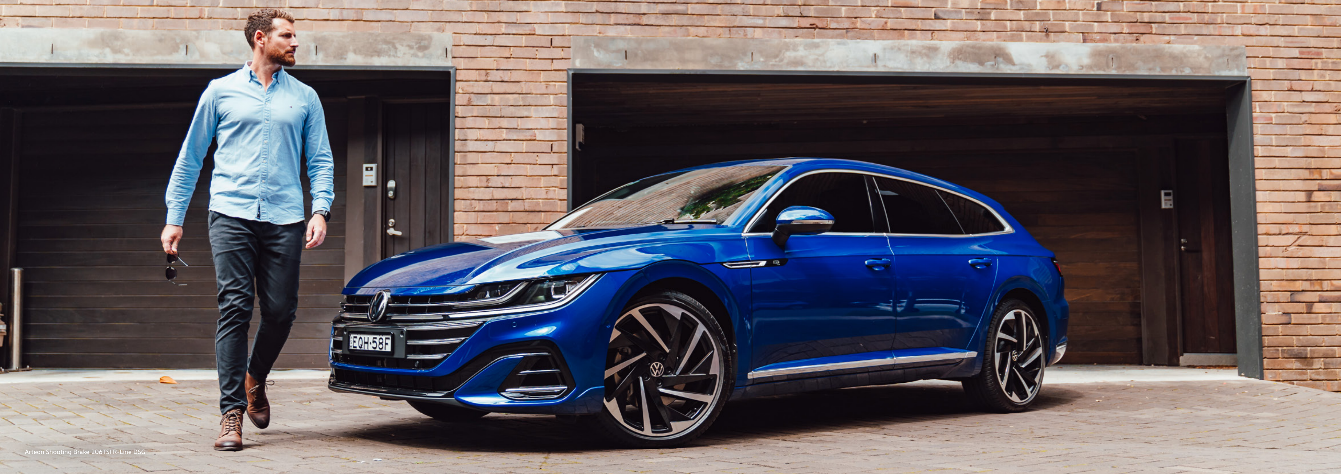
Arteon Shooting Brake 206TSI R-Line DSG