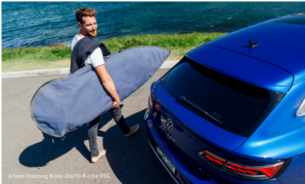
Arteon Shooting Brake 206TSI R-Line DSG