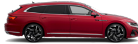
Kings Red PM