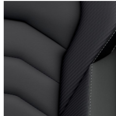
R-Line Black Carbon Nappa leather appointed seat upholstery*