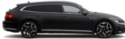
Manganese Grey M