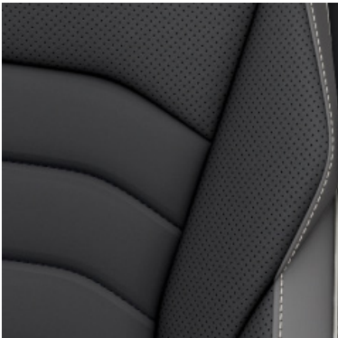
Titan Black Nappa leather appointed seat upholstery*