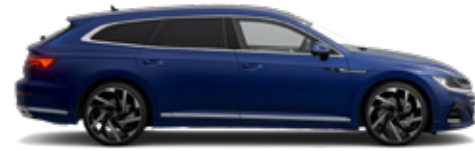
Lapiz Blue PM