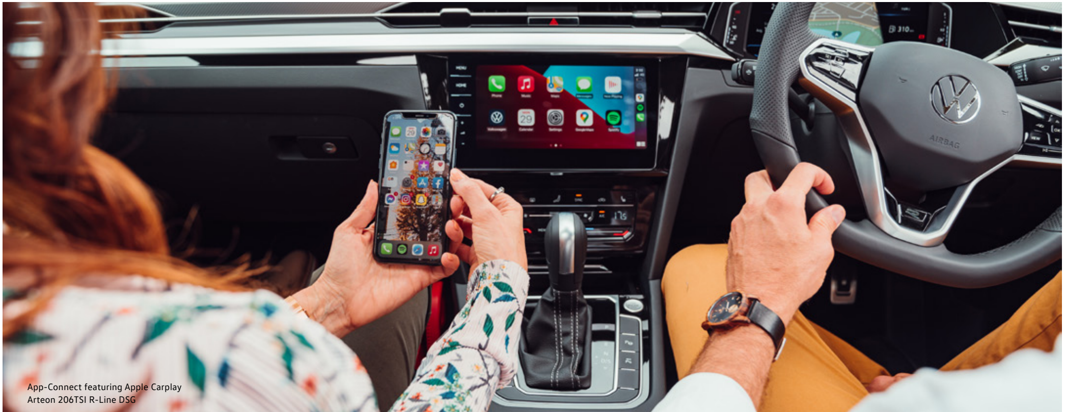
App-Connect featuring Apple Carplay Arteon 206TSI R-Line DSG

# Please note figures are sourced from overseas data where equipment levels by model variant may vary.