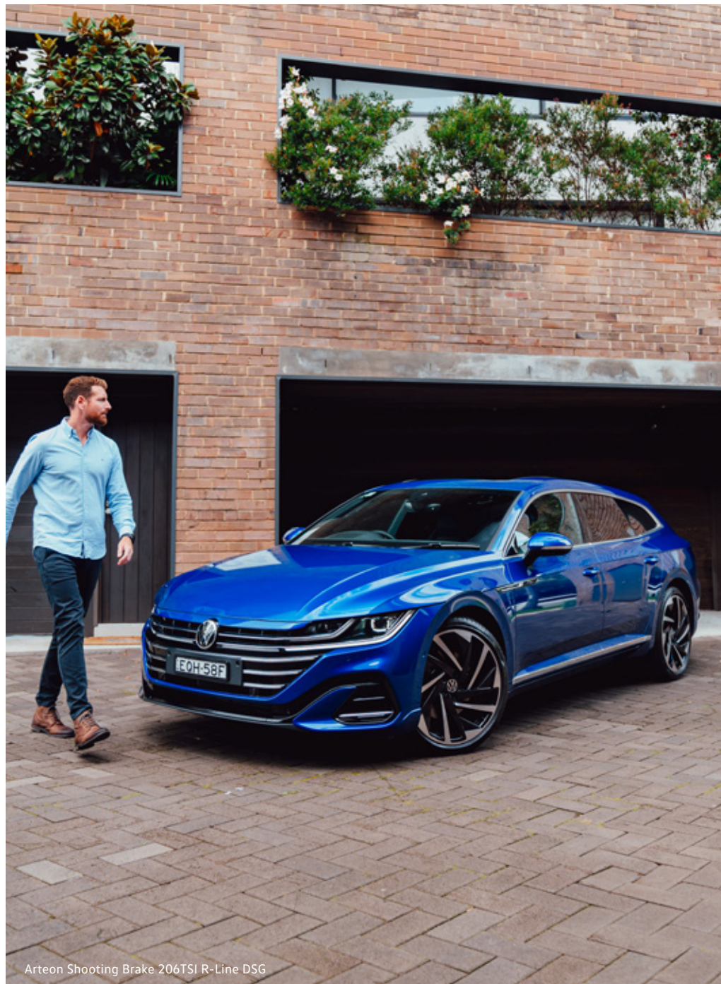
Arteon Shooting Brake 206TSI R-Line DSG