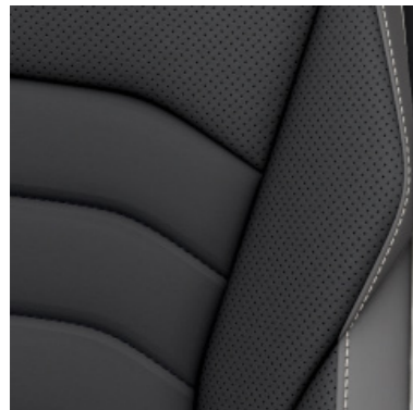
Titan Black Nappa Leather appointed seats* Standard on Arteon & Arteon Shooting Brake 140TSI Elegance