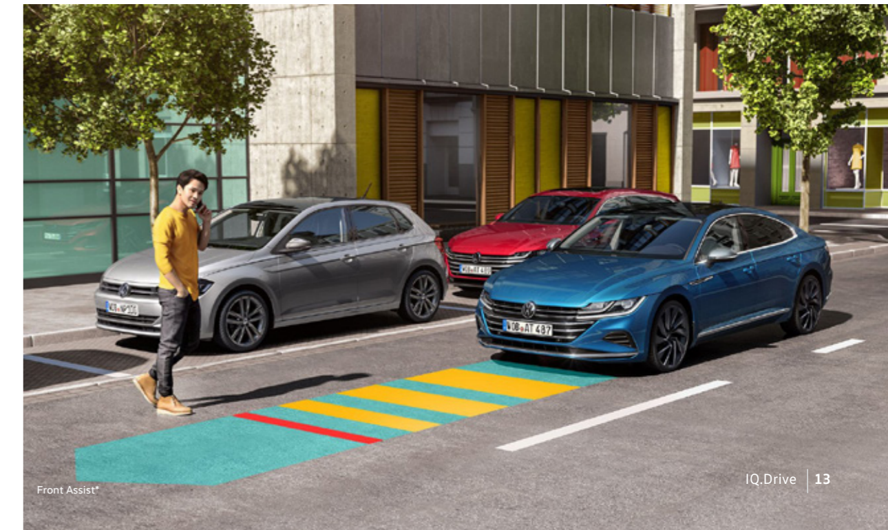
Front Assist ^