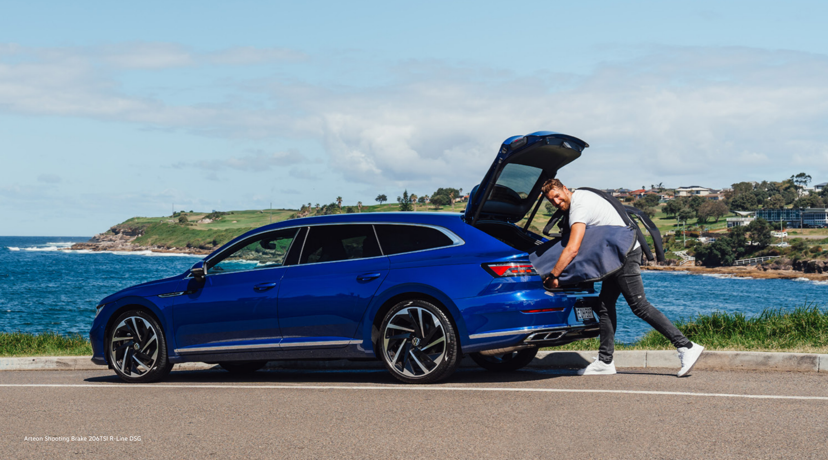
Arteon Shooting Brake 206TSI R-Line DSG