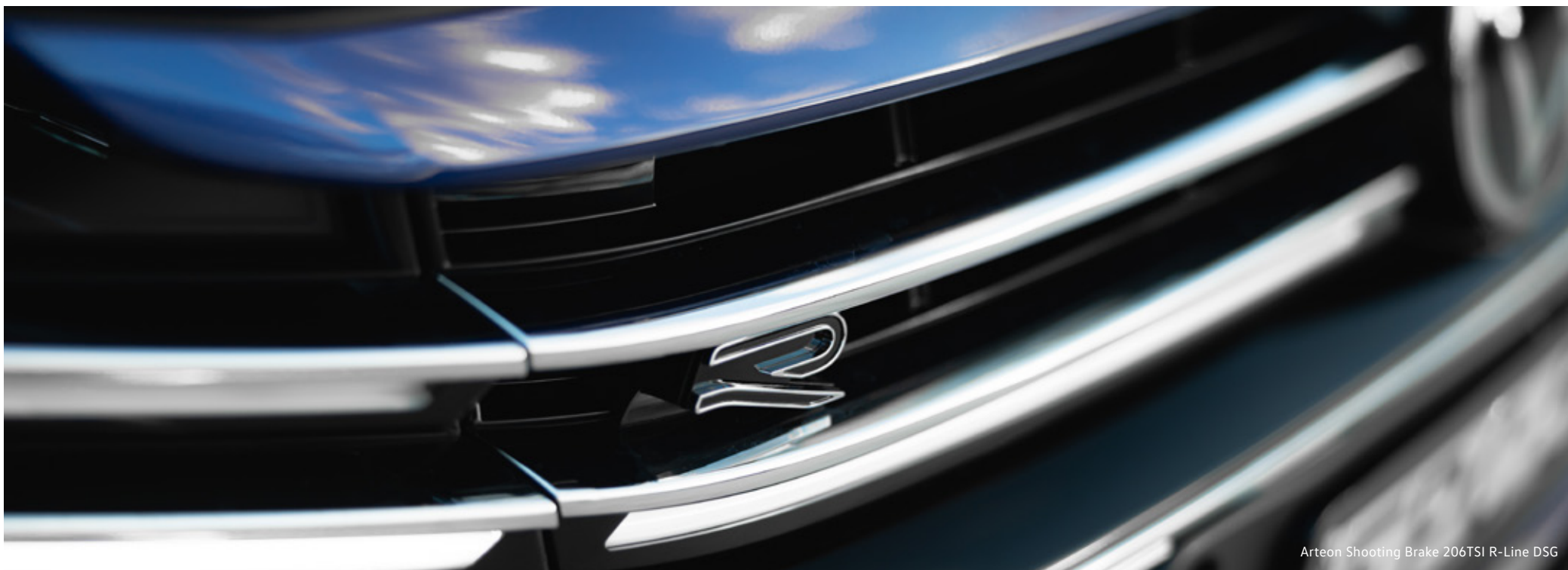
Arteon Shooting Brake 206TSI R-Line DSG