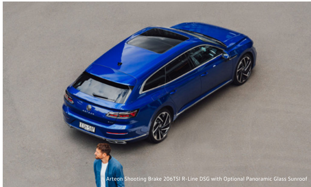
Arteon Shooting Brake 206TSI R-Line DSG with Optional Panoramic Glass Sunroof