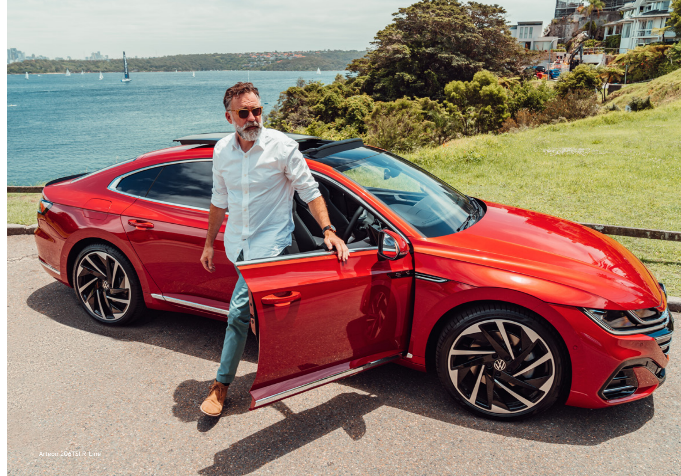
Arteon 206TSI R-Line