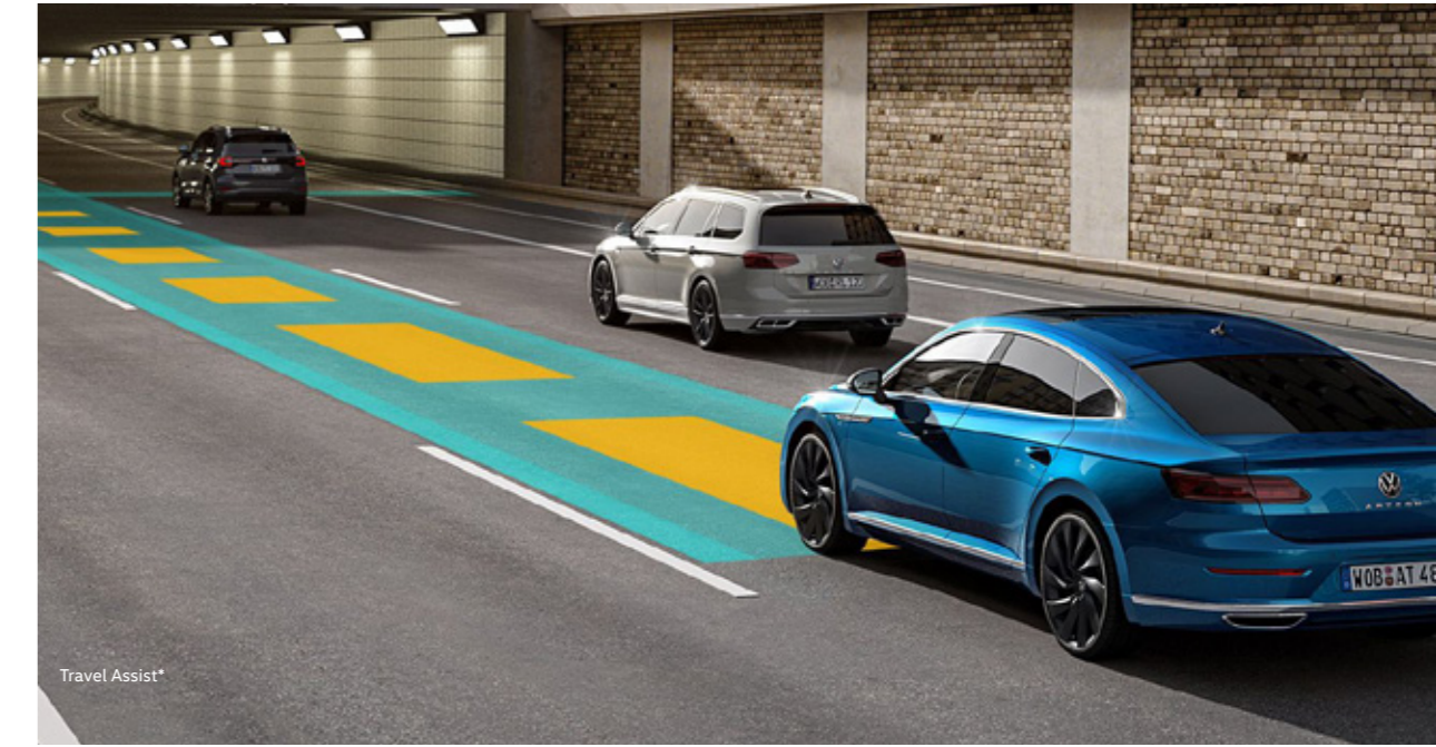
Travel Assist ^