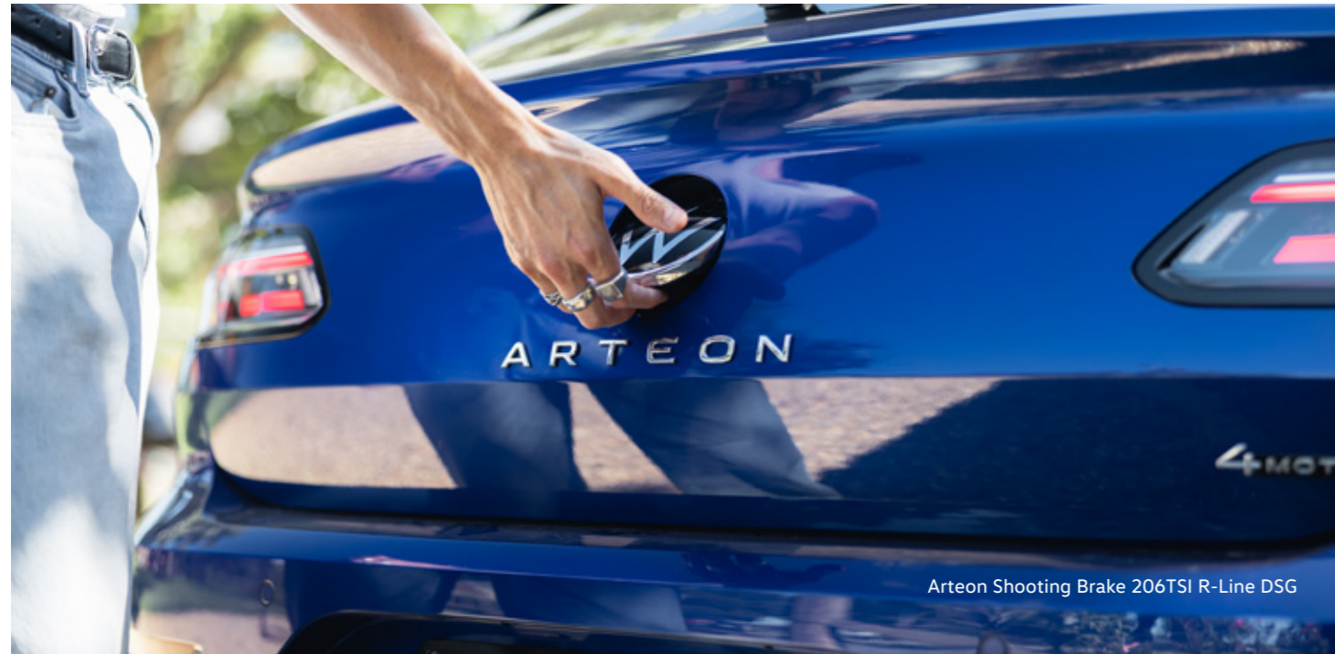
Arteon Shooting Brake 206TSI R-Line DSG

Volkswagen's R-Line vehicles are synonymous with sporty design, so it's no surprise the 206TSI R-Line should exhibit a number of subtly aggressive design features. Distinctive R-Line front and rear bumpers set the 206TSI R-Line apart from the 140TSI Elegance model, as does the prominent dual chrome exhaust trim at vehicle rear.