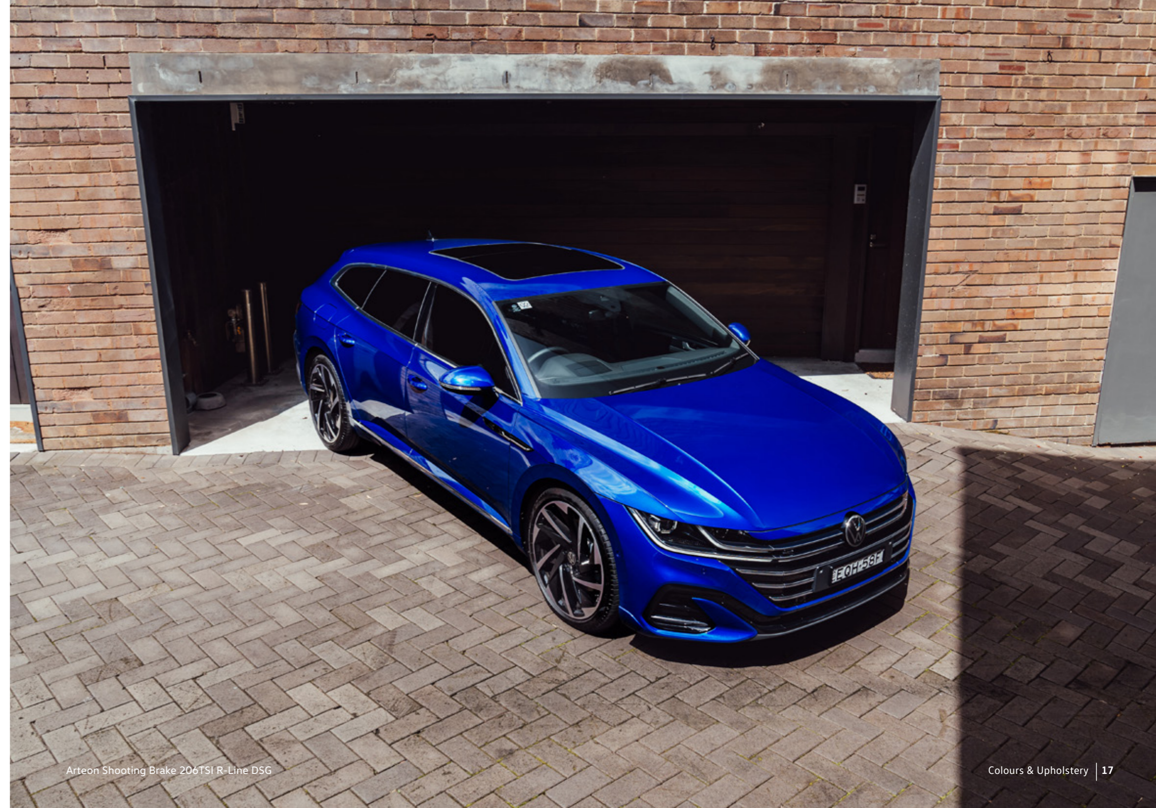
Arteon Shooting Brake 206TSI R-Line DSG

The print process does not allow for exact reproduction of the exterior or the upholstery colours. Please contact your Volkswagen Dealer for further information on colours and upholstery combinations