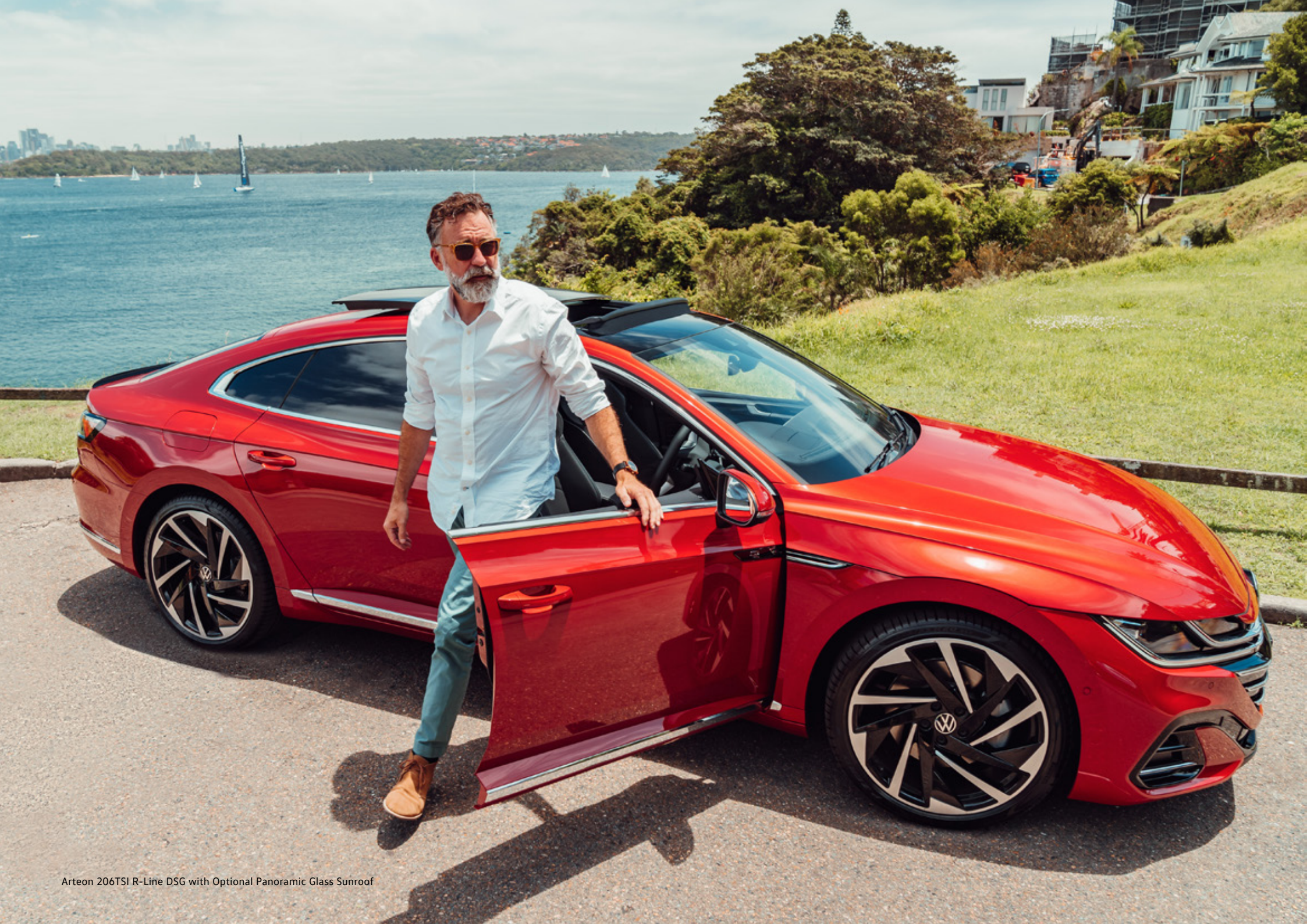
Arteon 206TSI R-Line DSG with Optional Panoramic Glass Sunroof