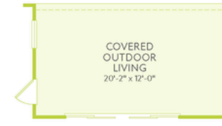
Opt. Sliding Glass Door