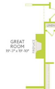
Opt. Fireplace At Great Room