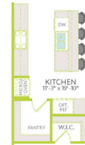
Opt. Gourmet Kitchen