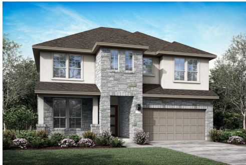
EXTERIOR STYLE K