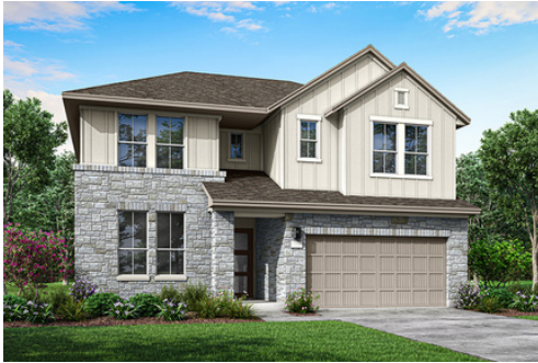
EXTERIOR STYLE J

2,864 Sq. Ft. | 4 Bed | 3 Bath | 2 Bay Garage | +Flex & Game Room