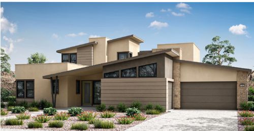
3C - MID-CENTURY MODERN