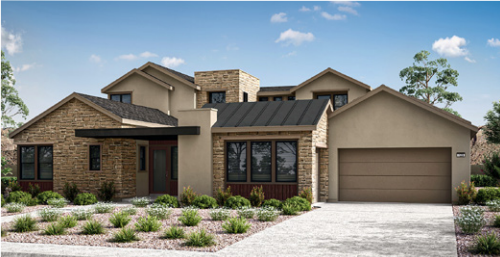
3A - TERRITORIAL RANCH