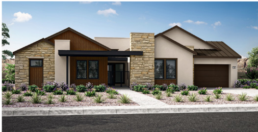
2A - TERRITORIAL RANCH