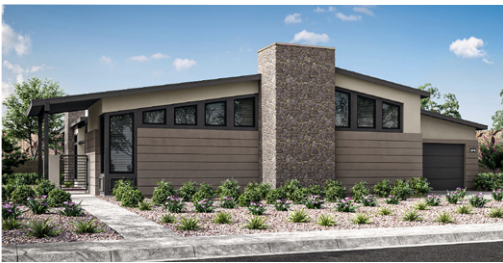
1C - MID-CENTURY MODERN