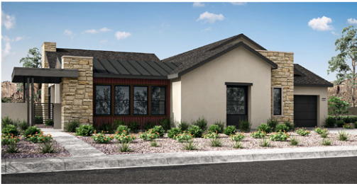
1A - TERRITORIAL RANCH