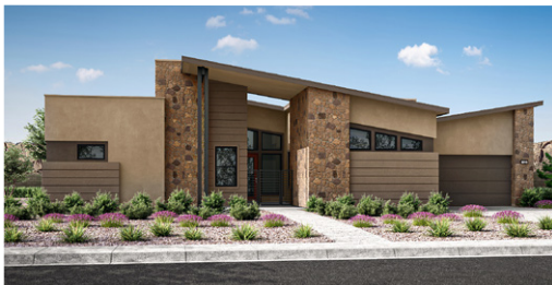
2C - MID-CENTURY MODERN