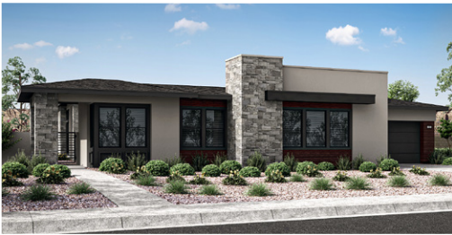
1B - PRAIRIE