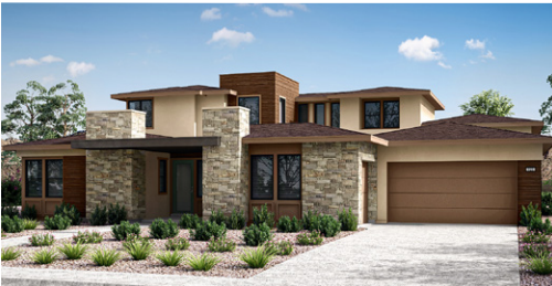
3B - PRAIRIE