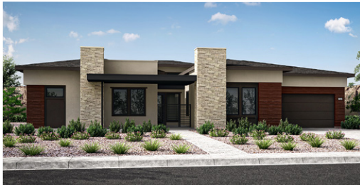
2B - PRAIRIE