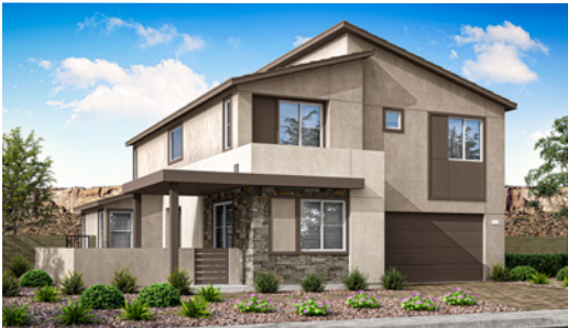
3B - NEW CENTURY