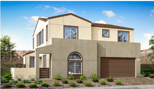
2A - NEW HACIENDA

2,557 sq ft | 3 - 4 Bedrooms | 2.5 - 3 Baths | 2 Bay Garage