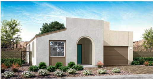
1A - NEW HACIENDA