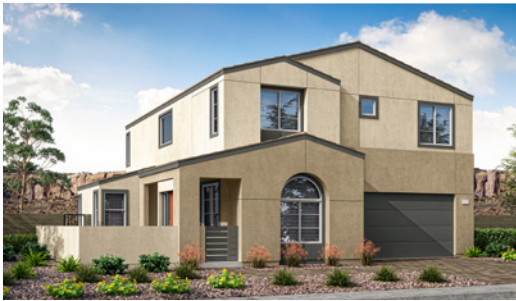
3A - NEW HACIENDA