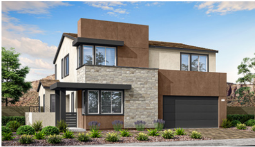
2C - MODERN