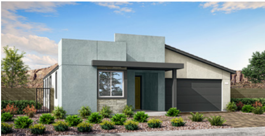
1B - NEW CENTURY