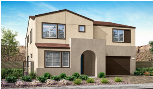
4A - NEW HACIENDA

3,539 sq ft | 4 - 5 Bedrooms | 2.5 - 3.5 Baths | 2 Bay Garage