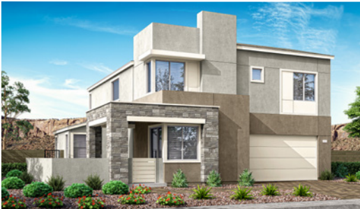
3C - MODERN