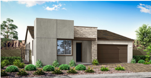
1C - MODERN