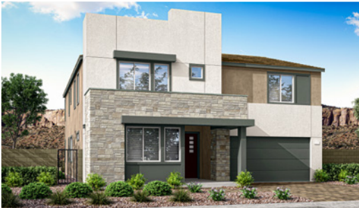
4C - MODERN

Optional Center Glass Sliding Door at Kitchen