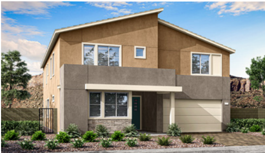
4B - NEW CENTURY