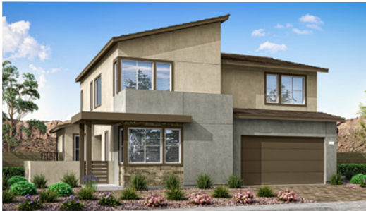
2B - NEW CENTURY