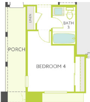
Optional Bedroom 4 with Bath 3