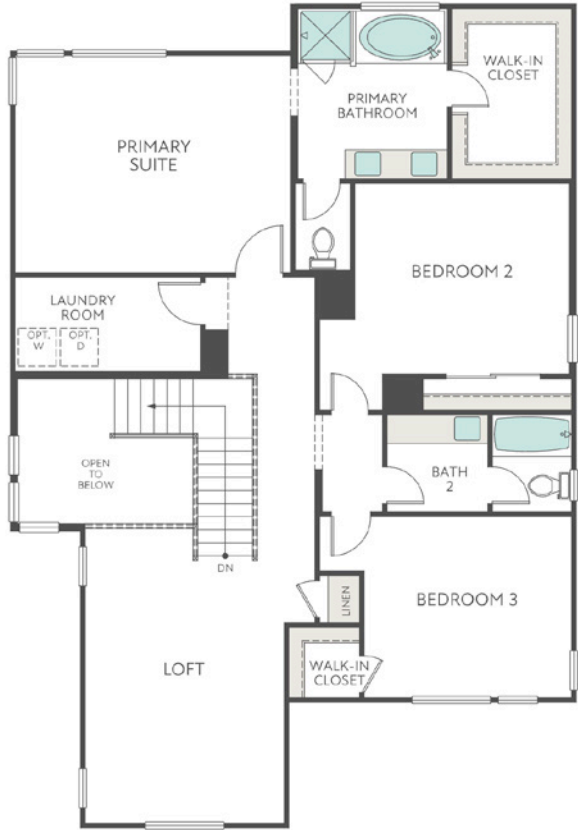
Optional Laundry Upper Cabinets